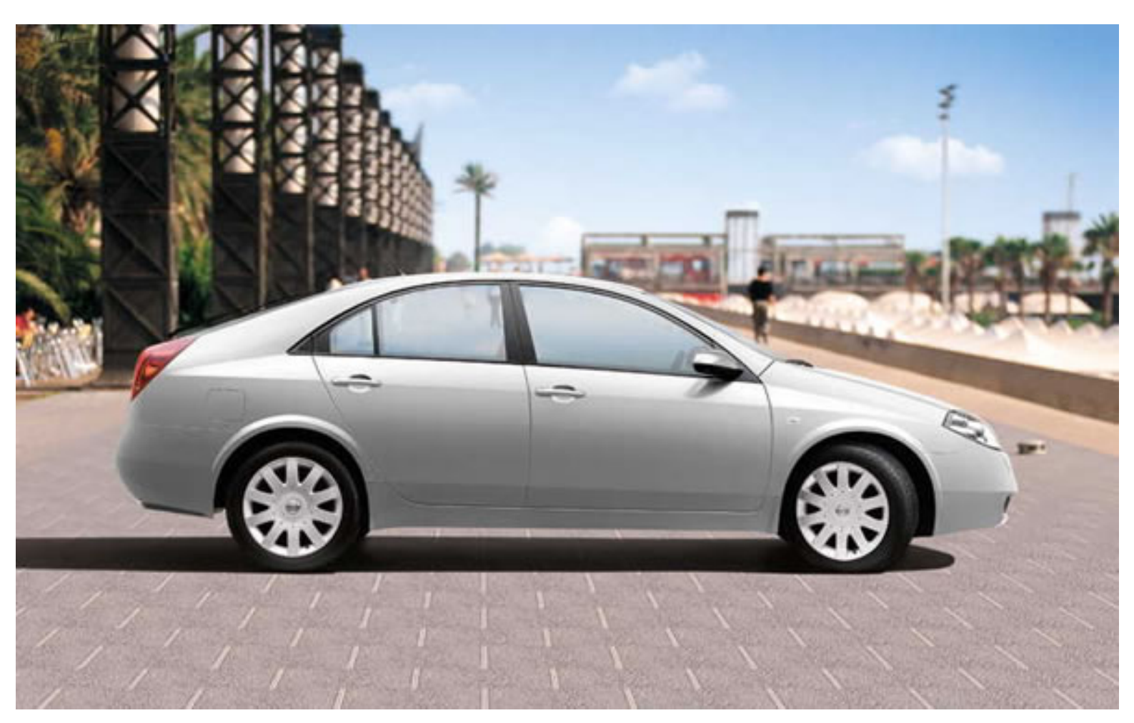
Created on 14 December 2006 05:10 (UK time)