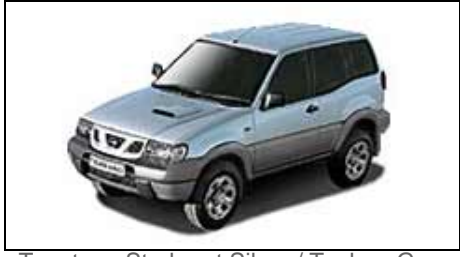
Two-tone Starburst Silver / Techno Grey