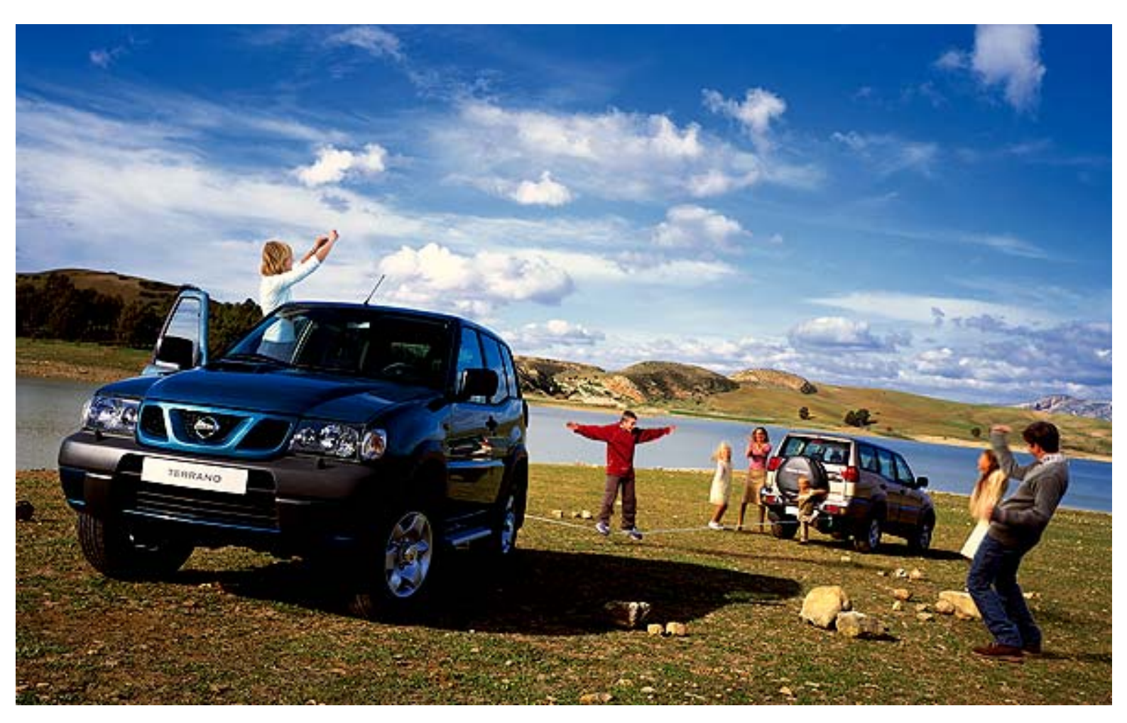
Created on 15 December 2006 05:12 (UK time)