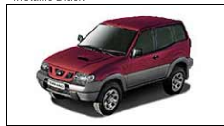
Two-tone Claret / Techno Grey