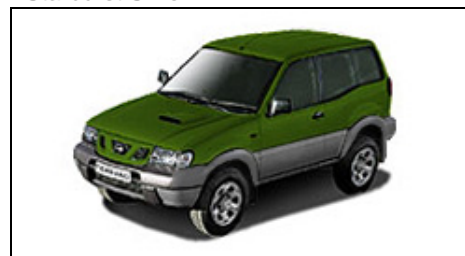
Two-tone Amazon Green / Techno Grey (M)