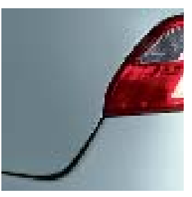
Icy Blue Metallic