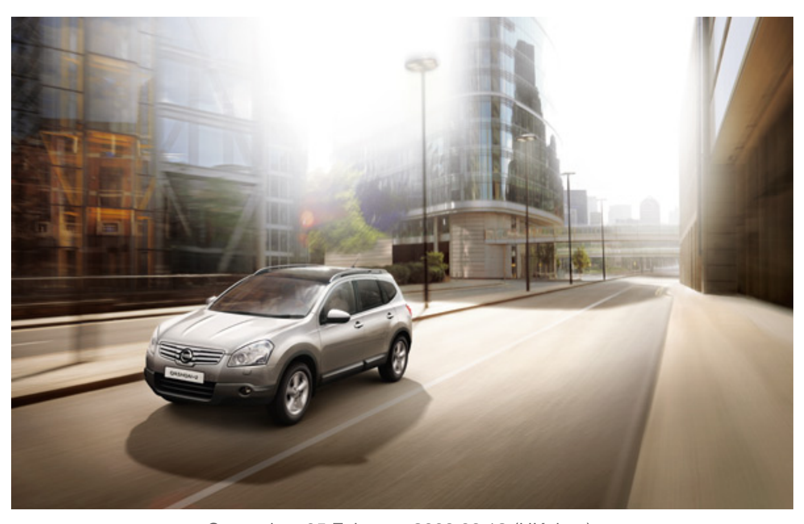
Created on 05 February 2009 06:12 (UK time)