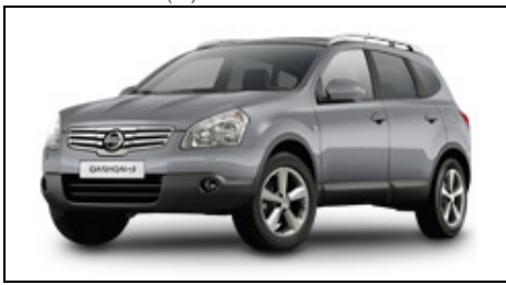
Urban Silver (M)