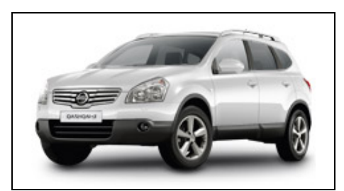
Arctic White (S)