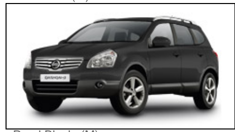
Pearl Black (M)