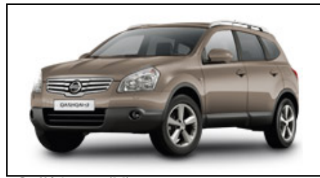
Caffé Latte (M)