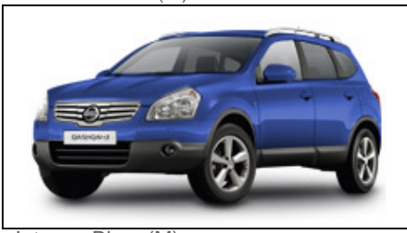
Intense Blue (M)