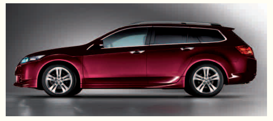
Basque Red Pearl