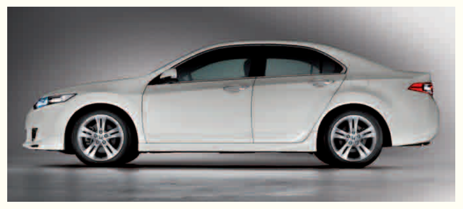
Premium White Pearl

The Premium White Pearl and Basque Red Pearl paint finishes shown below are exclusive to the Accord Type S. It is also available in Milano Red, Polished Metal Metallic and Buran Silver Metallic.