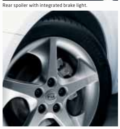
5-spoke 17" alloy wheel (standard on '3' grade).