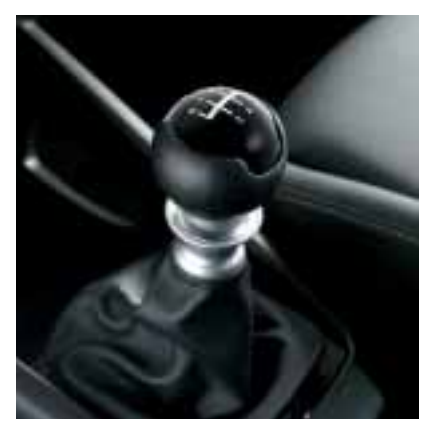
Sporty gearshift lever.