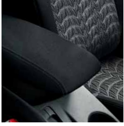
Leather armrest with stitch detailing.