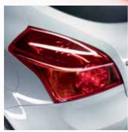
Multi-dimensional rear lights.

The Kia pro_cee'd is a star in its own right. Elongated doors and a strong shoulder-line accentuate the dynamic wedge-shape profile. But there are more distinctive features to discover: the sports grille, the wide bumper and stylish spoiler on the rear roof line, black bezel headlamps, striking rear light clusters and the finishing touch - a bold stainless steel exhaust pipe, creating a bold yet agile look.