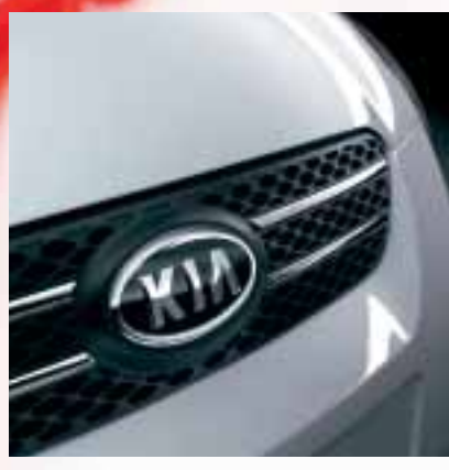
Striking sports pro_cee'd grille.