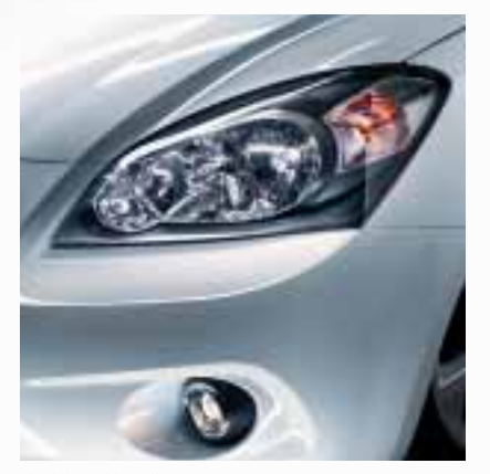
Black bezel headlamps.