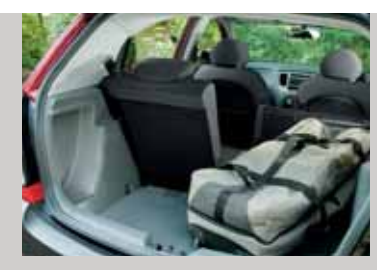
60:40 split folding rear seats can be lowered to increase the already generous luggage compartment.