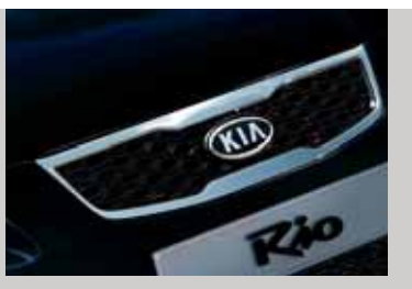
The chrome finish on the signature "tigernose" grille gives the Rio an unmistakably confident, sporty appearance.

Certain features are model dependent. Check with your local dealer for full availability.