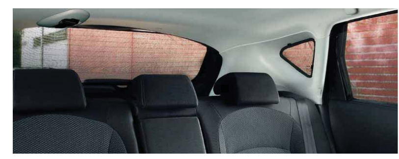
Sunblinds (83 - 85) Invest in a set of sunblinds: ideal protection for a shady interior.