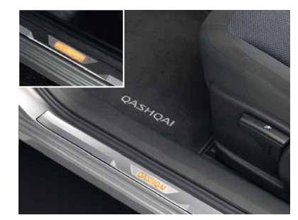
Illuminated entry guards (**) Illuminate the way ahead (as well as in and out). As soon as you open the door, the QASHQAI logo lights up.