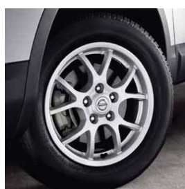
16" Shiga alloy wheels (16) Guarantee a shining performance with 16" alloy wheels.