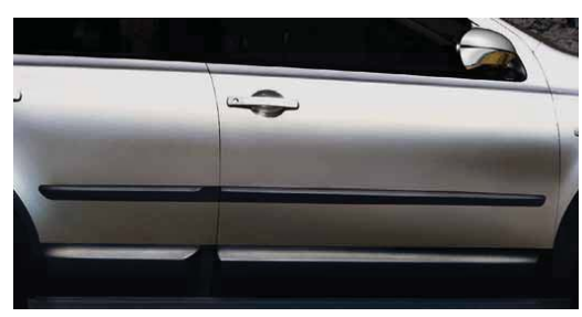
Body side mouldings (45)

Fill that space thanks to the front and rear parking sensors: your street-wise guide will helpfully bleep you in.