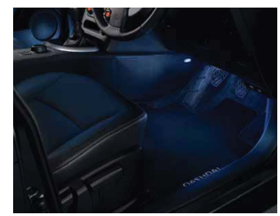
Ambience lighting* (11) Adjust the mood inside the cabin with funky LEDS. 8 different colour settings available.