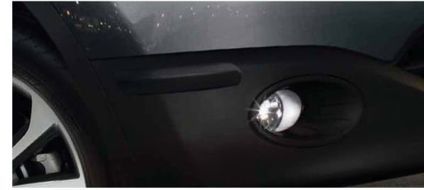
Bumper corner protection (44)

Protect your extremities with these bumper corner protectors.