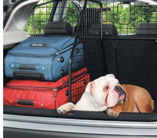
Partition rack (88) and trunk divider (89)

Cushion the trunk with this supple liner and avoid any scrapes with the tailgate entry guard.