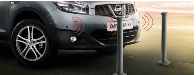
Front (03) and rear (02) parking sensors

Fill that space thanks to the front and rear parking sensors: your street-wise guide will helpfully bleep you in.