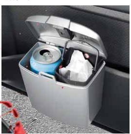
Litter bin (97)