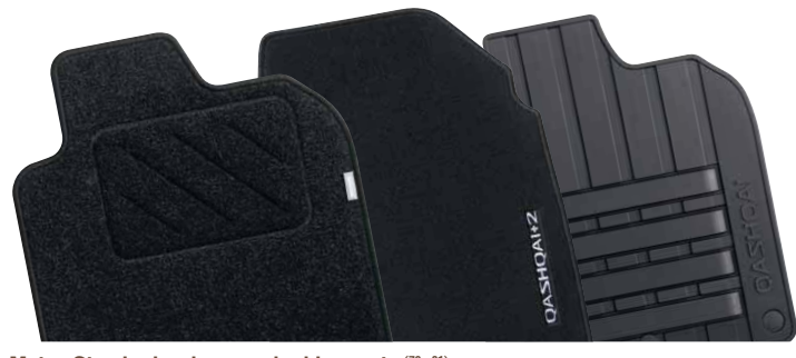
Mats - Standard, velours and rubber mats (79 - 81) Maintain ground control thanks to QASHQAl's custom-built floor mats in textile or rubber.