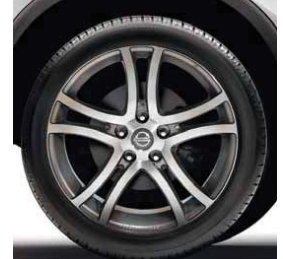
18" Accessory alloy wheels (15) Give yourself the wow-factor with 18" alloy wheels.

Look sharp with chrome mirror caps and wind deflectors. Roll down the window and enjoy the view without the interference of wind noise or turbulence.