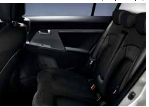
Rear passengers travel in comfort and style.