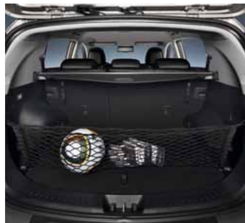
The luggage area also features net hooks and a net to secure smaller items (excluding Sportage '1').