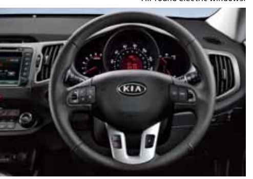
Steering Wheel Mounted Controls.