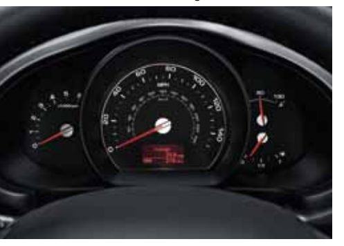
Trip computer display.