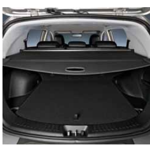
The luggage cover hides belongings away from prying eyes.