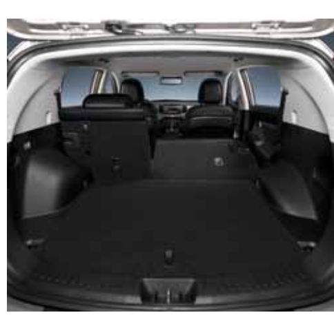
Rear space for plenty of storage.