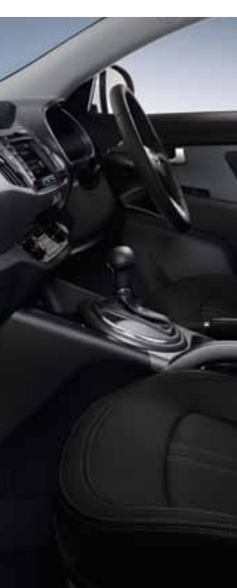
Images are for illustration purposes only and may not be to UK specification.