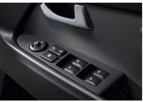
All-round electric windows.