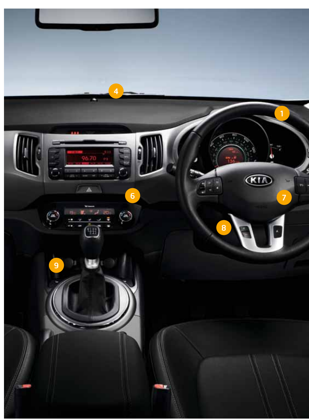
Model shown is Sportage '3' specification.