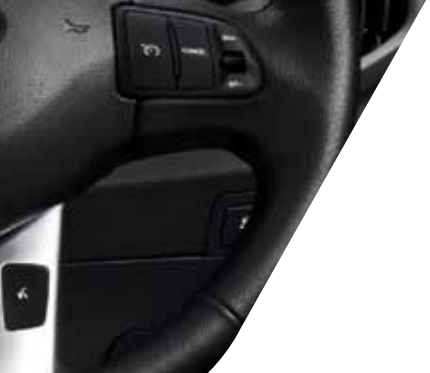
More freedom, thanks to hands-free Bluetooth® with Voice Recognition and Music Streaming.

Images are for illustration purposes only and may not be to UK specification.