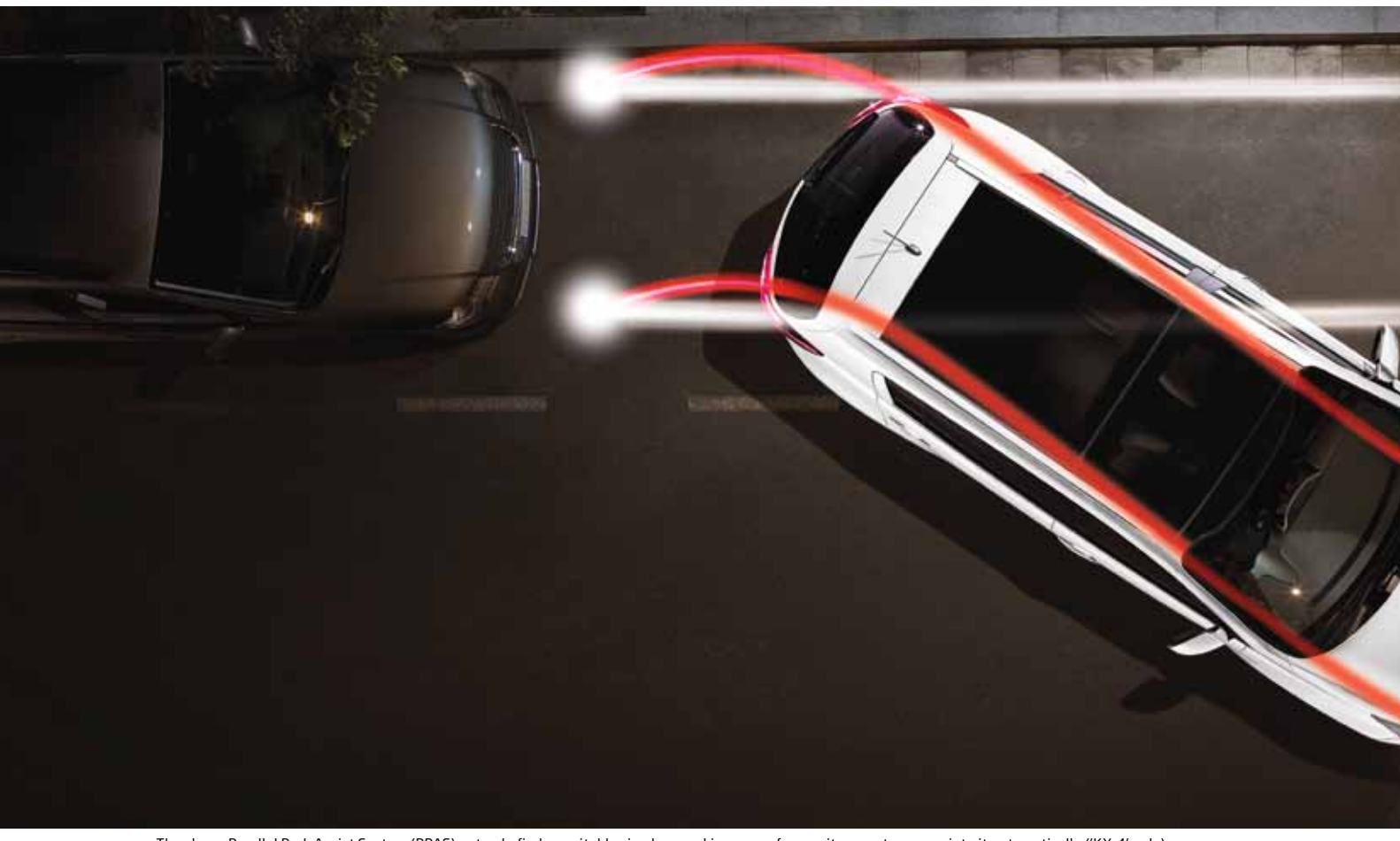
The clever Parallel Park Assist System (PPAS) not only finds a suitably sized car parking space for you it even steers you into it automatically ('KX-4' only).