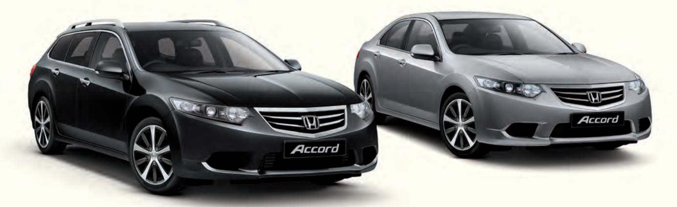
Models shown are Tourer 2.2 i-DTEC ES and Saloon 2.0 i-VTEC ES