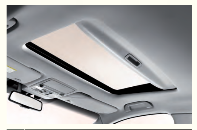
Electric sunroof with sunshade