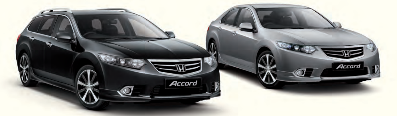
Models shown are Tourer and Saloon 2.0 i-VTEC ES-GT