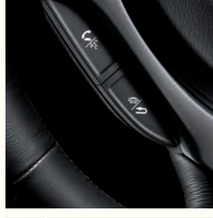
> Audio controls > Bluetooth® HFT