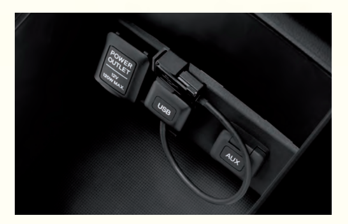
> USB connector and Auxiliary sockets