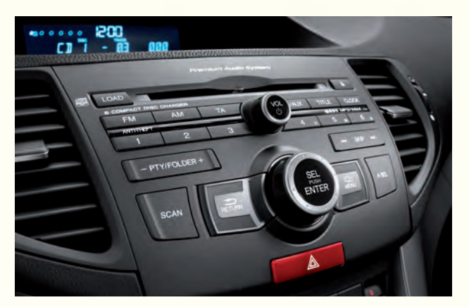
Stereo CD with RDS and MP3