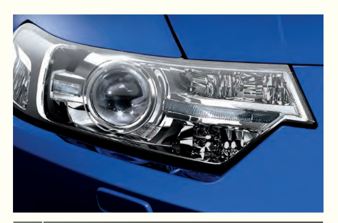
Bi-HID with Active Cornering Lights (ACL)