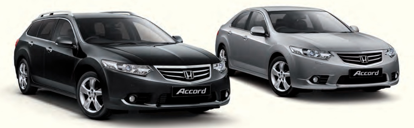
Models shown are Tourer and Saloon 2.0 i-VTEC EX with ADAS