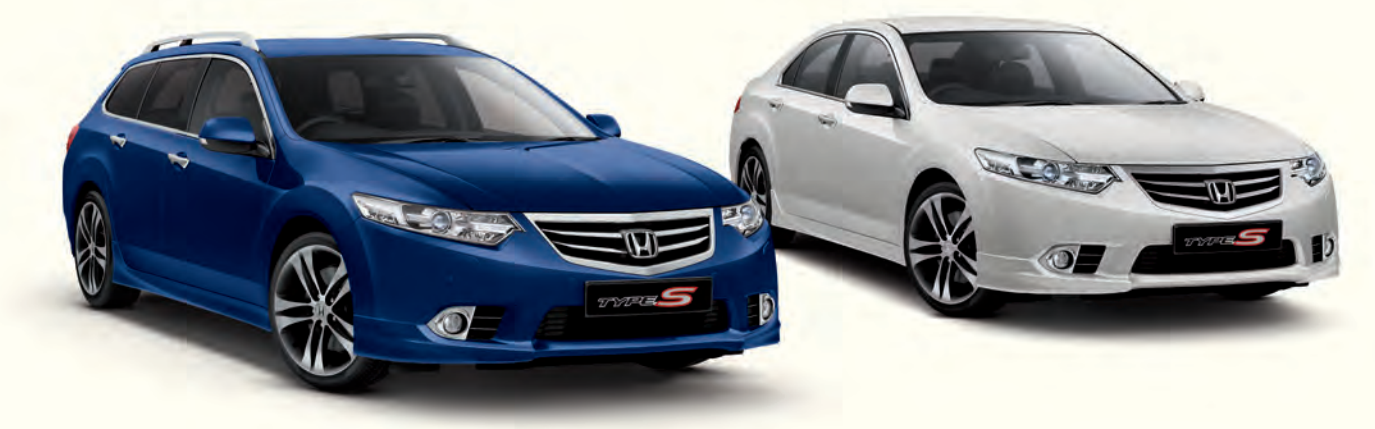
Models shown are Tourer and Saloon 2.2 i-DTEC Type S