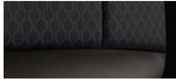
LT JET BLACK CLOTH/LEATHER APPOINTED