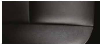
LTZ JET BLACK LEATHER APPOINTED