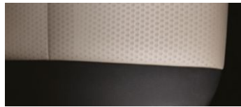
LTZ LIGHT TITANIUM LEATHER APPOINTED