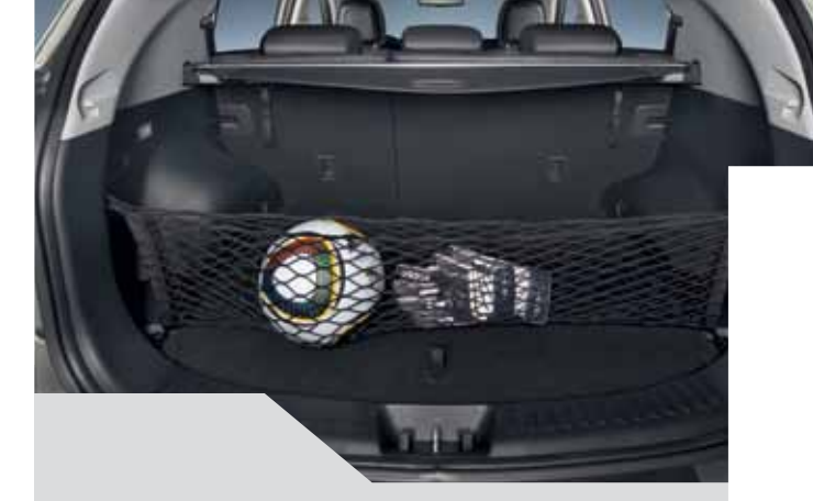
The luggage net ('2' models upwards) holds smaller items in place.