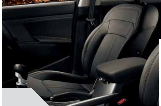
To create a luxurious feel, premium materials are used throughout the cabin.