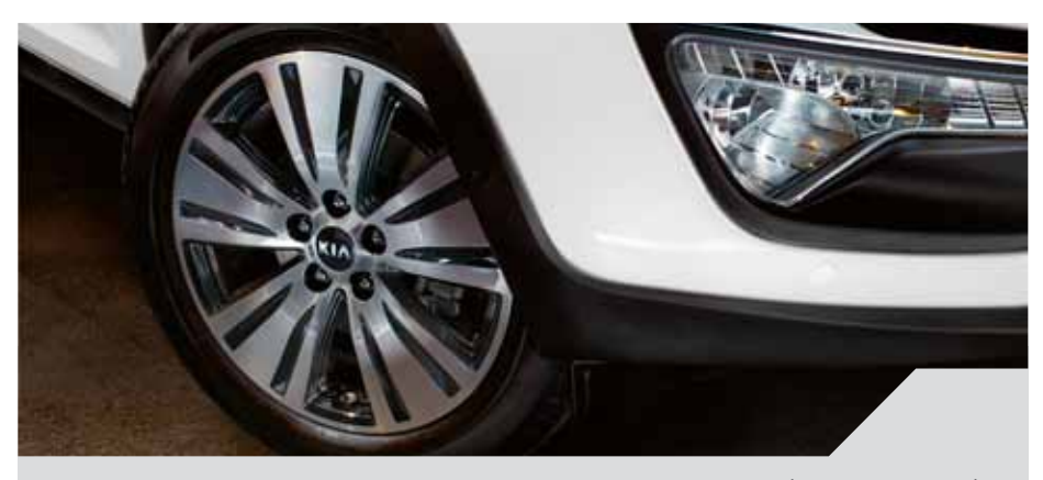
Stylish 18" alloy wheels in a new design ('3' grades upwards).