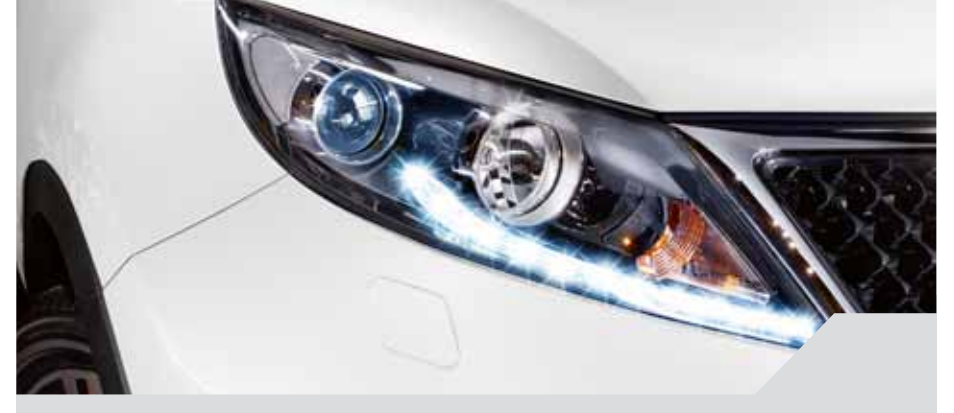
Striking LED daytime running lights significantly improve visibility to oncoming traffic.