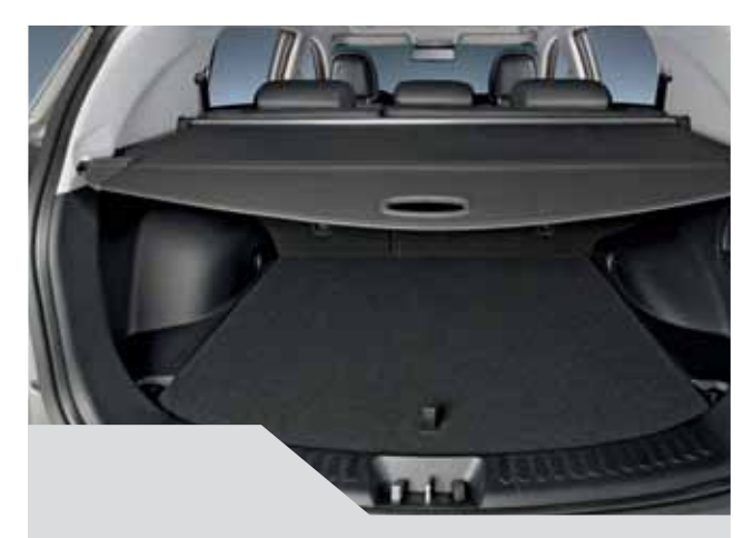
The luggage cover keeps your belongings away from prying eyes.