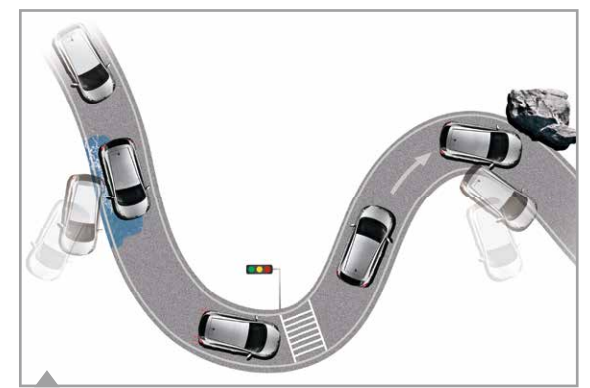
Electronic Stability Control (ESC) – if a loss of grip is detected, ESC applies the correct amount of brake pressure to each individual wheel, helping you maintain control and stability. It also reduces engine power to help you maintain control.