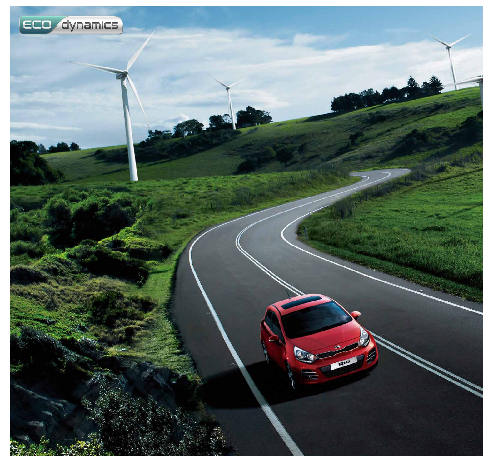
ISG does not operate where there is excessive drain on the vehicle's battery. During winter months use of headlights, the heated rear screen and other electrical loads may inhibit ISG. Please log onto www.kia.co.uk for further information or refer to your Kia owners' handbook.