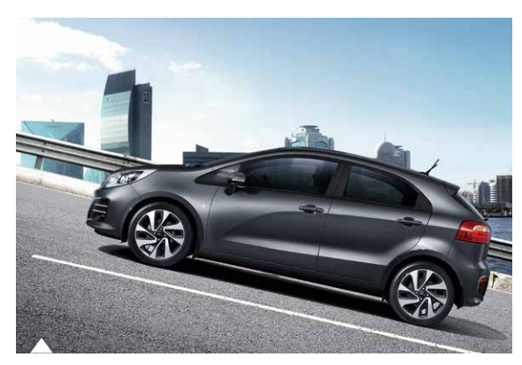
Hill-start Assist Control (HAC) – By maintaining brakeforce until you accelerate, HAC prevents the vehicle from rolling backwards when starting on a steep hill.