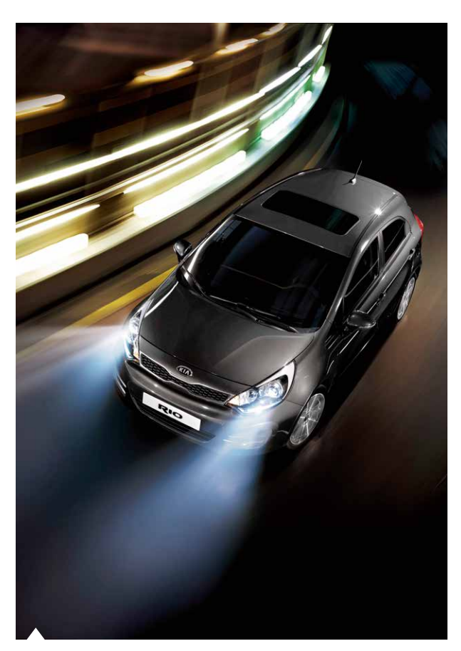
Cornering lights - When driving at night the cornering lights automatically turn on to illuminate potential hazards when turning (Rio '3' and '4' models)