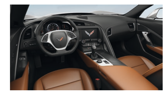
Also available with sueded microfiber inserts