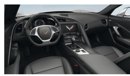
Also available with sueded microfiber inserts