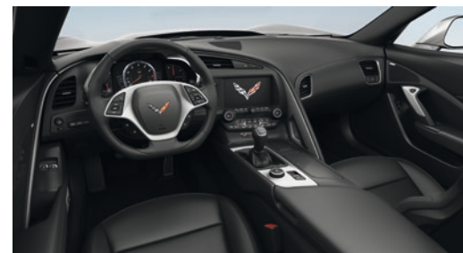
Also available with sueded microfiber inserts