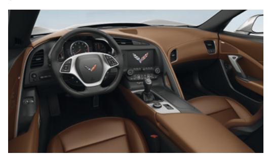
Also available with sueded microfiber inserts