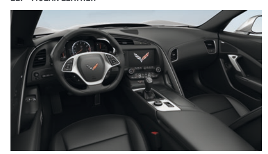
Also available with sueded microfiber inserts