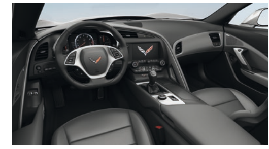
Also available with sueded microfiber inserts