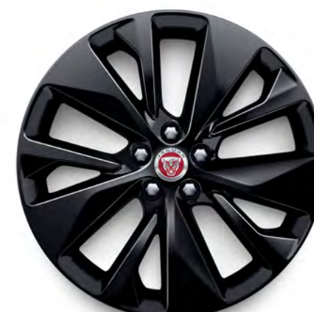
19" Style 5106, 5 split-spoke, Gloss Black