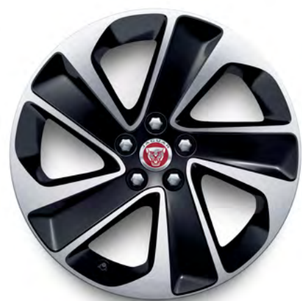
18" Style 5105, 5 spoke, Dark Grey Diamond Turned finish