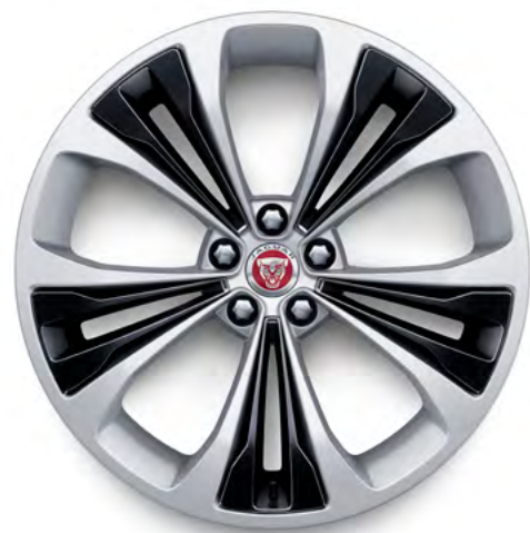
20" Style 5107, 5 split-spoke, Silver with Gloss Black Inserts