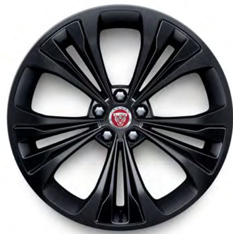
20" Style 5107, 5 split-spoke, Satin Black with Gloss Black inserts