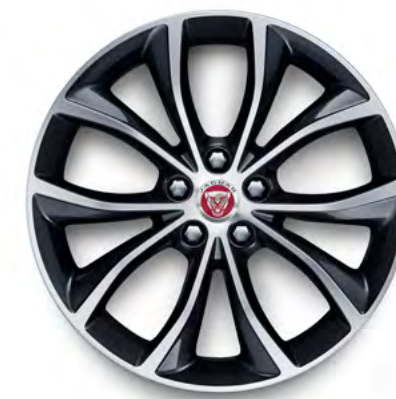
18" Style 5033, 5 split-spoke, Contrast Diamond Turned finish