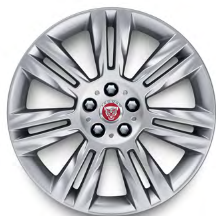
18" Style 7011, 7 split-spoke, Silver