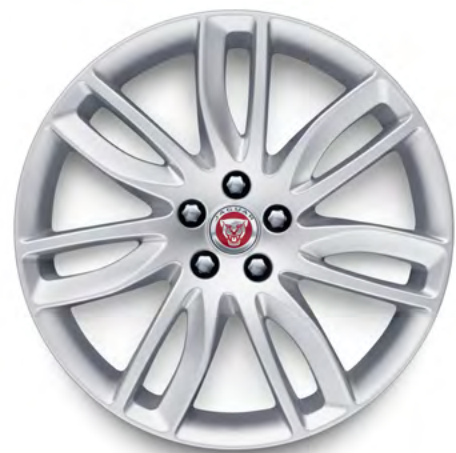
19" Style 7012, 7 split-spoke, Silver

Personalise your XF or XF Sportbrake with a selection of alloy wheels featuring a wide range of contemporary and dynamic designs.