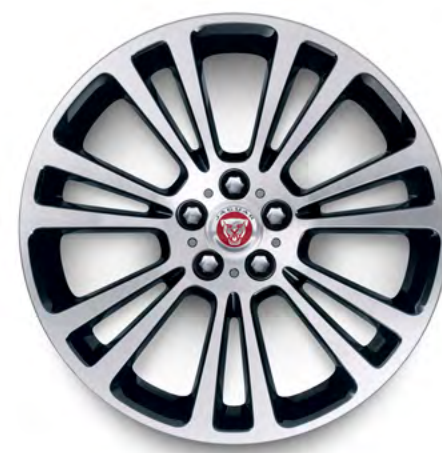
19" Style 7013, 7 split-spoke, Contrast Diamond Turned finish