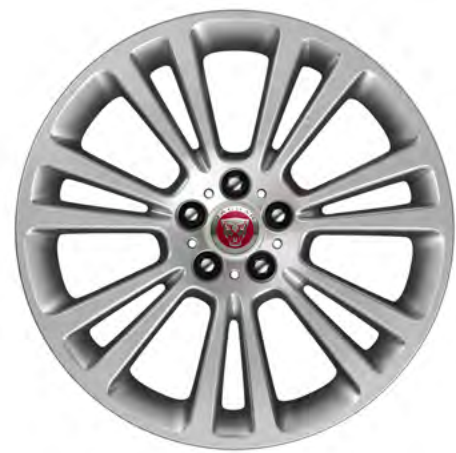
19" Style 7013, 7 split-spoke, Silver