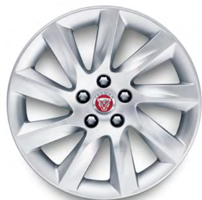
17" Style 9005, 9 spoke, Silver

Personalise your XF or XF Sportbrake with a selection of alloy wheels featuring a wide range of contemporary and dynamic designs.