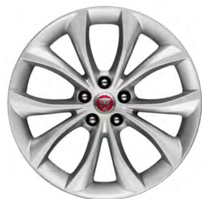
18" Style 5033, 5 split-spoke, Silver