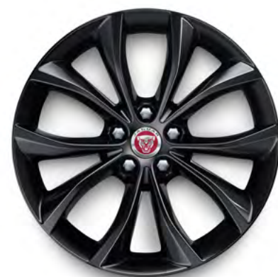
18" Style 5033, 5 split-spoke, Gloss Black