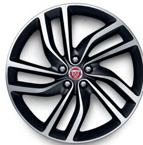
20" Style 5036, 5 split-spoke, Satin Dark Grey Diamond Turned finish