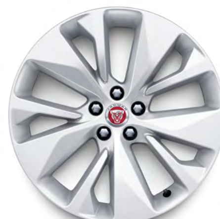
19" Style 5106, 5 split-spoke, Silver