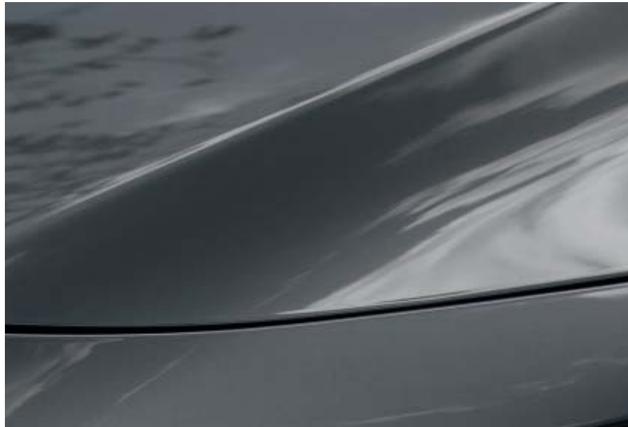
Machine Grey Metallic

Visit our website to see all the colour choices available.