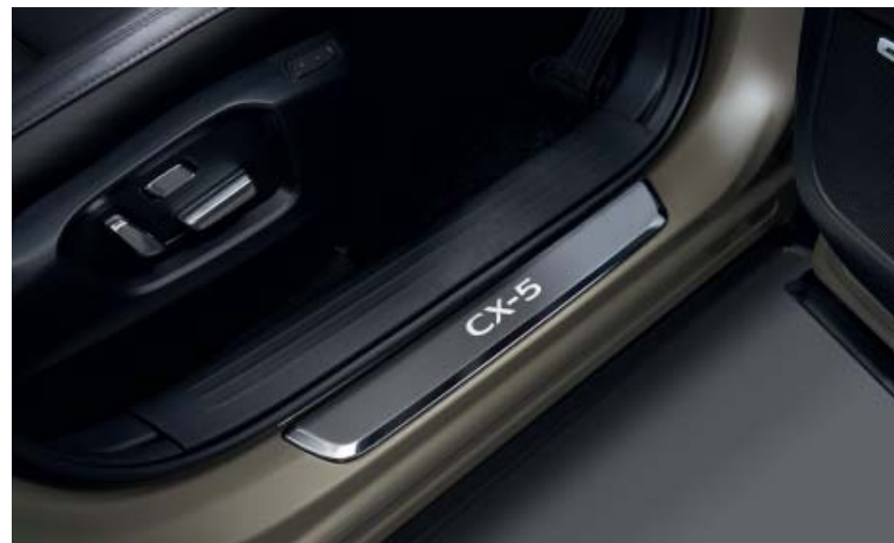
Illuminated Scuff Plates