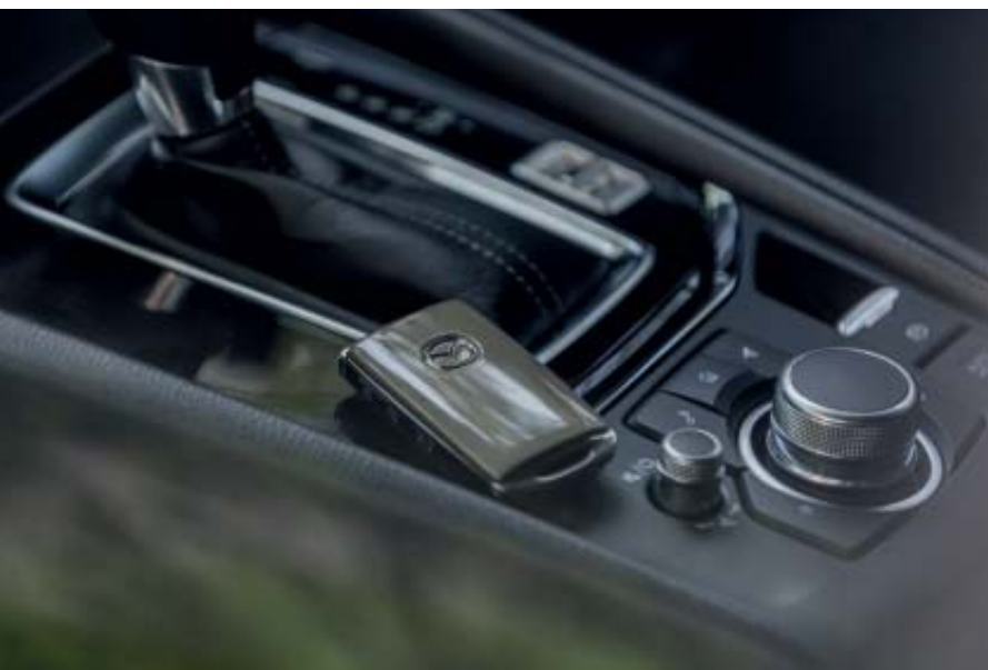
Premium Coloured Key Fob

Mazda has created thoughtfully designed accessories that perform seamlessly with your Mazda CX-5. For a full list of Genuine Mazda Accessories for your Mazda CX-5, visit https://www.mazda.co.uk/configurator/