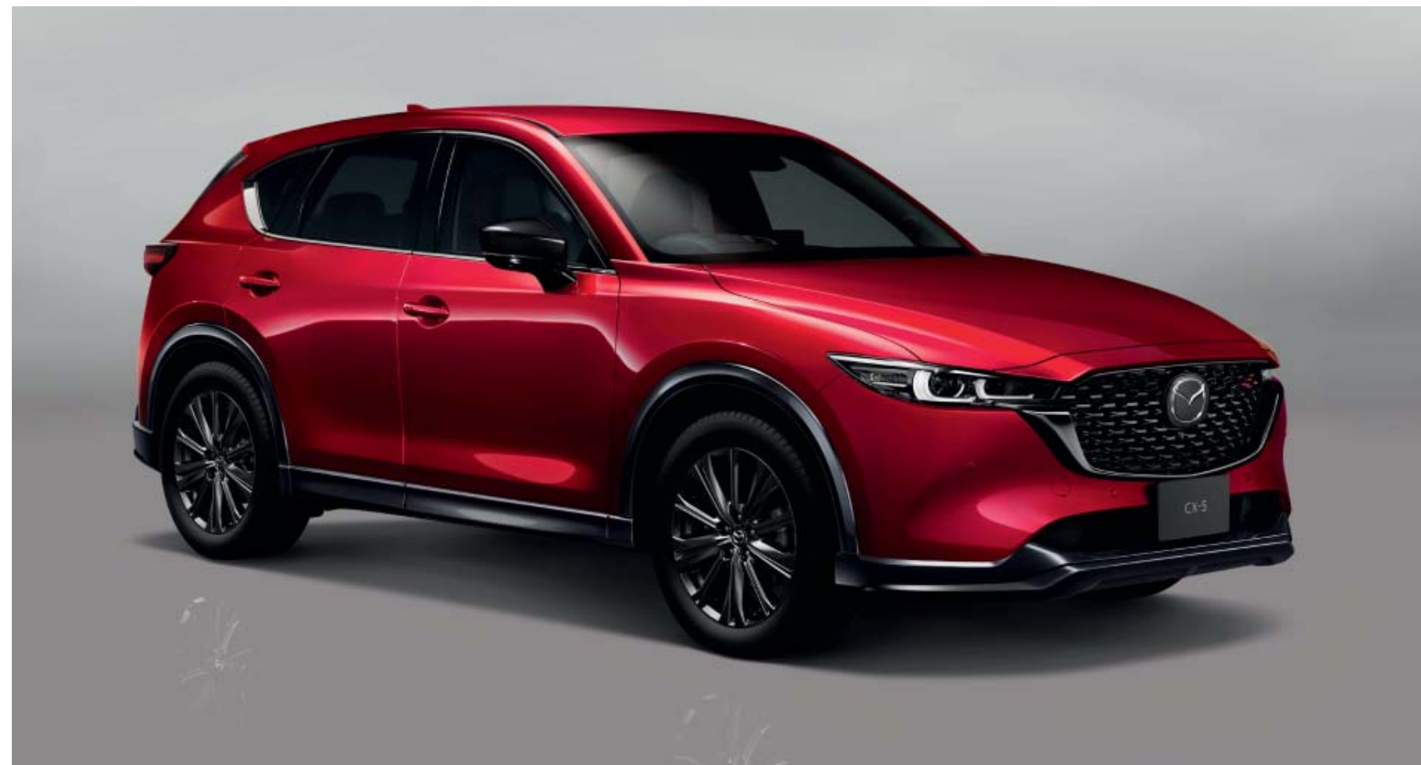
Front Air dam Skirt*

*Expected availability of the Airdam parts from summer 2022