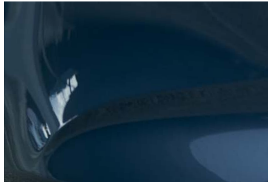
Polymetal Grey Metallic