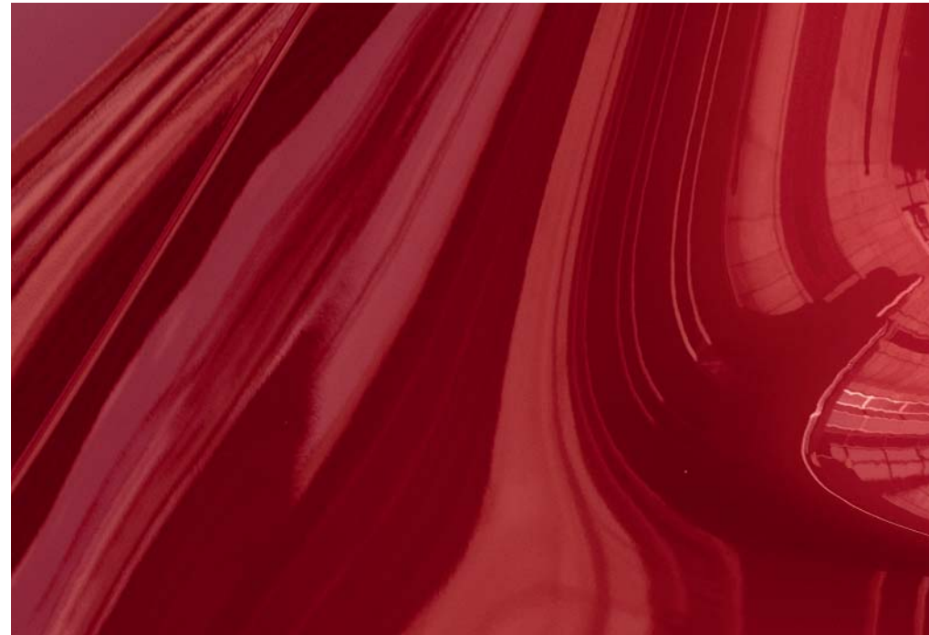
Soul Red Crystal Metallic