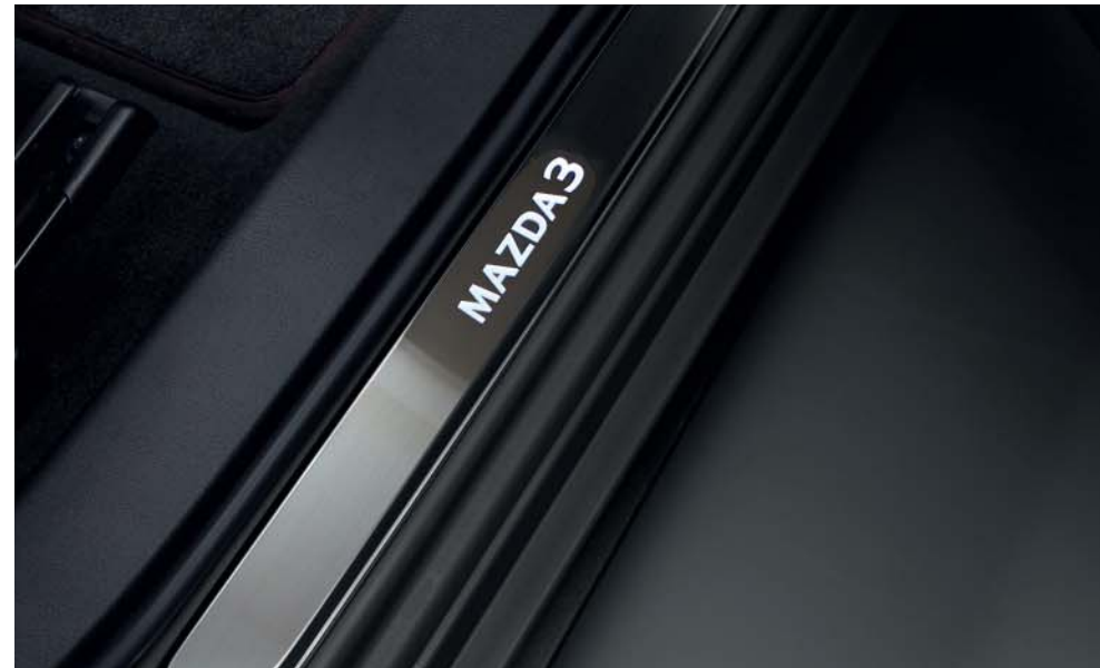
Illuminated Scuff Plates