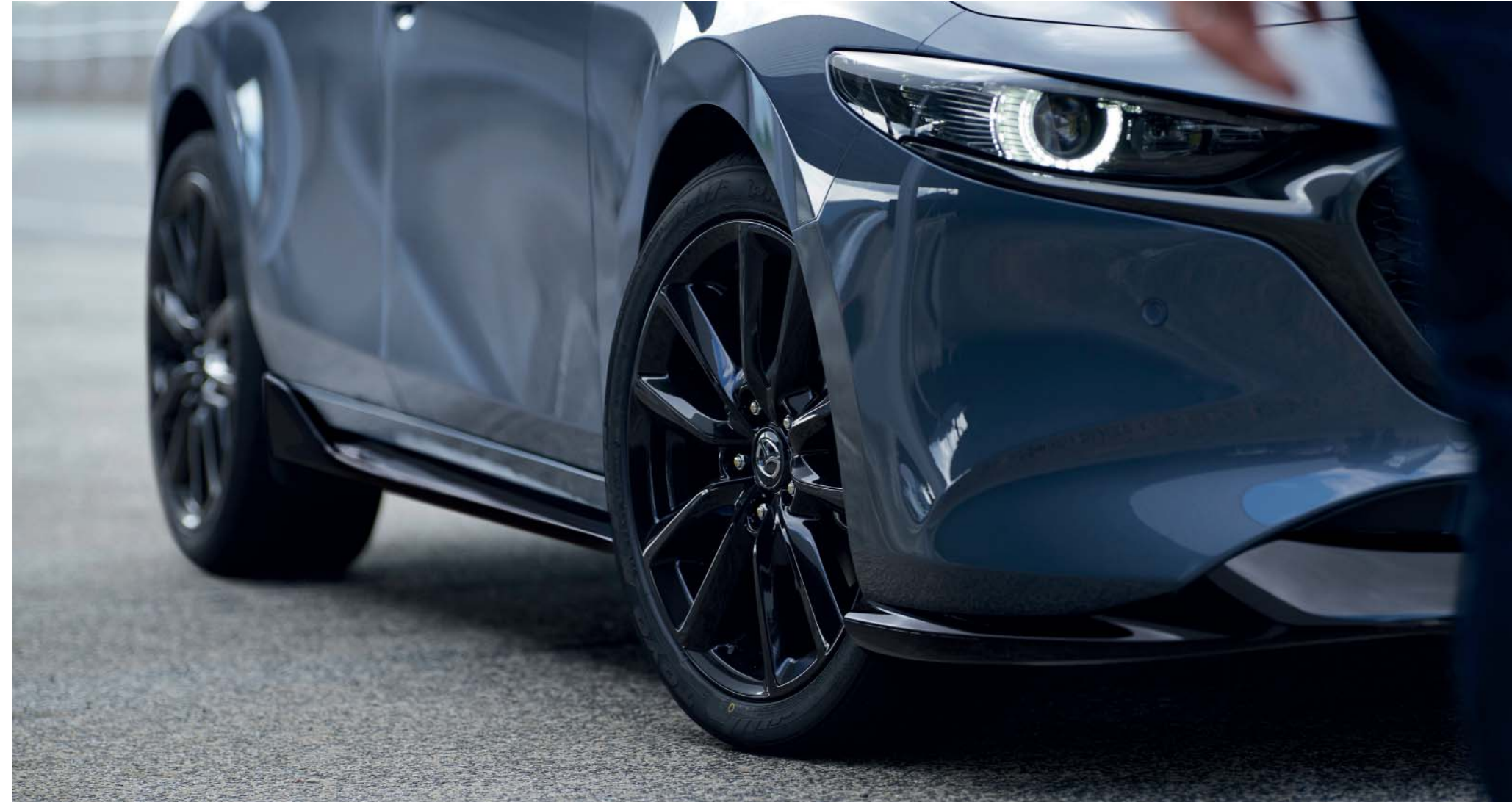
Aero Body Parts