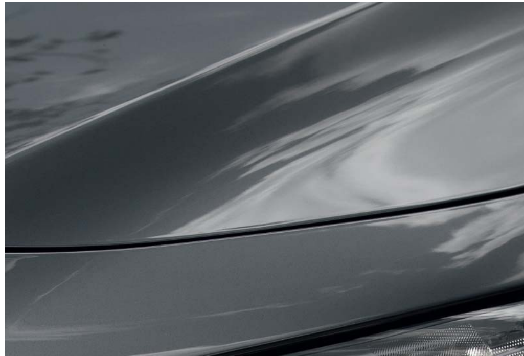
Machine Grey Metallic

The colour on the Mazda3 is one of the first things that will catch your attention. Our Polymetal Grey Metallic paint, available on hatchback models, possesses an entirely new appearance. A daring mixture of bright aluminium flakes and opaque pigment illuminates the beautiful characteristics of Kodo design. In one environment, light reflects vibrancy. In shade, it can strike an expression of warmth. Design and colour work in creative harmony to express a smooth and seductive appeal.