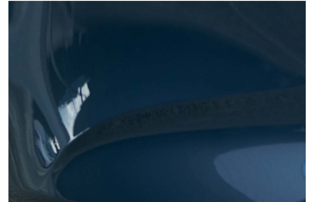
Polymetal Grey Metallic