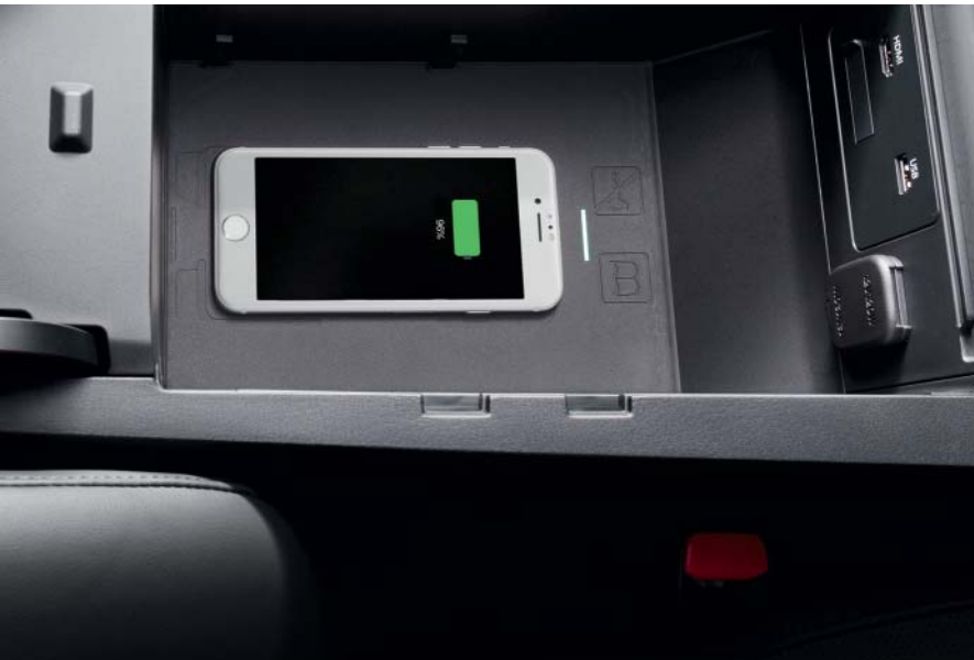
Qi Standard Wireless Charger

Mazda has created thoughtfully designed accessories that perform seamlessly with your Mazda3.