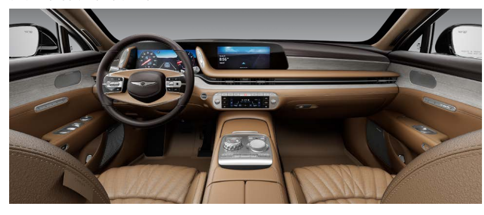
URBAN BROWN & GLACIER WHITE