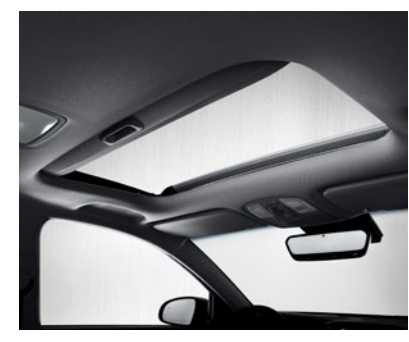
Available power sunroof