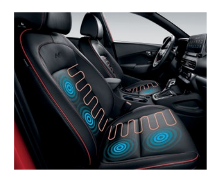
Standard heated front seats Available ventilated front seats