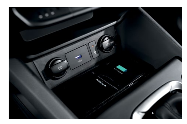
Available wireless charging pad ♥