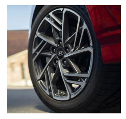
Available 18" alloy wheels