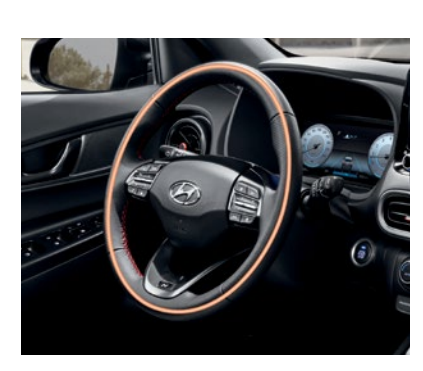
Available heated steering wheel