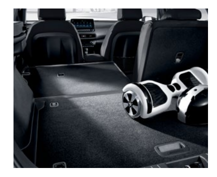
Standard 60/40 split-fold rear seats