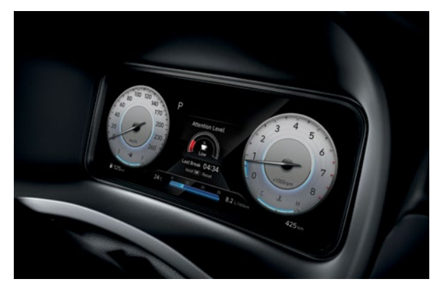
Available 10.25" full digital instrument cluster

Shopping across town? Late-night eats? Get around seamlessly with these impressive features.