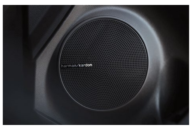
Available harman/kardon®* premium audio system with 8 speakers