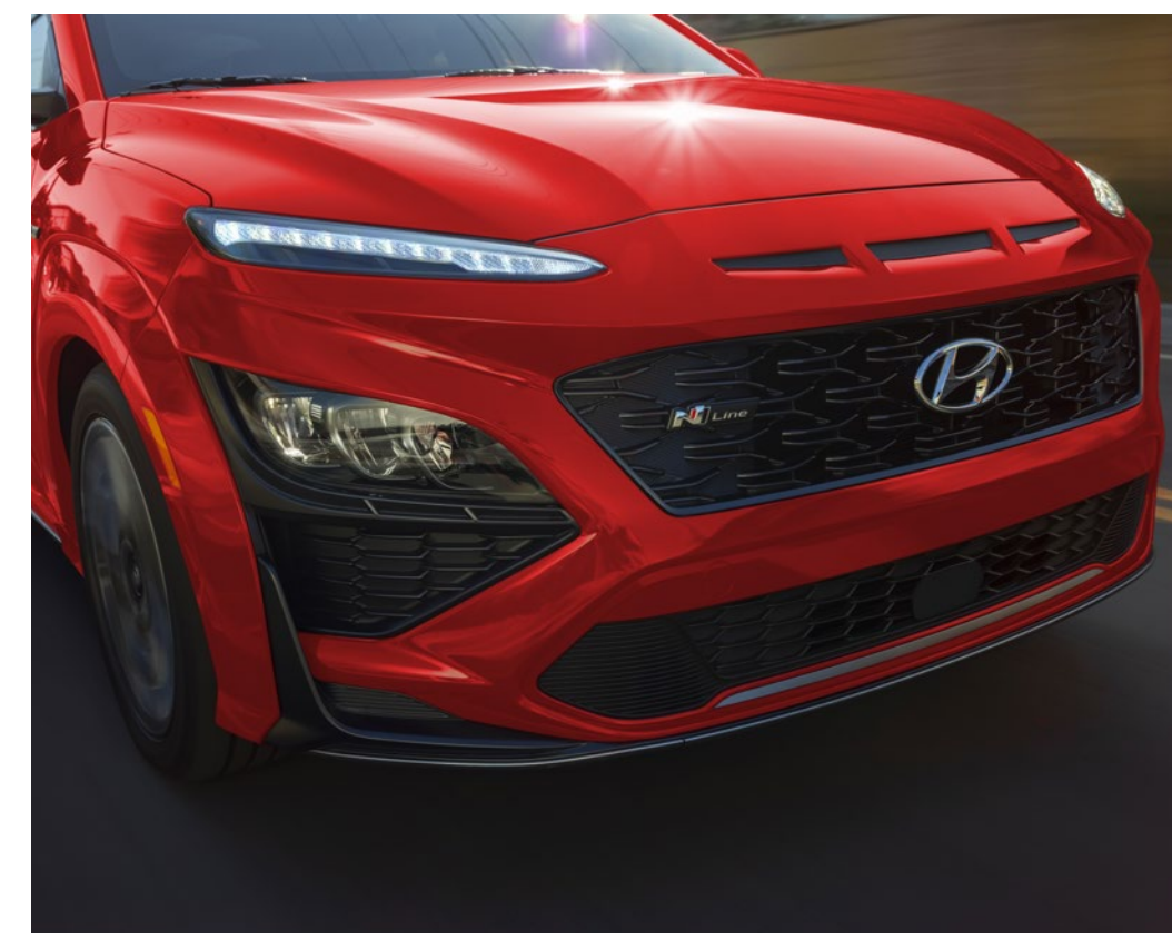
Standard LED daytime running lights Available LED headlights

The new KONA features a distinctive grille design that complements the refreshed headlight cluster. The narrow, piercing look of the standard LED daytime running lights remains a signature and unmistakable design cue. The bold design is reinforced with body cladding details along the wheel arches and rear bumper.