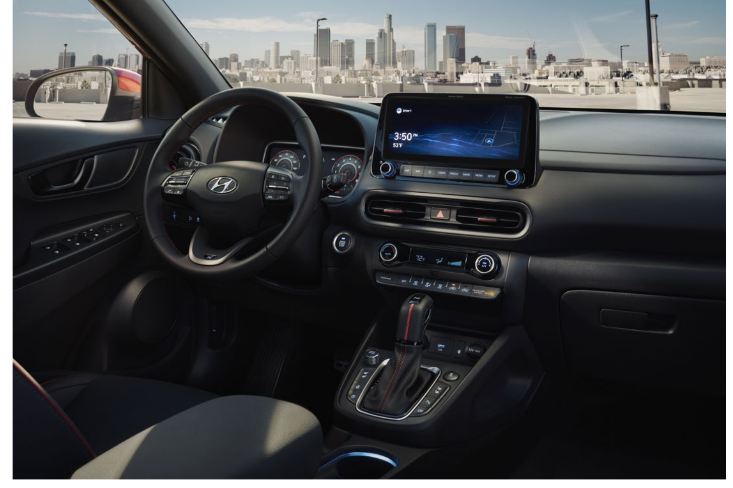
N Line model with Ultimate package shown.

Outside, the newly re-designed KONA makes a bold statement. Inside, the KONA lets its exceptional level of comfort and wealth of features do the talking. The new KONA thinks of you with its standard heated front seats, an available heated steering wheel and an available 8-way power-adjustable driver's seat. When city life heats up, the KONA helps keep you cool with available ventilated front seats.