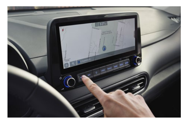
Available 10.25" touch-screen with navigation system