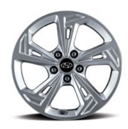
17" alloy wheel Standard on Preferred models