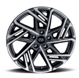
18" alloy wheel Standard on N Line model and N Line model with Ultimate package