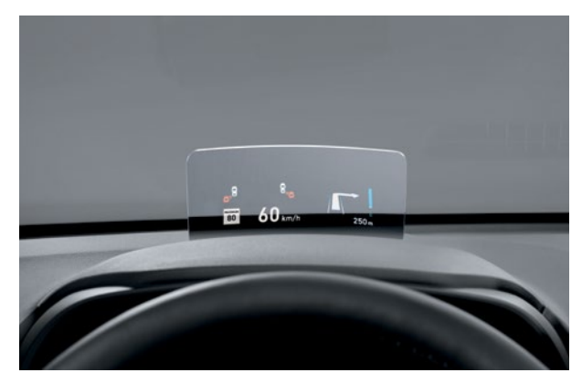
Available head-up display