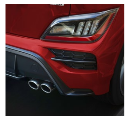
Available twin-tip exhaust