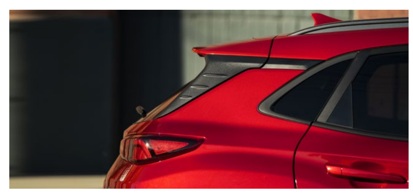
Available LED tail lights Standard rear spoiler