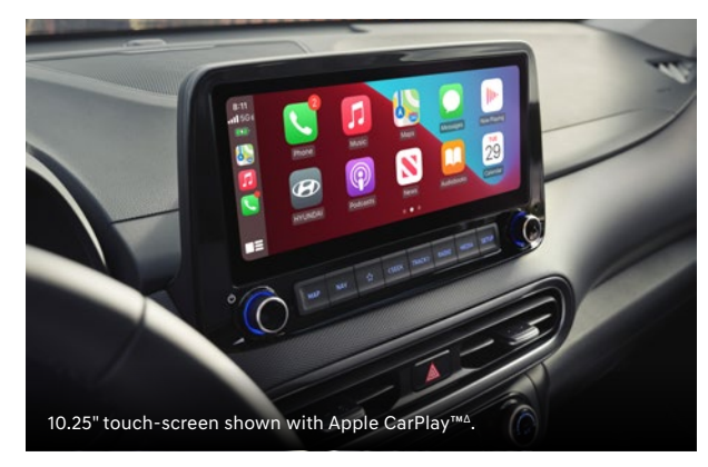
Standard Apple CarPlay ^{\text{TM}} and Android Auto ^{\text{TM}} with available wireless connectivity