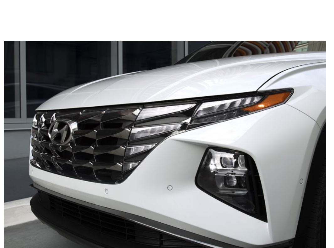
Available hidden LED daytime running lights

The design of the TUCSON exudes modern style with angular body panels, cutting-edge illumination and bold, chiselled surfaces. The signature design of the available hidden LED daytime running lights makes a striking and sophisticated statement. Seamlessly integrated into the front grille, they're mysteriously revealed only when illuminated. Bold rear wheel arches and available 19" alloy wheels further reinforce the aggressive styling.