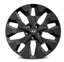
19" alloy wheel Standard on Urban model