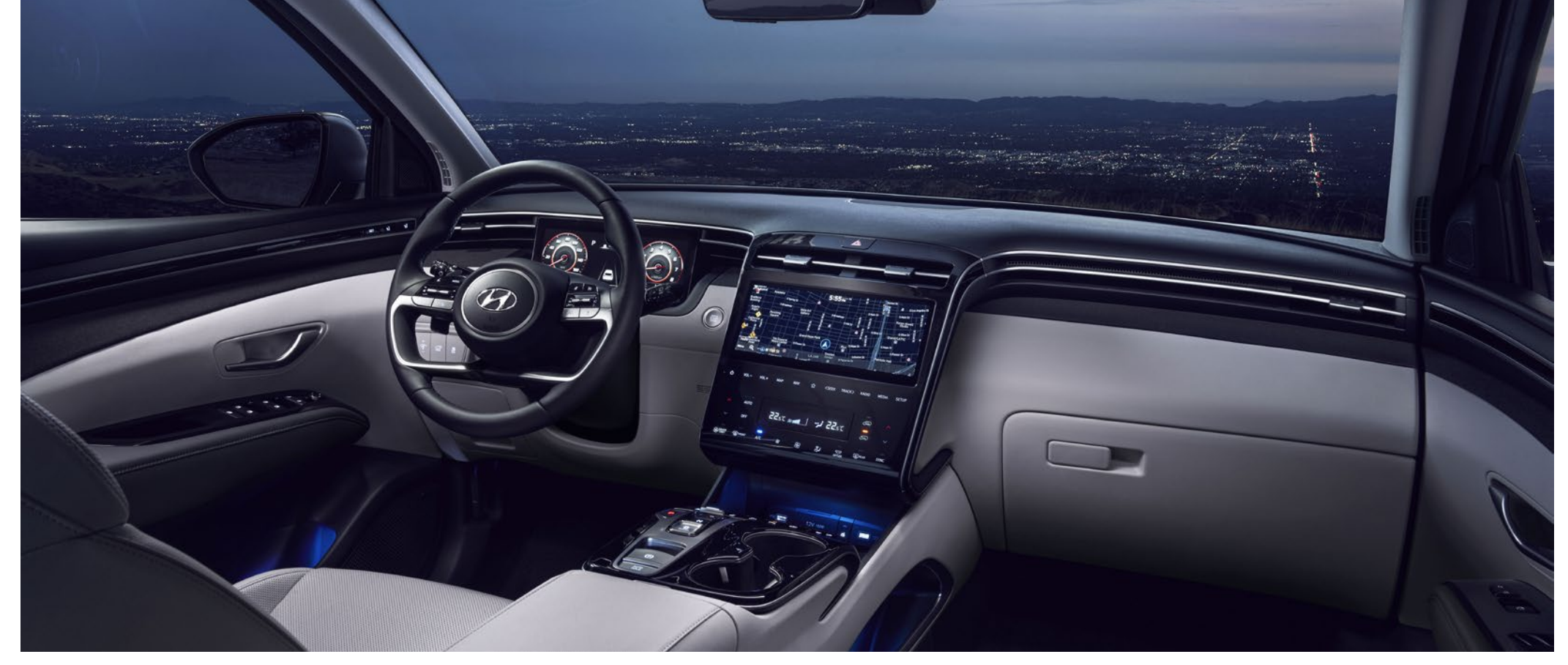
Ultimate Hybrid model shown.