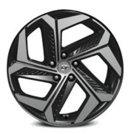
19" alloy wheel Standard on Luxury and Ultimate models