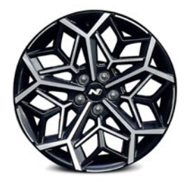
19" alloy wheel Standard on N Line model