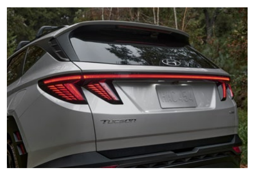
Available LED tail lights