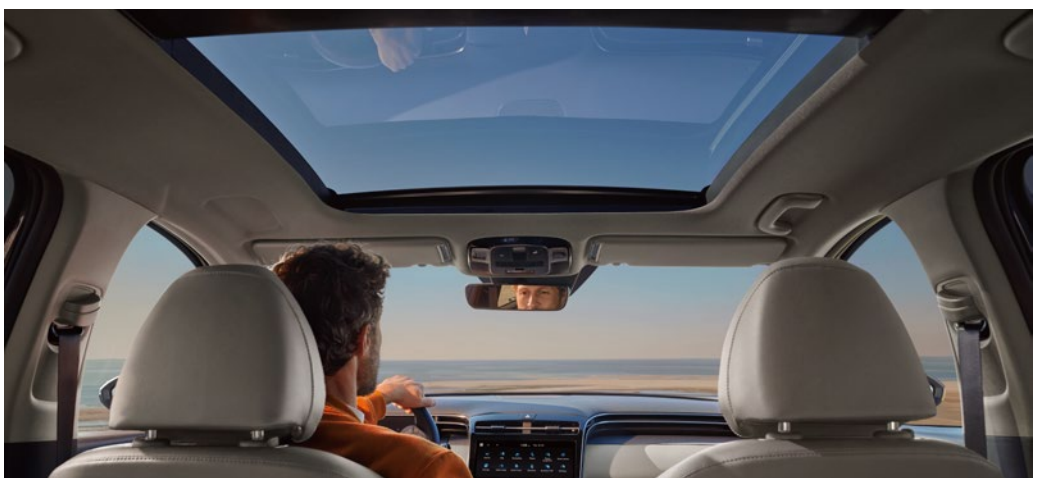
Available panoramic sunroof

Your sidekick to outdoor adventure awaits.