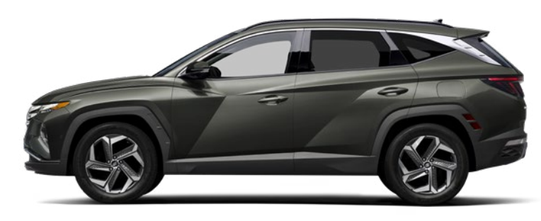
Three-dimensional "Parametric Dynamic" design lines Parametric Dynamic design lines use converging, bold character lines to deliver a unique three-dimensional presence.