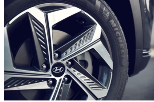
Available 19" alloy wheels