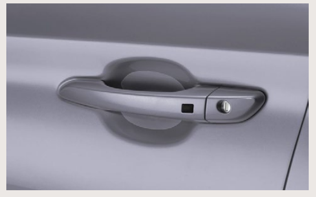
Door pocket clear film

A clear protective film lies behind the door handle to help prevent paint damage to this commonly scratched area.