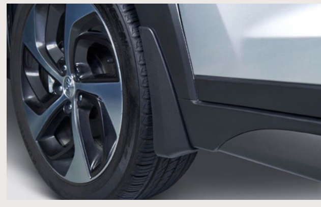
Mud guard kit

A clear protective film lies behind the door handle to help prevent paint damage to this commonly scratched area.