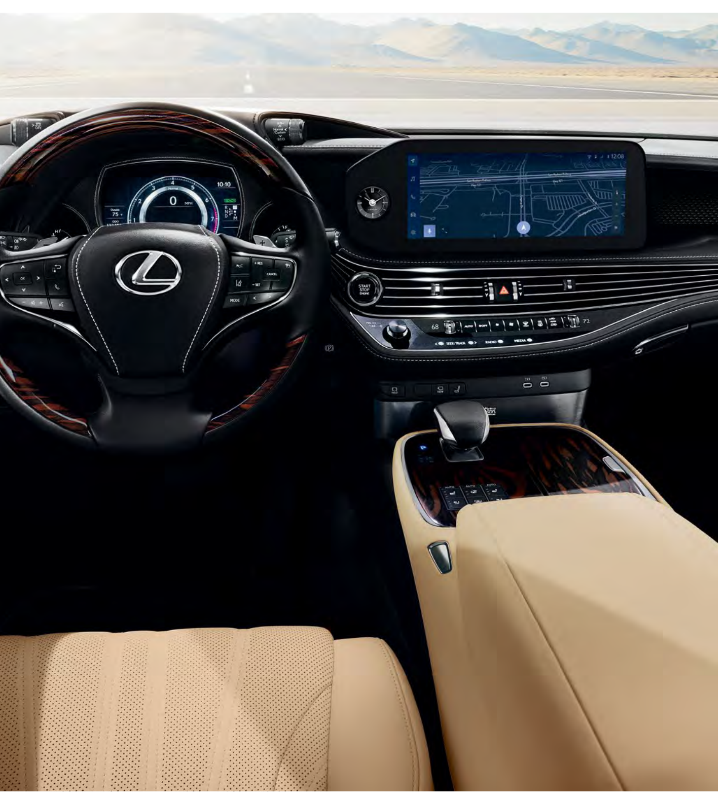
LS shown with Palomino leather and Artwood Organic Gloss interior trim