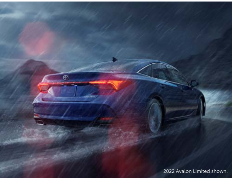
2022 Avalon Limited shown.