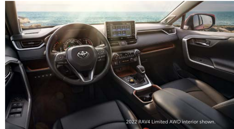
2022 RAV4 Limited AWD interior shown.