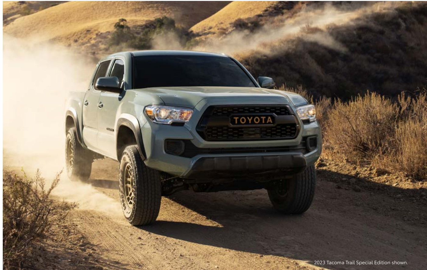
2023 Tacoma Trail Special Edition shown.

With reputable off-road capabilities and impressive towing capacities, Toyota's trucks make a powerful dynamic duo.