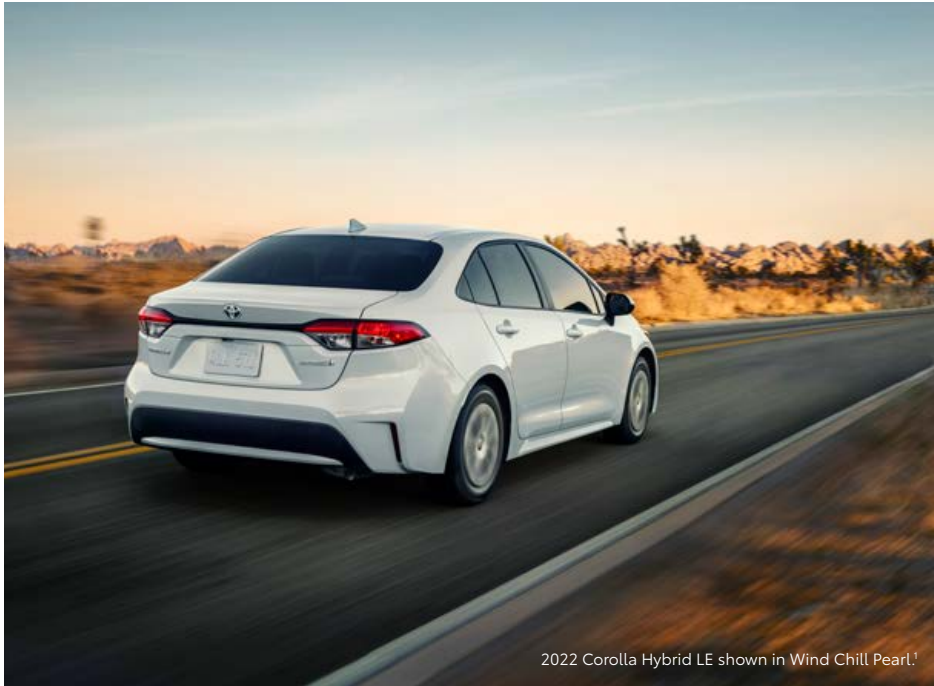
2022 Corolla Hybrid LE shown in Wind Chill Pearl. 1