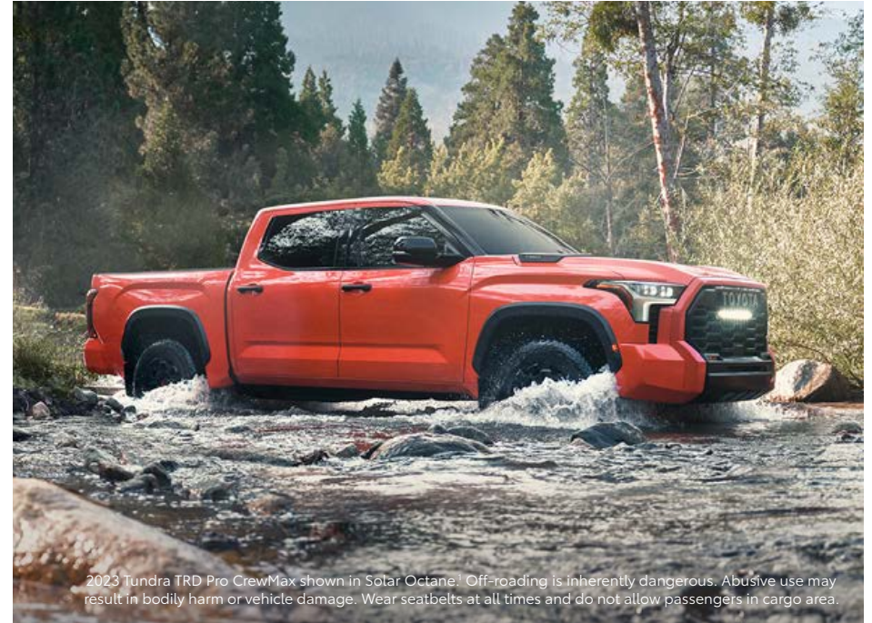
2023 Tundra TRD Pro CrewMax shown in Solar Octane. Off-roading is inherently dangerous. Abusive use may result in bodily harm or vehicle damage. Wear seatbelts at all times and do not allow passengers in cargo area.

Tacoma and Tundra are built to climb hills and run long. Play harder than ever before with a truck capable of conquering the earth.