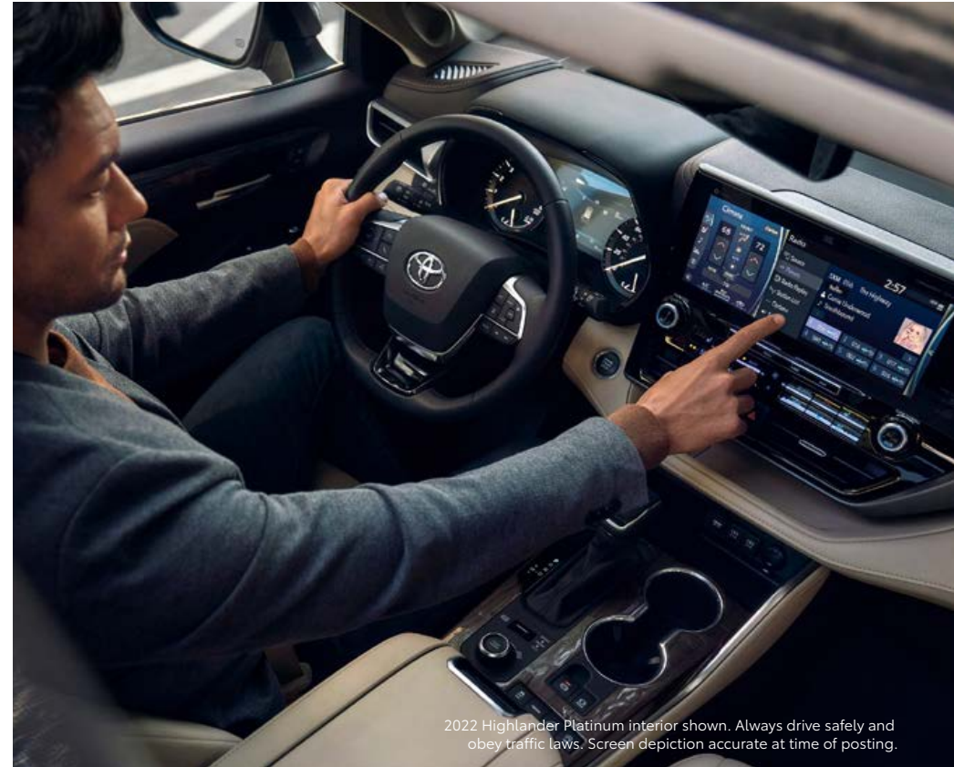
2022 Highlander Platinum interior shown. Always drive safely and obey traffic laws. Screen depiction accurate at time of posting.