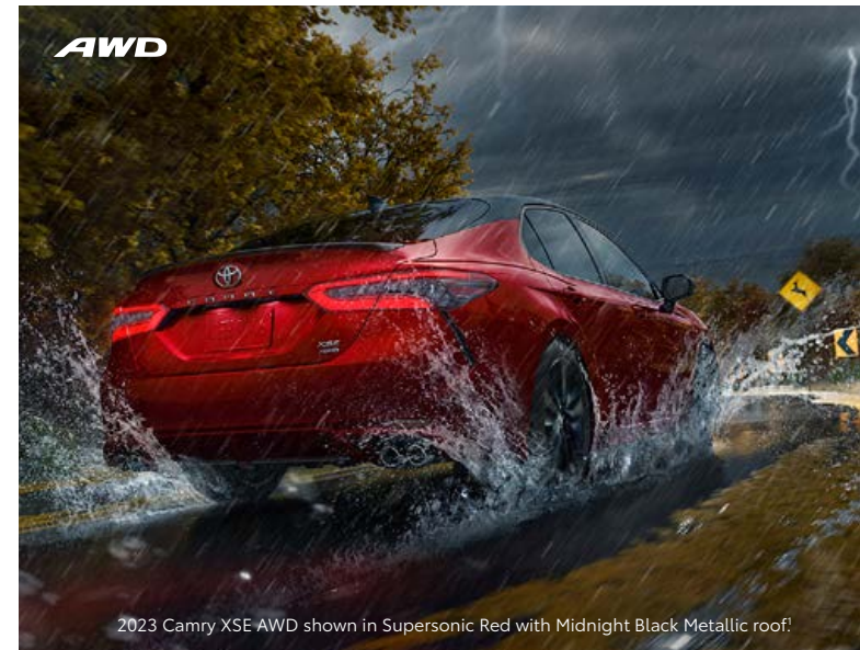
2023 Camry XSE AWD shown in Supersonic Red with Midnight Black Metallic roof 1 .