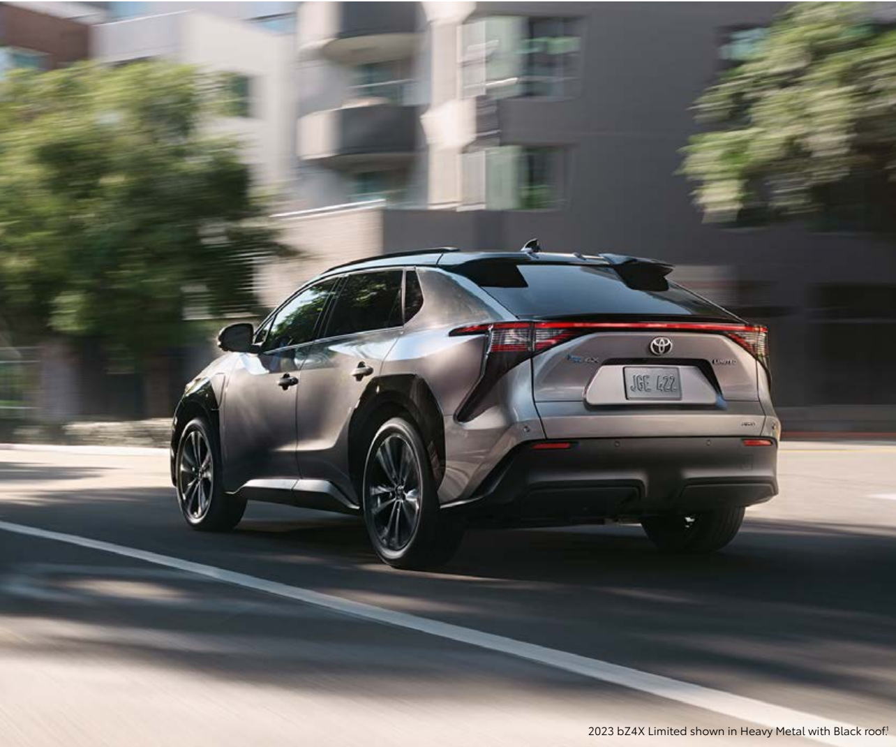
2023 bZ4X Limited shown in Heavy Metal with Black roof!

bZ4X is an all-new, all-electric way to jump-start your day. With its electrified powertrain that produces up to 214 hp with 248 lb.-ft. of max torque and a battery made to last all day, you'll find yourself riding confidently for miles.