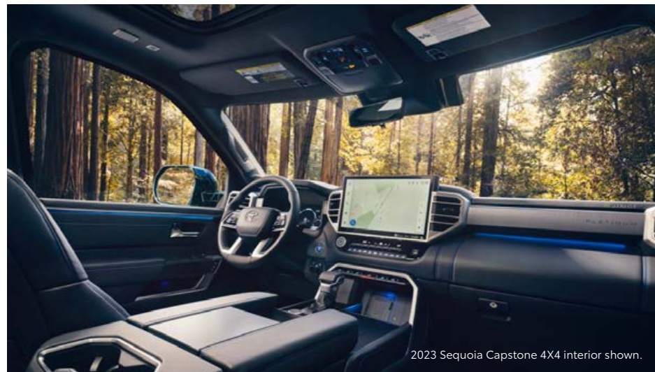
2023 Sequoia Capstone 4X4 interior shown.

From its striking design and comfortable interior to its incredible performance and capabilities, the all-new Sequoia upgrades your drive in a way that's right for you.