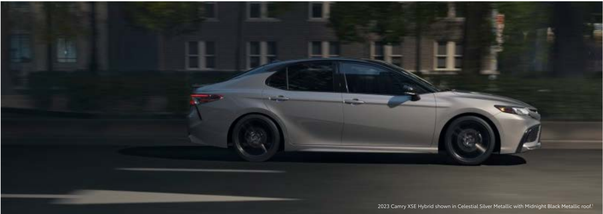
2023 Camry XSE Hybrid shown in Celestial Silver Metallic with Midnight Black Metallic roof. 1