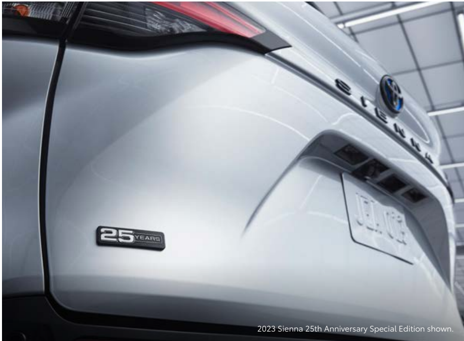
2023 Sienna 25th Anniversary Special Edition shown.