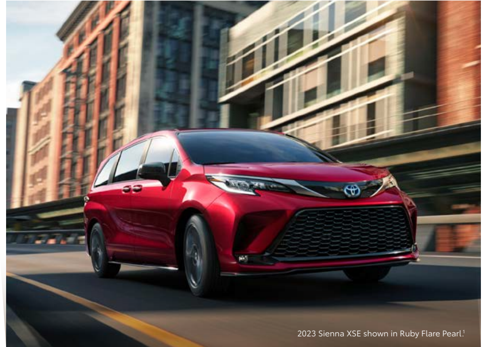
2023 Sienna XSE shown in Ruby Flare Pearl!