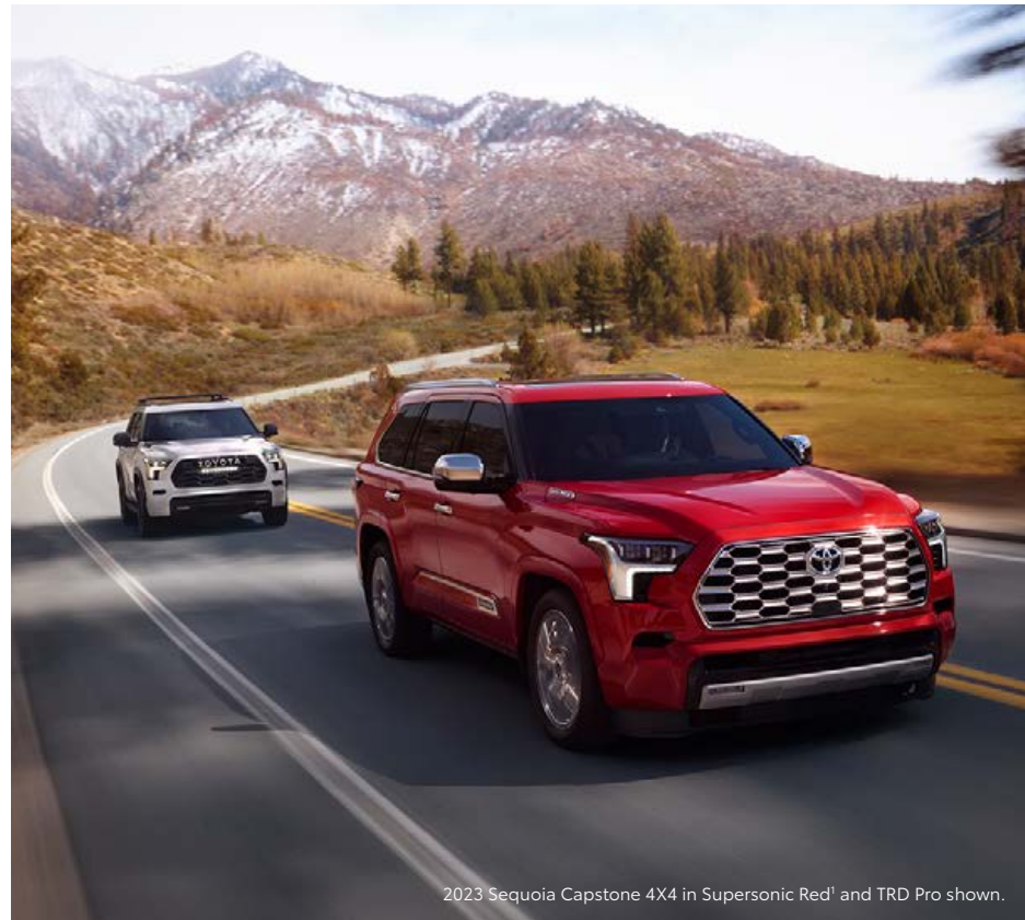
2023 Sequoia Capstone 4X4 in Supersonic Red 1 and TRD Pro shown.