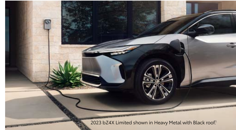
2023 bZ4X Limited shown in Heavy Metal with Black roof!