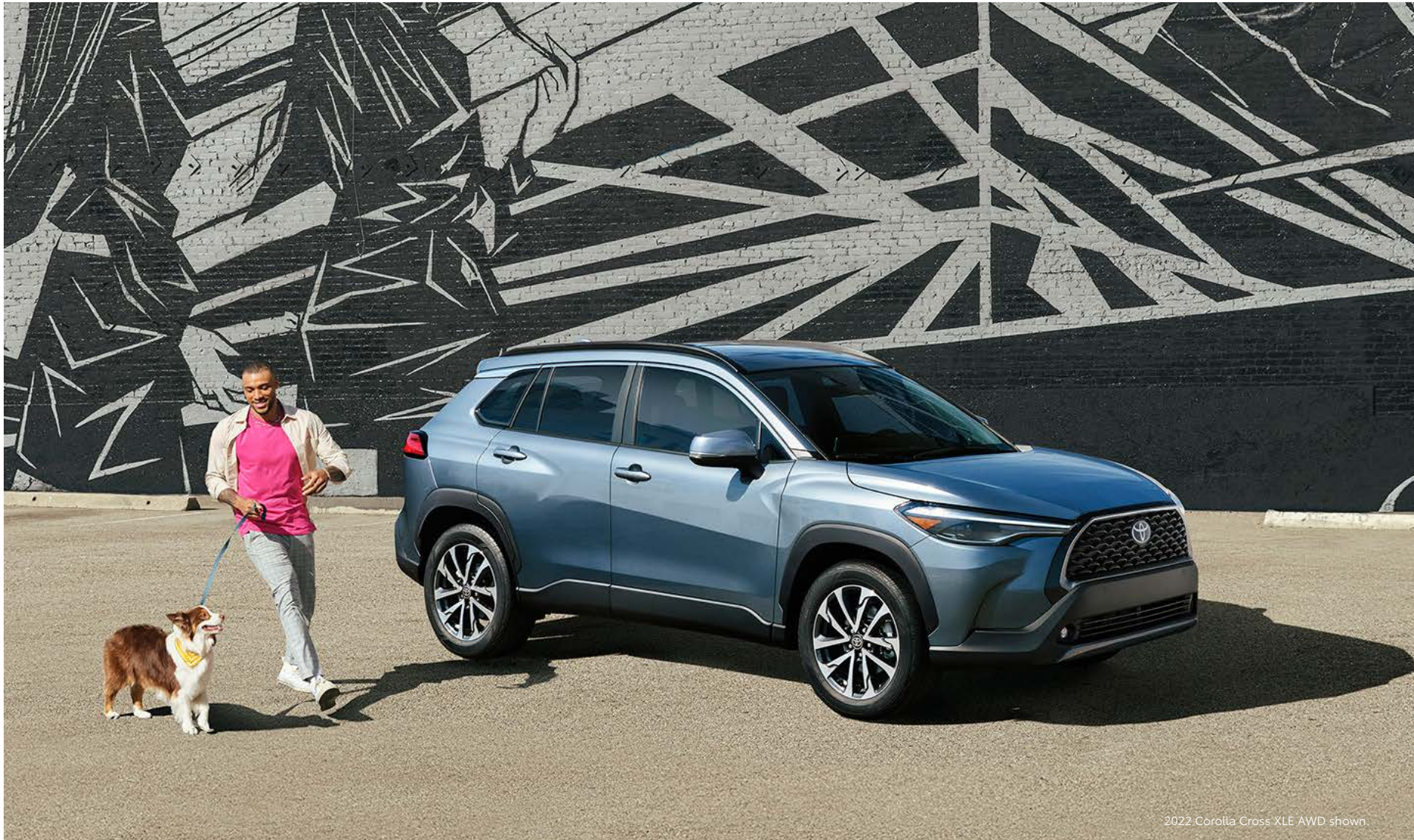
2022 Corolla Cross XLE AWD shown