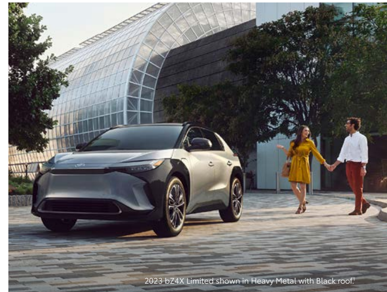
2023 bZ4X Limited shown in Heavy Metal with Black roof!