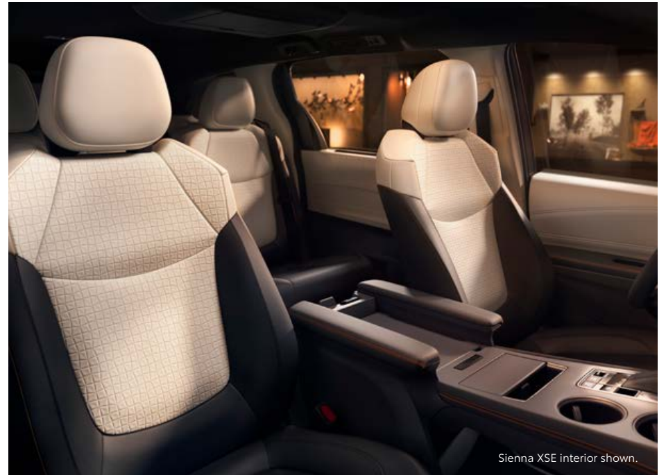
Sienna XSE interior shown.