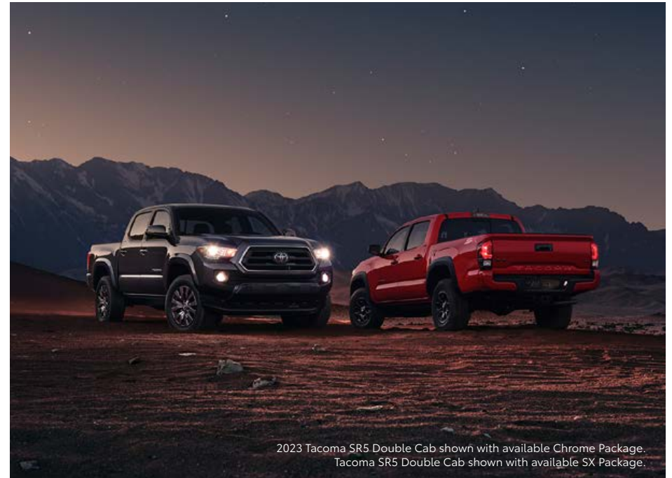
2023 Tacoma SR5 Double Cab shown with available Chrome Package. Tacoma SR5 Double Cab shown with available SX Package.