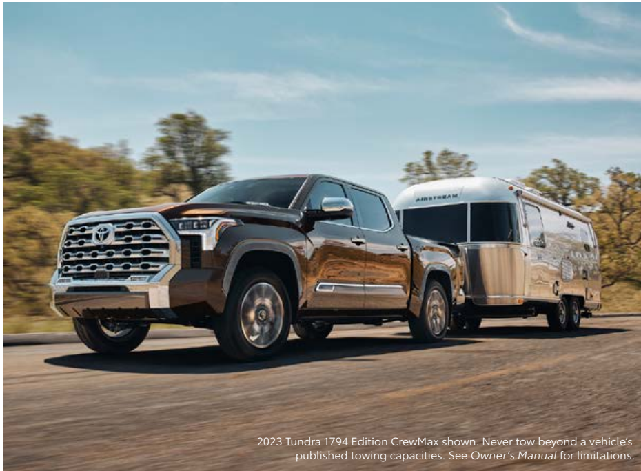
2023 Tundra 1794 Edition CrewMax shown. Never tow beyond a vehicle's published towing capacities. See Owner's Manual for limitations.