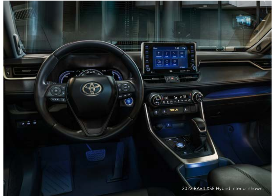
2022 RAV4 XSE Hybrid interior shown.