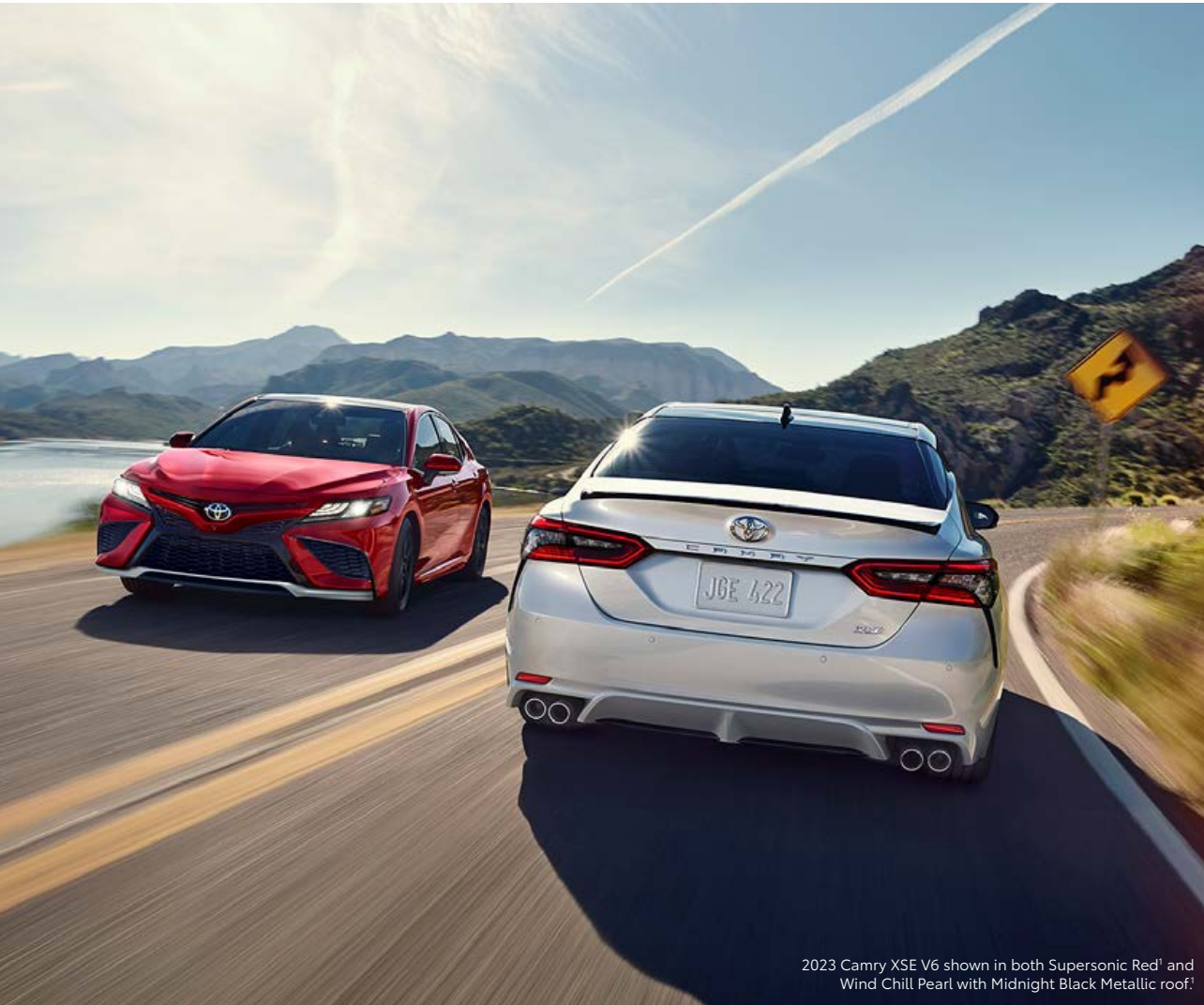
2023 Camry XSE V6 shown in both Supersonic Red 1 and Wind Chill Pearl with Midnight Black Metallic roof 1 .