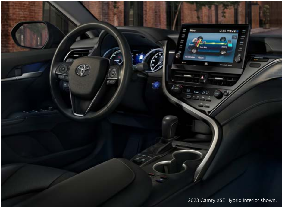
2023 Camry XSE Hybrid interior shown.

With its captivating style, Camry Hybrid is always dressed to impress, and excels when it comes to responsive performance. Its Dynamic Force Engine offers both power and premium fuel economy to optimize efficiency.