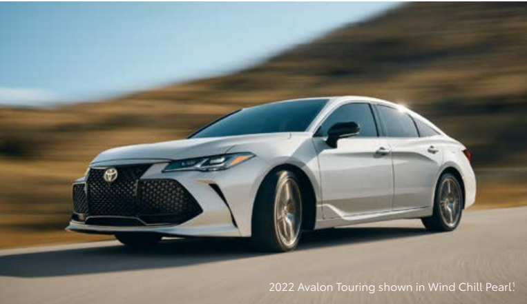
2022 Avalon Touring shown in Wind Chill Pearl. 1