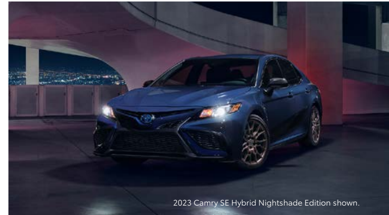
2023 Camry SE Hybrid Nightshade Edition shown.