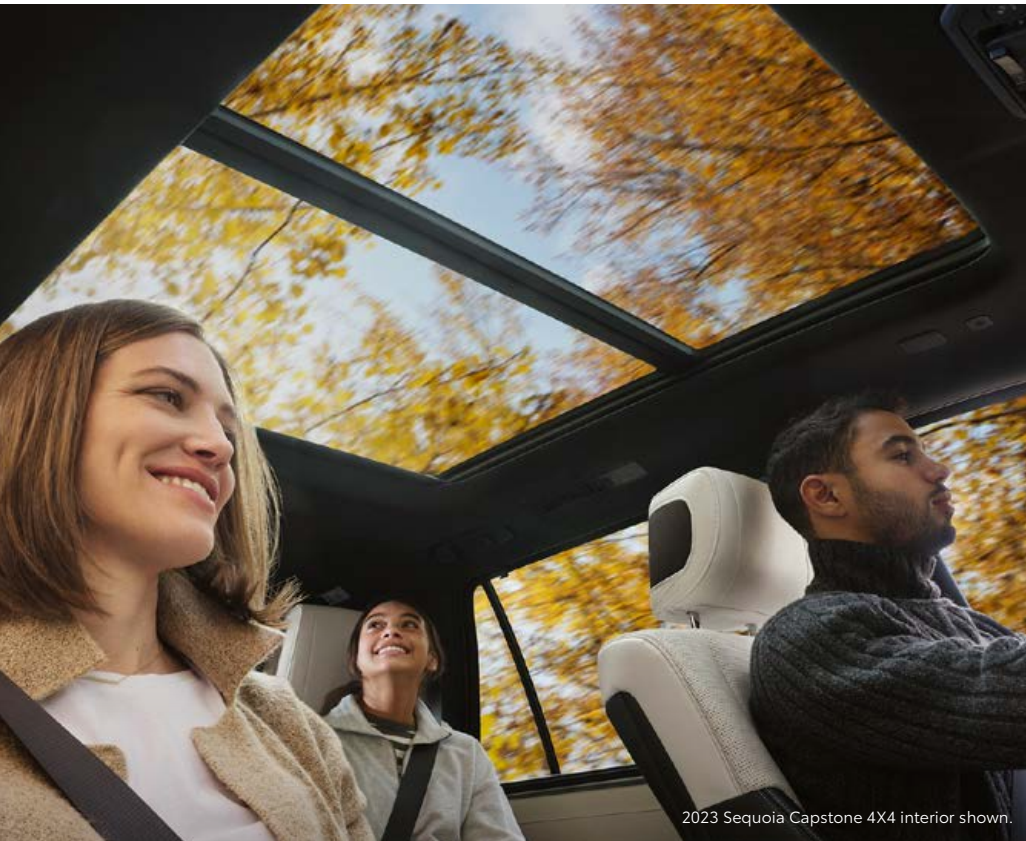
2023 Sequoia Capstone 4X4 interior shown.