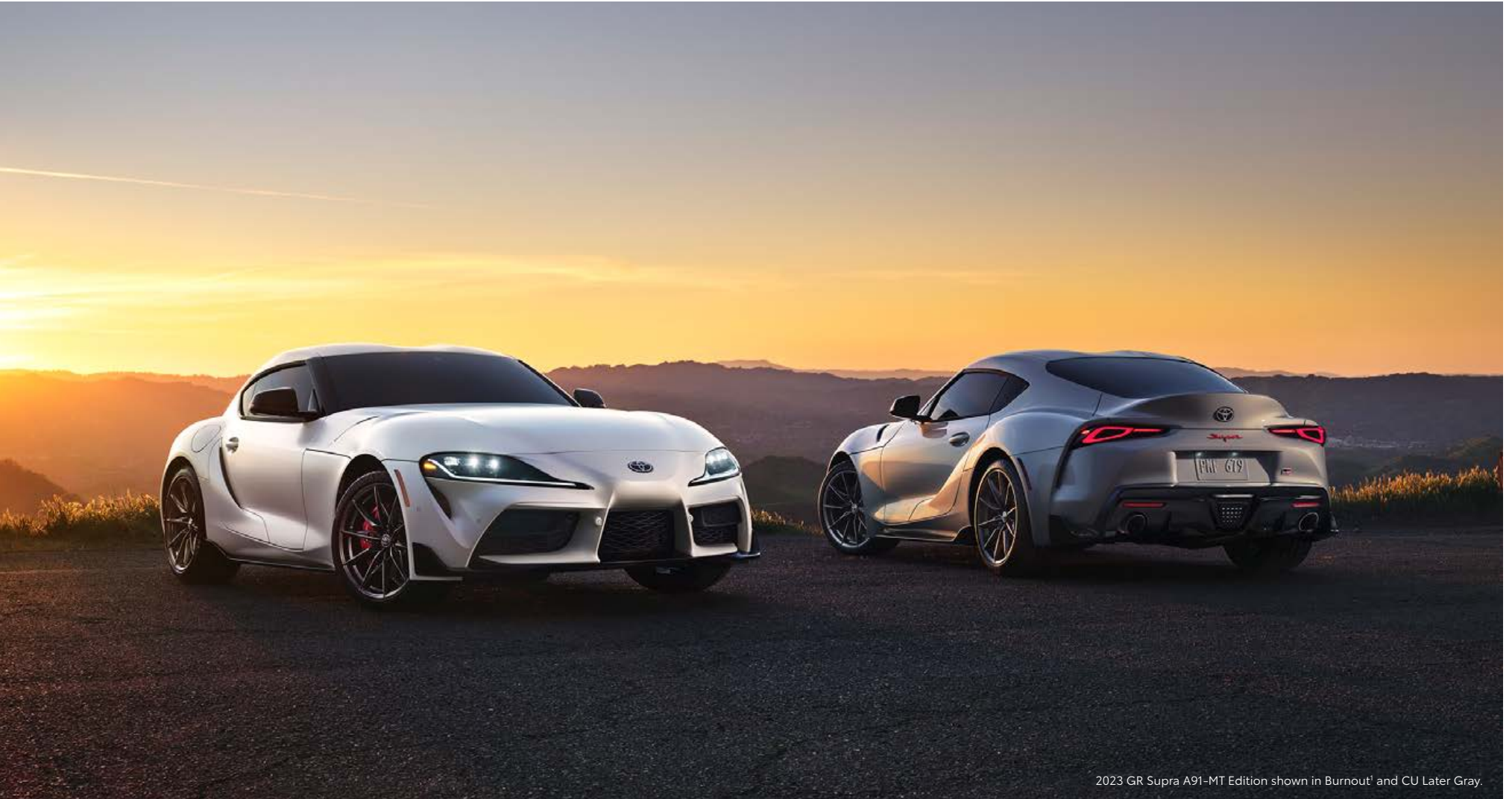
2023 GR Supra A91-MT Edition shown in Burnout 1 and CU Later Gray.