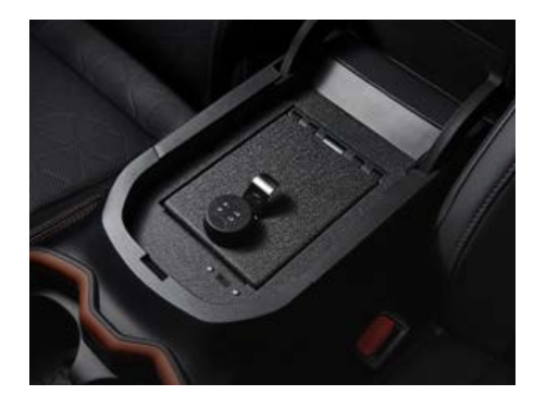
In-vehicle safe by Console Vault®

This is a great way to add extra personality to your RAV4. Not every accessory is available in your area, so for a complete list of accessories, go to toyota.com/rav4/accessories.