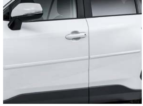
Body side moldings