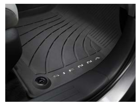
All-weather floor liner<sup>5</sup>

This is a great way to add extra personality to your Sienna. Not every accessory is available in your area, so for a complete list of accessories, go to toyota.com/sienna/accessories.