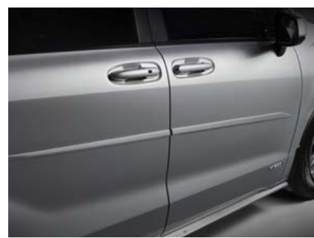
Body side moldings