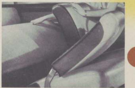
Seat cushion swings up . . .