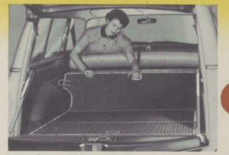
seat back folds down . . .