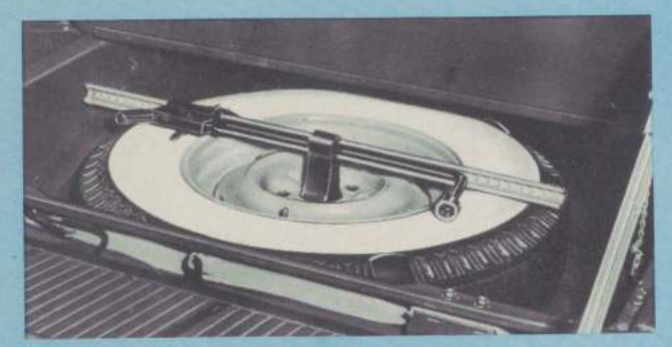
SPARE IS OUT OF SIGHT . . . YET EASILY REACHED!

Loaded with packages? Just press the liftgate push-button release and up it goes on counterbalancing hinges—lower the tailgate just as easily and quickly—all with one hand. And your cargo fits into the spacious rear compartment—slides smoothly on the level floor.