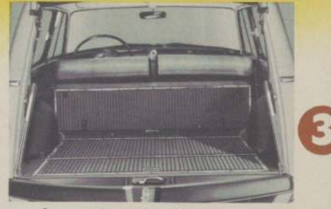
you're ready to load!