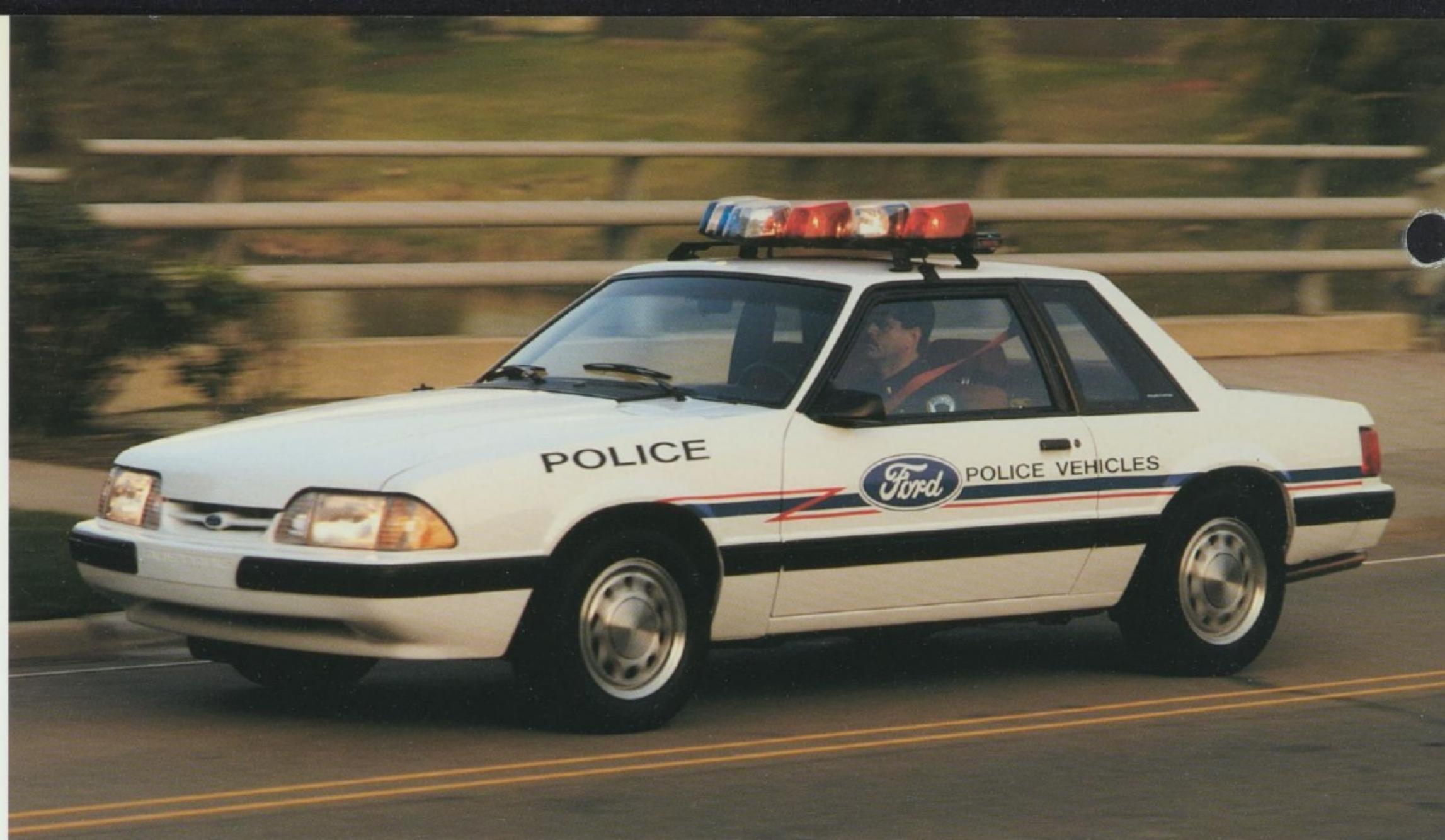
The responsive 5.0L High Output V-8 features sequential fuel injection and one of the world's most sophisticated and powerful engine control computers — the EEC-IV.