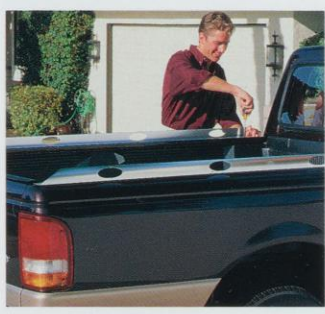
Attractive, sturdy pickup box rails feature specially designed tie-down loops that are excellent for securing loose cargo or tarpaulins. Rails are held in place by metal posts that mount in existing stake holes. Bright or black aluminum. Available October, 1992.