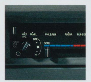
The dealer-installed genuine Ford Air Conditioning unit replaces your vehicle's original temperature control system for optimum comfort with a factory fresh look.