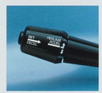
Speed control lets you sit back and relax as a microcomputer automatically maintains the cruising speed you choose. The unit disengages instantly when pressure is applied to the brake or clutch (manual transmissions) and returns to the original speed setting when the "resume" feature is activated.