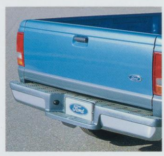
Handsome rear step bumpers help make loading and unloading easier and feature a rubber step cover with 6-1/2" tread width. Available in black or chrome (chrome-plated bumpers require pads and covers for installation that must be ordered separately).