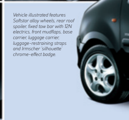
Vehicle illustrated features Softstar alloy wheels, rear roof spoiler, fixed tow bar with 12N electrics, front mudflaps, base carrier, luggage carrier, luggage-restraining straps and Irmischer 'silhouette' chrome-effect badge.