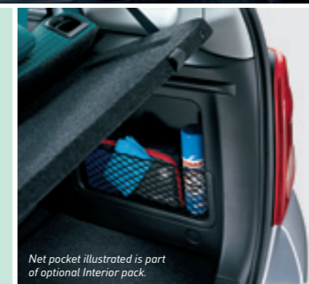
Net pocket illustrated is part of optional Interior pack.