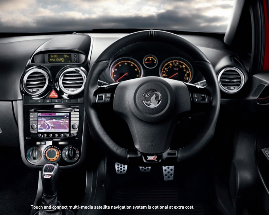
Touch and connect multi-media satellite navigation system is optional at extra cost.