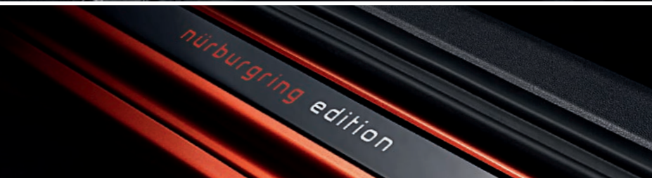
Unique 'Nürburgring Edition' black-finish door sill covers set the tone; striking VXR-style details underline the message. 'Shell-backed' Recaro sports front seats. VXR facia, steering wheel and gear knob. Sports pedals. And driver-focused ergonomics that put you fully in control.

Four colours – all red hot. Blistering performance demands equally dramatic colour schemes. Choose from Glacier White, Chilli Orange, Lime Green or Black Sapphire. Four stunning paint finishes. And not a metallic red in sight.