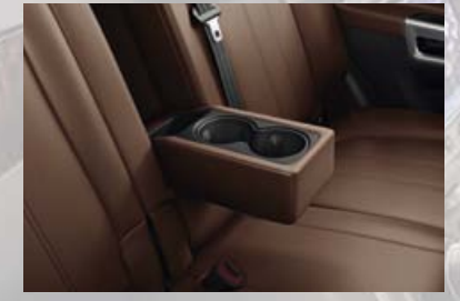
Rear drinks holders. Mounted in the rear seat centre armrest, the two drinks holders are the perfect place for en-route refreshments and typical of Antara's attention to rear passenger comfort. The armrest also features a useful storage facility.