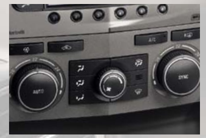
Air conditioning and ECC. Standard on Antara Exclusiv and Diamond, air conditioning makes for a fresher interior atmosphere all year round. SE Nav models move up to dual-zone Electronic Climate Control enabling you to maintain the interior temperature to within a single degree. All models feature rear heater ducts.

Heat-reflective windscreen. The SE Nav features a multi-layered coating inside the windscreen which reflects the sun's heat, helping the electronic climate control maintain a pleasant – and constant – temperature inside the car.