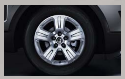
Exclusiv/Diamond FWD 17-inch alloy wheels with 235/65 R 17 low profile tyres FWD = Front wheel drive.