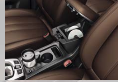
Front floor console. The electric parking brake has freed useful space for the centre console. On all models, the centre floor console contains two drinks holders and a convenient open storage compartment. The armrest opens to reveal capacious storage for journey needs and personal items.