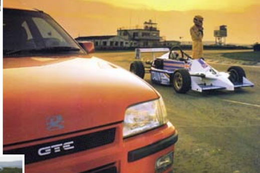
1984 – The MkII Astra introduced class-leading aerodynamic styling that still looks good today. The Formula Vauxhall Lotus ran a modified version of the Astra GTE's 2.0i 16v engine.