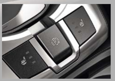
Electric parking brake. The electric parking brake is easy to apply and also has an automatic release function to ease driving off on slopes.

CD 40. Standard on Exclusiv and Diamond models, this unit features seven speakers and steering wheel mounted audio controls. There's also an aux-in socket so you can play favourite tracks direct from your personal MP3 player as well as a separate USB connection which allows you to view iPod and memory stick functionality via the audio display. Bluetooth® connectivity. All models now feature Bluetooth® connectivity as standard enabling you to operate your phone's key functions from the steering wheel, the audio unit or via voice control (when enabled on the mobile phone).