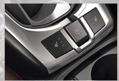
Heated front seats. On all models, heating elements in the seat backs and cushions enable the front seats to reach a comfortable temperature in a very short time. There are three separate heat settings.