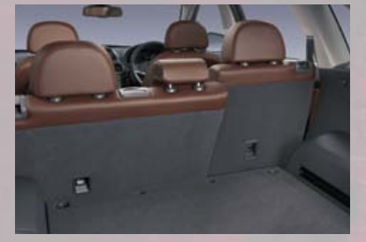
60/40 split-folding rear seat. Antara models feature a 60/40 split-folding rear seat with adjustable backrest. Tilted forward into the upright position, these provide extra usable luggage capacity.

Roof rails. Antara's stylish silver-effect integral roof rails don't just look good. They're the perfect starting point for the Vauxhall roof rack system. Attach the accessory base carrier and it's ready for a wide range of lockable travel boxes and other specialist fittings for skis and more.