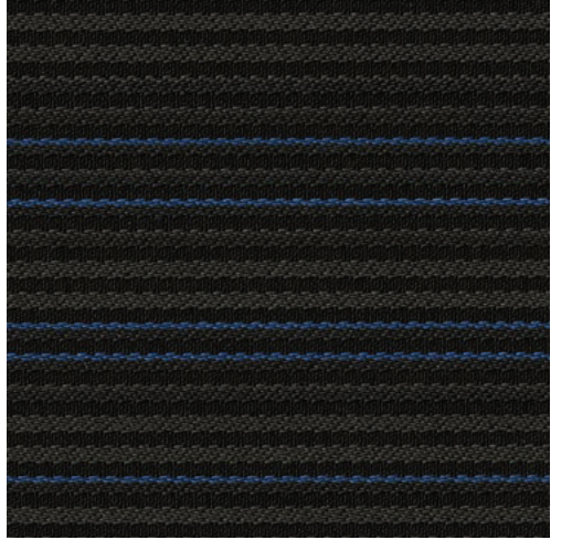
Standard Nissan has taken care to ensure that the digital colour swatches presented here are the closest possible representation of actual vehicle colours. Swatches may vary slightly due to viewing light or screen quality. Please see the actual vehicle and colours at your dealer.