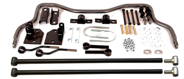
Larger diameter (1.125") heavy-duty rear sway bar assembly and heavy-duty traction bars and bushings help control acceleration.

To provide an aggressive low-rider look, the optional sport suspension system lowers the truck 2" in front and 3" in the rear, and includes higher-rated front and rear performance shocks (only available on Non-Active Ride models). Optional 2" front and 2" rear adjustable lowering kit upgrade is available for vehicles with Active Ride/Adaptive Ride only.