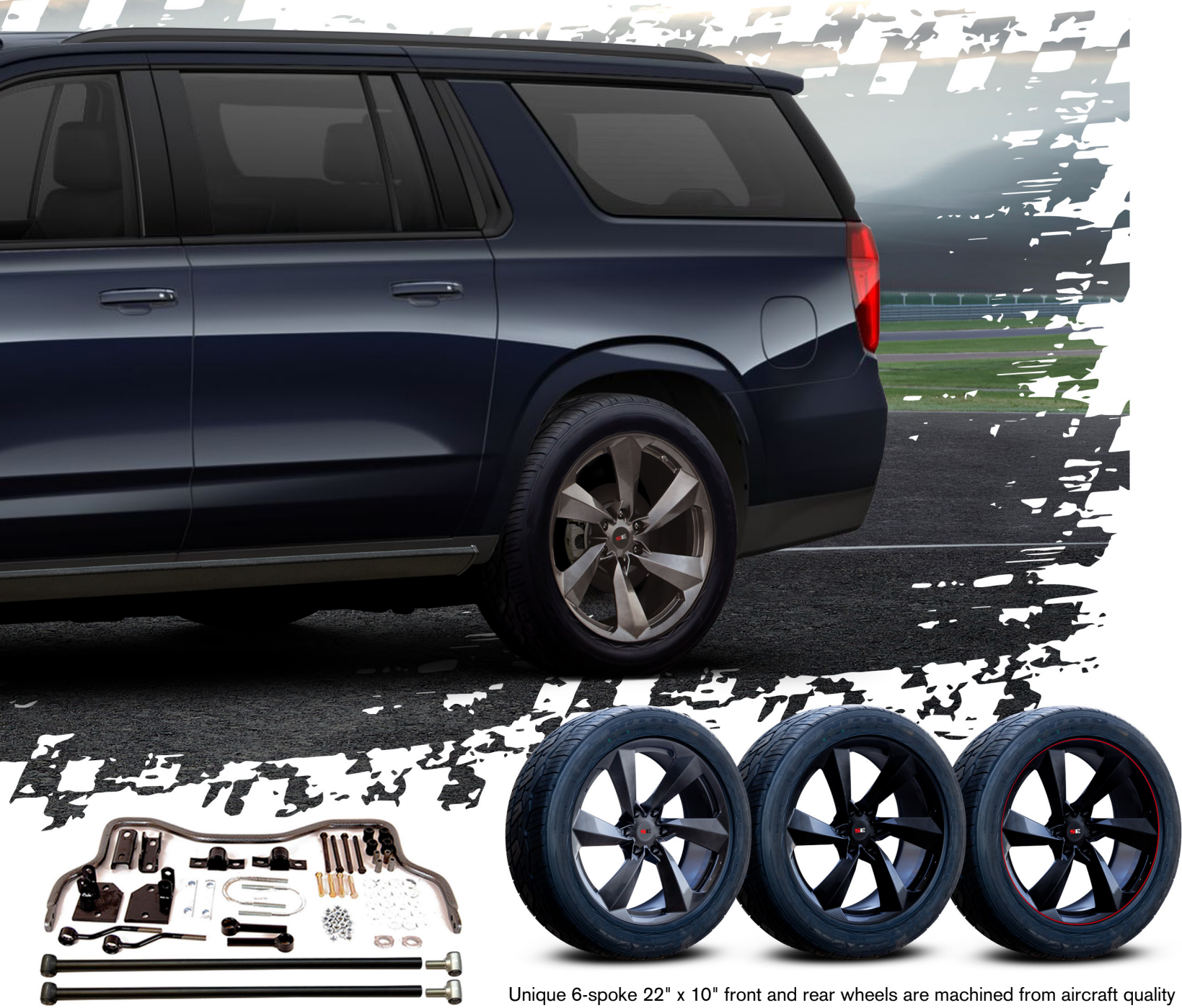
Larger diameter (1.125") heavy-duty rear sway bar assembly and heavy-duty traction bars and bushings help control acceleration.

To provide an aggressive low-rider look, the optional sport suspension system lowers the truck 2" in front and 3" in the rear, and includes higher-rated front and rear performance shocks (only available on Non-Active Ride models). Optional 2" front and 2" rear adjustable lowering kit upgrade is available for vehicles with Active Ride/Adaptive Ride only.