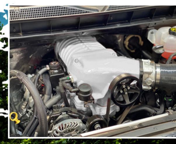
SUPERCHARGER COMES STANDARD IN BLACK. CUSTOM COLORS OPTIONAL: SHOWN IN BODY COLOR PAINT.

Brushed aluminum finish Sport Edition Supercharged fender inserts