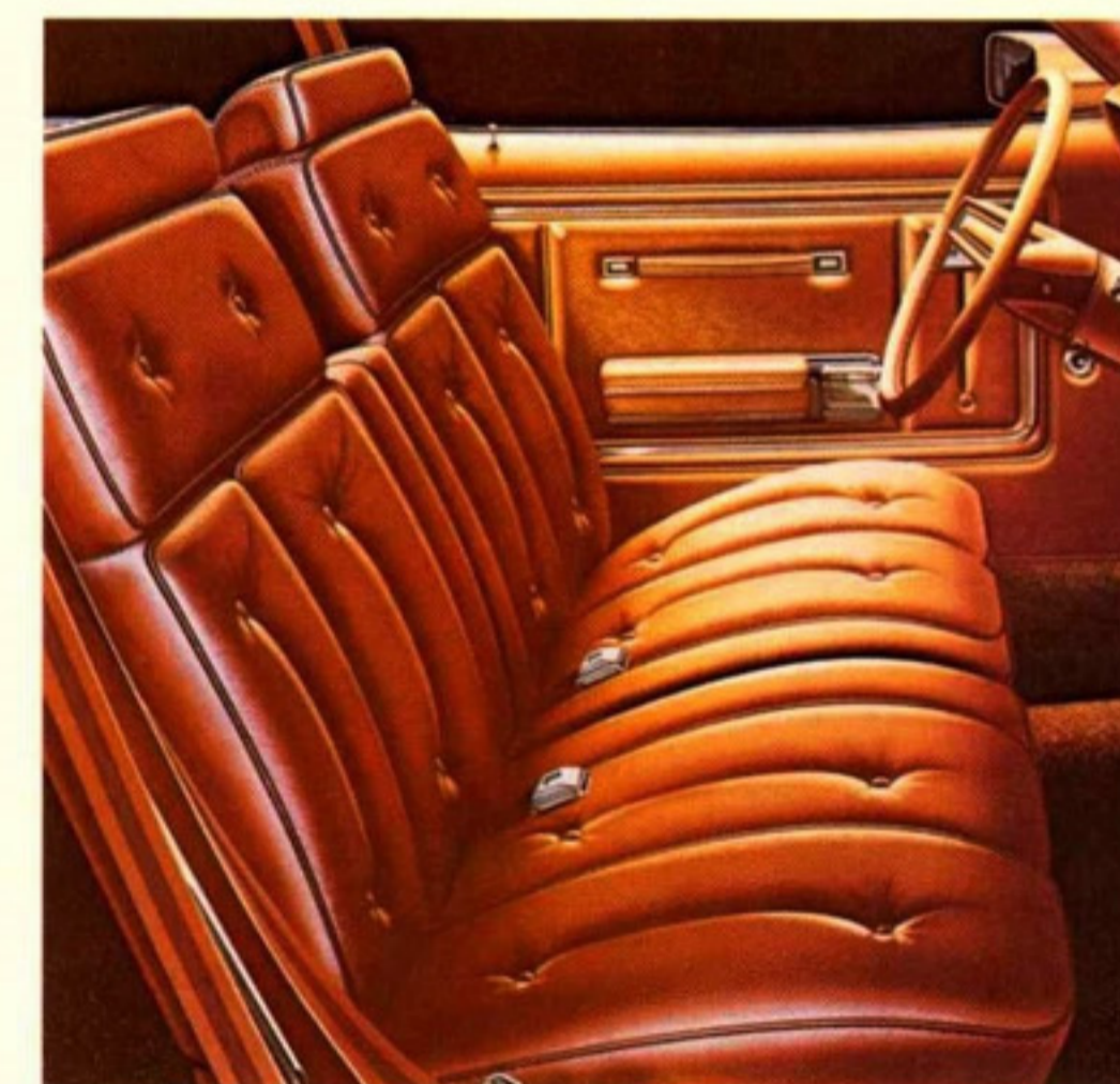
Mercury Cougar XR-7 Twin Comfort Lounge Seats