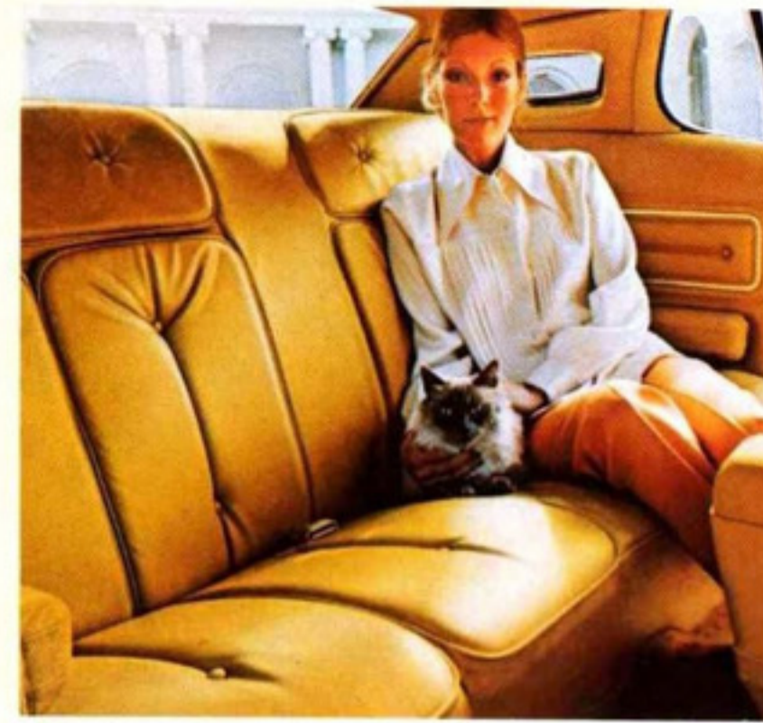
Mercury Cougar XR-7 interior

with an unusually broad choice of trim combinations, with a prestigious opera window and unique vinyl roof. Definitely on the move and definitely up. Cougar XR-7!