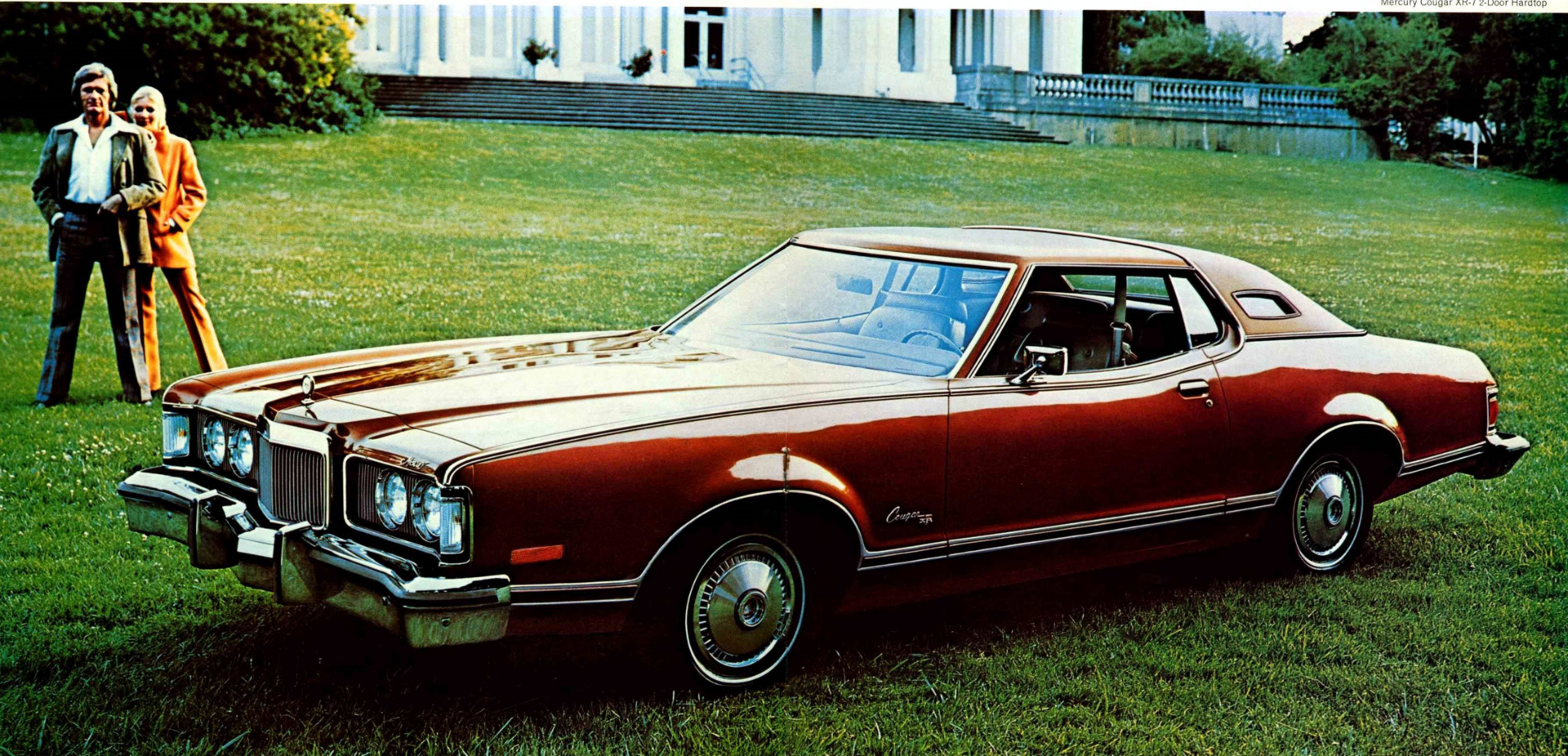
Mercury Cougar XR-7 2-Door Hardtop

Cougar XR-7's measure of luxury deserves a lot of room. So XR-7 gives you more room for legs, hips and shoulders. More elegance, too, as you can see.