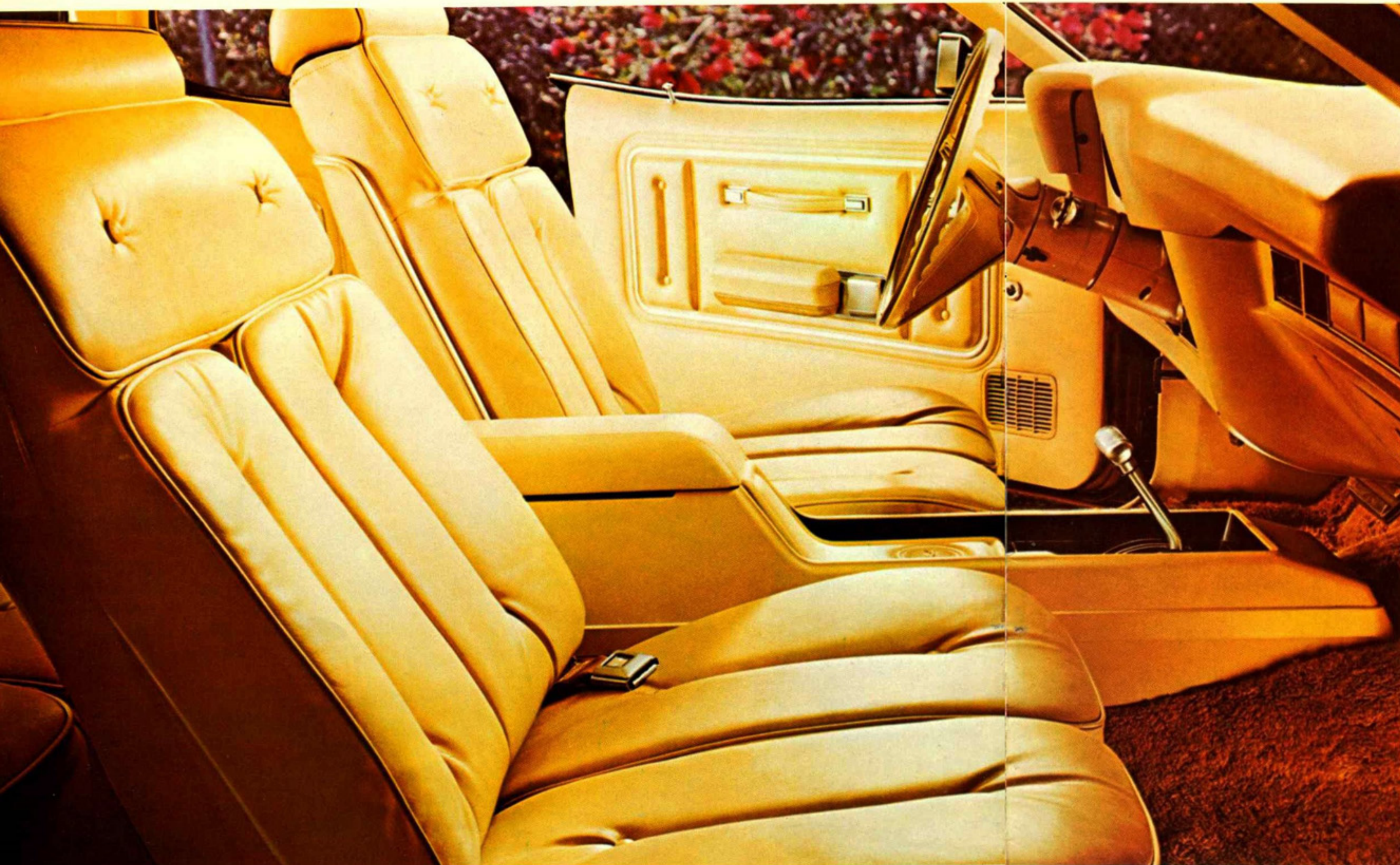
Mercury Cougar XR-7 interior