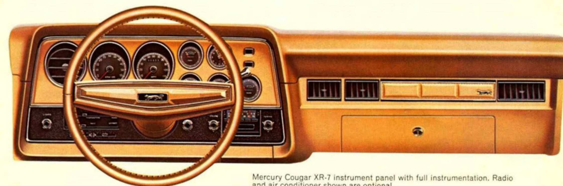
Mercury Cougar XR-7 instrument panel with full instrumentation. Radio and air conditioner shown are optional.