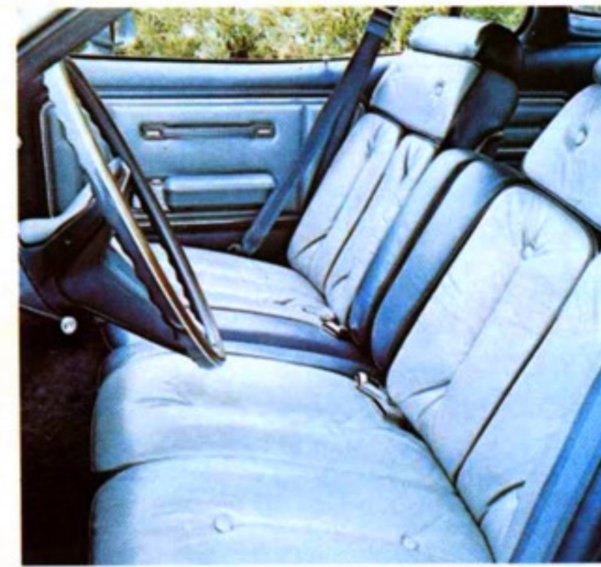
Mercury Cougar XR-7 Twin Comfort Lounge Seats

disc brakes • Steel-belted radial tires • Impact-absorbing bumpers • Dual headlamps • 3-point restraint system • Locking steering column • Power steering • Performance instrumentation • Bucket seats and console • Luxury steering wheel • Luxury-weight cut-pile carpeting • Inside hood release • \frac{3}{4} vinyl roof • Opera window • Ford Motor Company Safety Design Features • Note: Other equipment shown is optional.