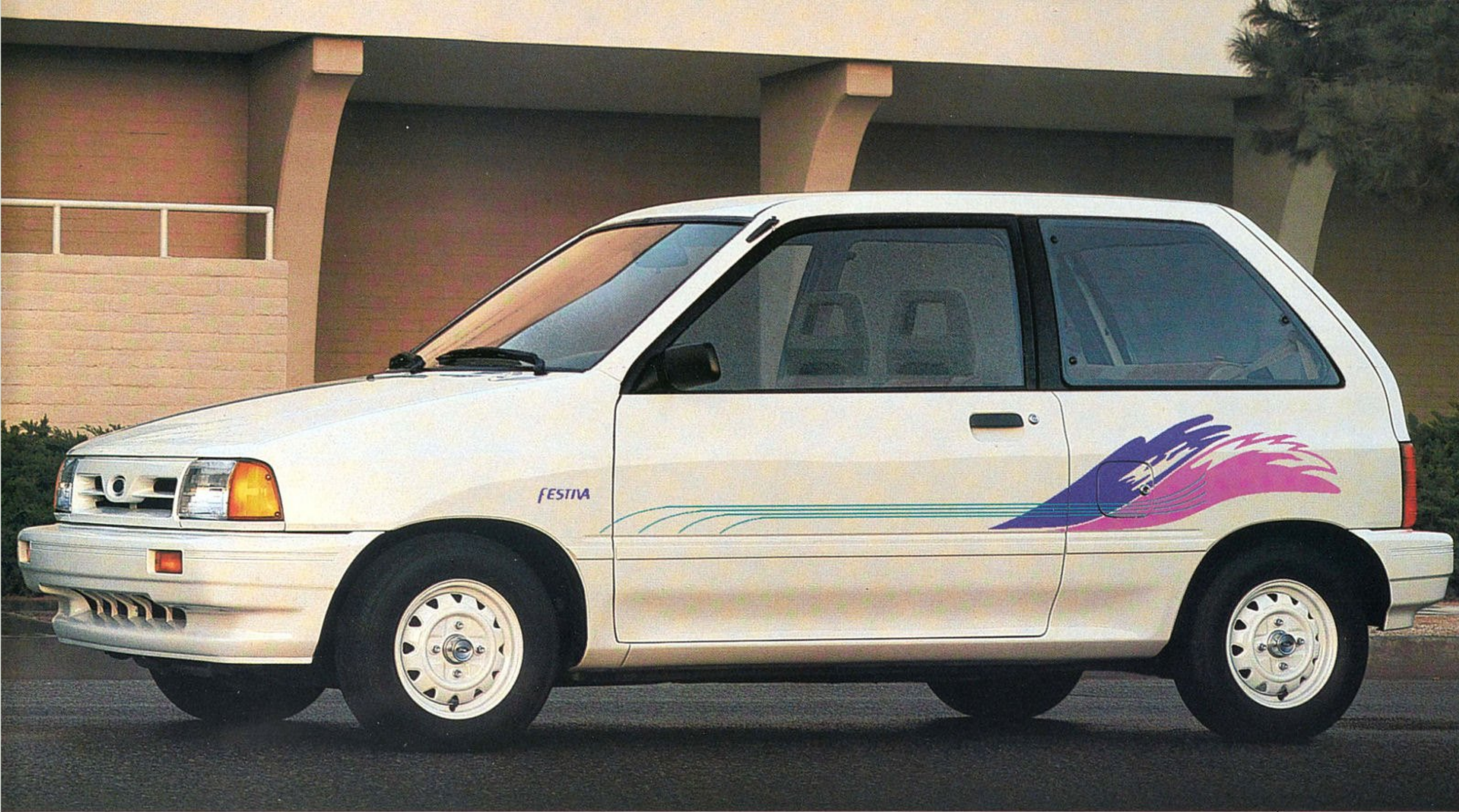
Festiva LX shown in White. Some features shown may be optional.

Ask your dealer: Following the publication of this catalogue, certain changes in standard equipment, options, prices or product delays may have occurred which would not be included in these pages. Ford Motor Company of Canada, Limited, reserves the right to make these changes without incurring obligations of any kind. Your dealer is your best source for up-to-date information.