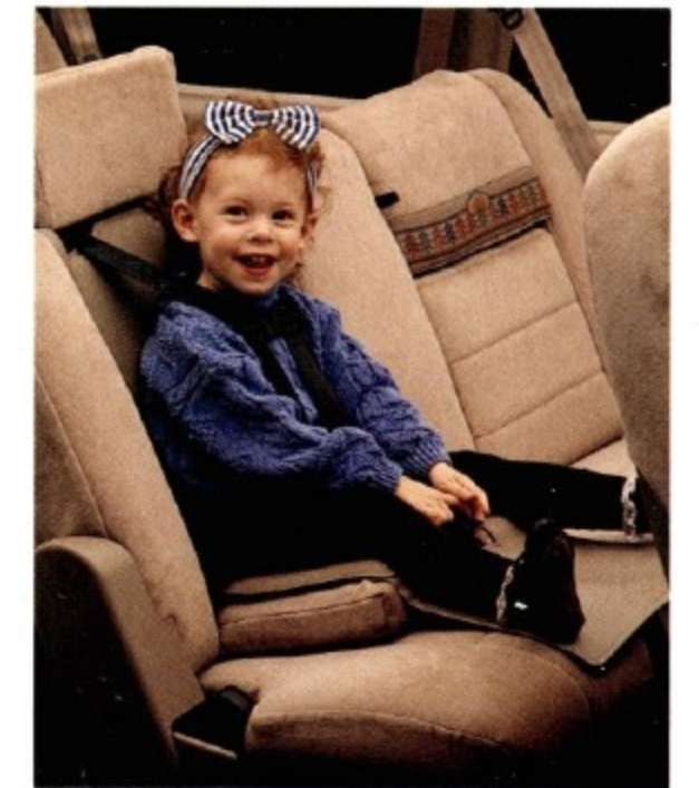
Aerostar offers optional integrated child safety seats.