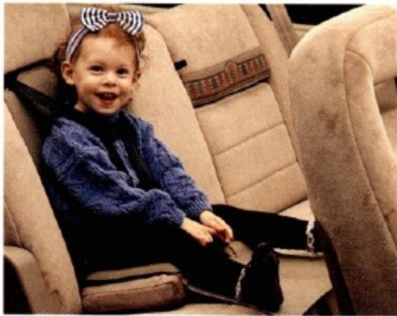
Integrated child safety seats are available with either the 2-passenger bench seat or the 2-passenger combination seat/bed. Each seat has a 5-point restraint system and is designed to carry a child at least one year of age, 20 to 60 pounds, and less than 40 inches tall. And the cloth liner can be removed, so the seats are not only easy to use but easy to clean.