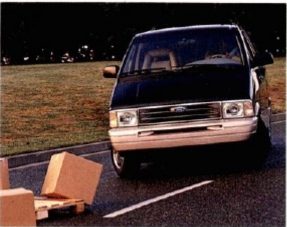
Standard rear anti-lock brakes are computer-controlled for better braking performance under adverse conditions. The easily visible high-mount stop lamp alerts traffic whenever your brakes are applied.

Note: Interior trim colors are Crystal Blue, Ruby Red (XL only), Medium Grey and Mocha. Sport appearance package exterior color choices are Cayman Green Clearcoat Metallic, Electric Red Clearcoat Metallic, Bimini Blue Clearcoat Metallic, Silver Clearcoat Metallic and Raven Black. See your dealer for exterior/interior compatibility as well as two-tone combinations.