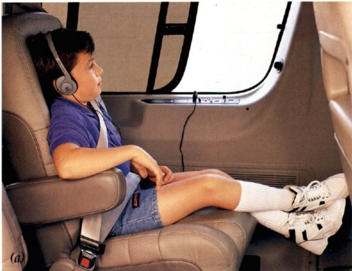
(a) Aerostar stereo systems provide rear radio controls and headphone jacks. The headphones, included with the optional electronic AM/FM stereo radio/cassette tape player, are shipped separately after delivery.