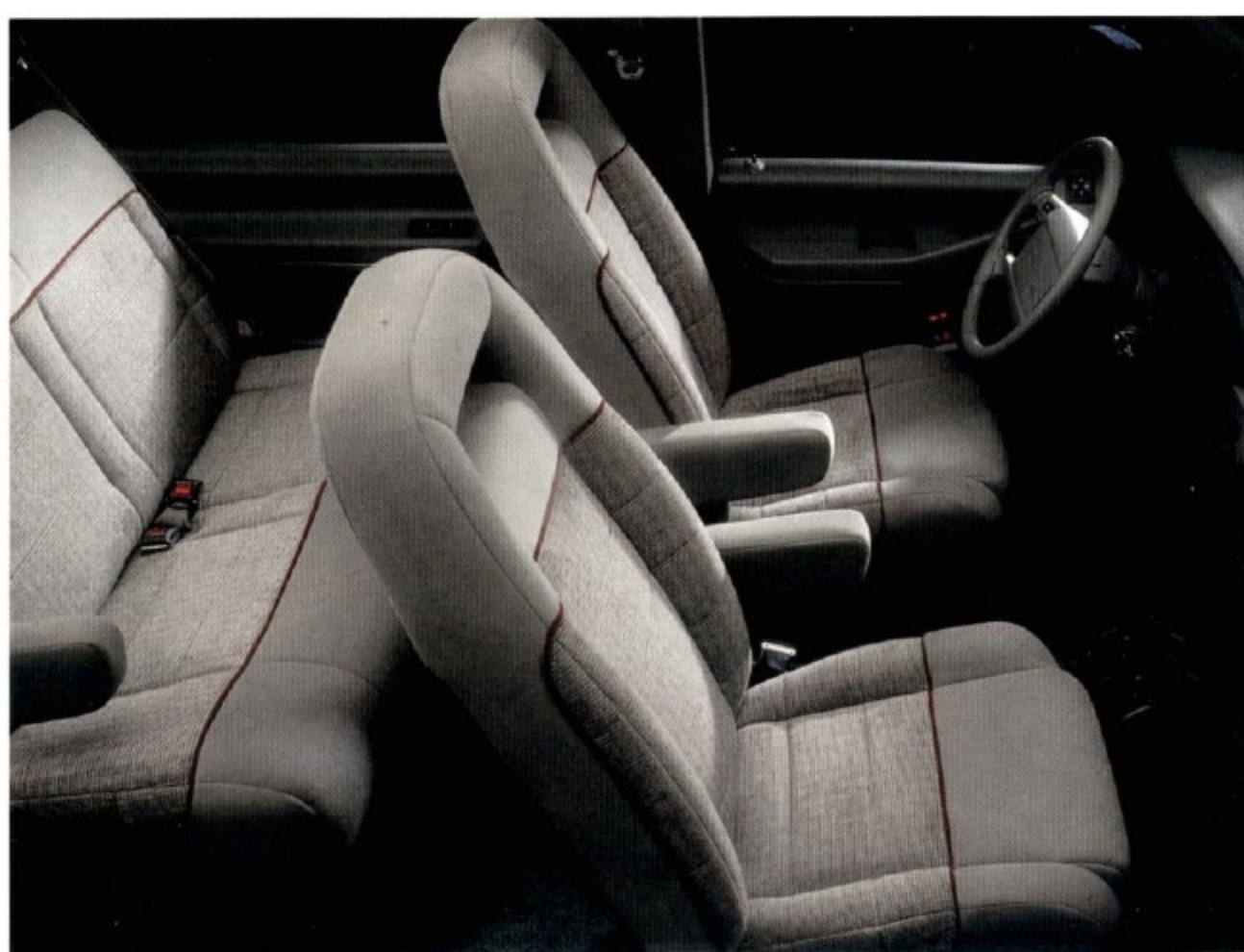
Above: Aerostar XLT interior in Medium Grey. Standard 7-passenger seating features dual front captain's chairs (with power lumbar adjustment and map pockets) and 2- and 3-passenger rear bench seats.