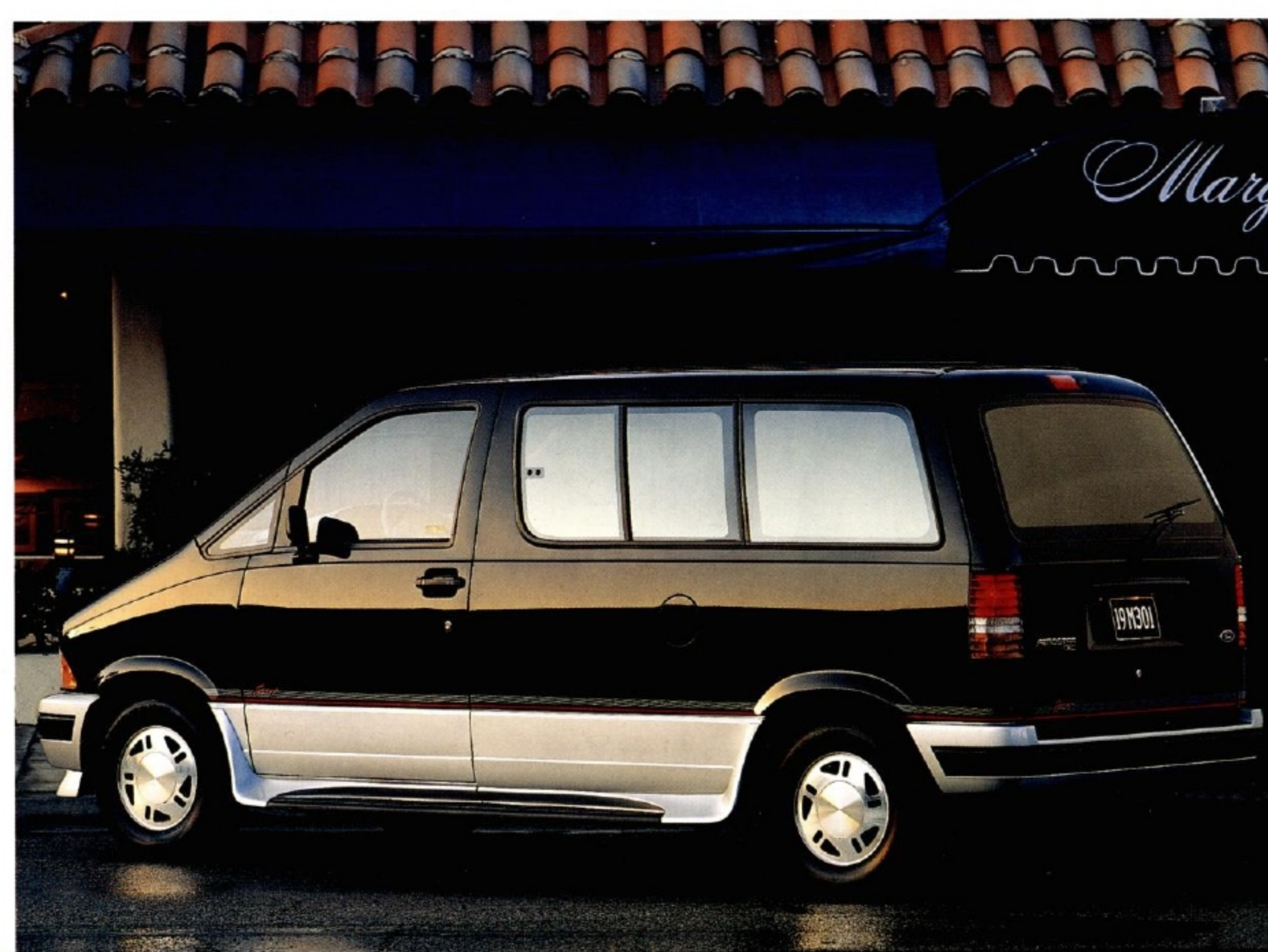
Above: Extended-length Aerostar XLT in Bimini Blue Clearcoat Metallic.