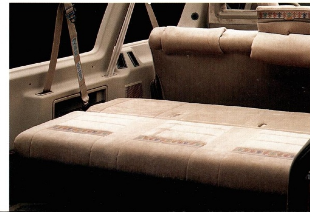
Below: The versatile rear seat/bed option (standard in Eddie Bauer) is the kind of feature you would find in a luxurious van conversion.