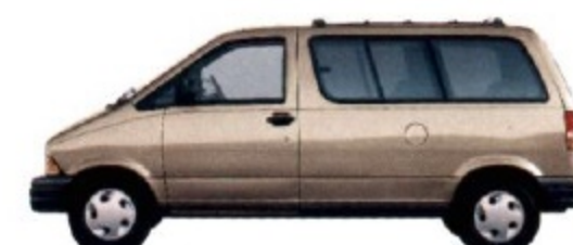
Mocha Frost Clearcoat Metallic