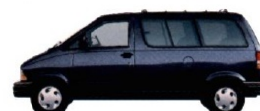
Dark Blue Clearcoat Metallic