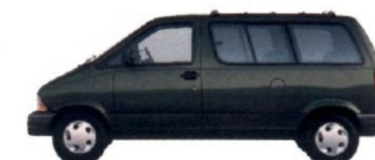
Medium Willow Green Clearcoat Metallic

The versatile rear seat/bed, optional with the extended-length Aerostar, is the kind of feature you would find in a luxury van conversion.