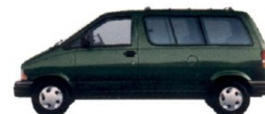
Deep Emerald Green Clearcoat Metallic