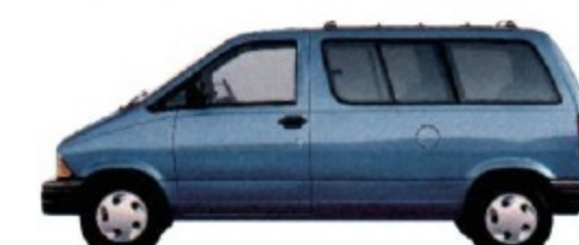
Brilliant Blue Clearcoat Metallic