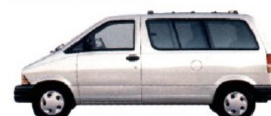
Oxford White Clearcoat