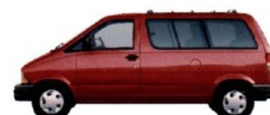
Electric Red Clearcoat Metallic