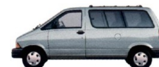
Light Willow Green Clearcoat Metallic