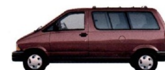
Iris Frost Clearcoat Metallic