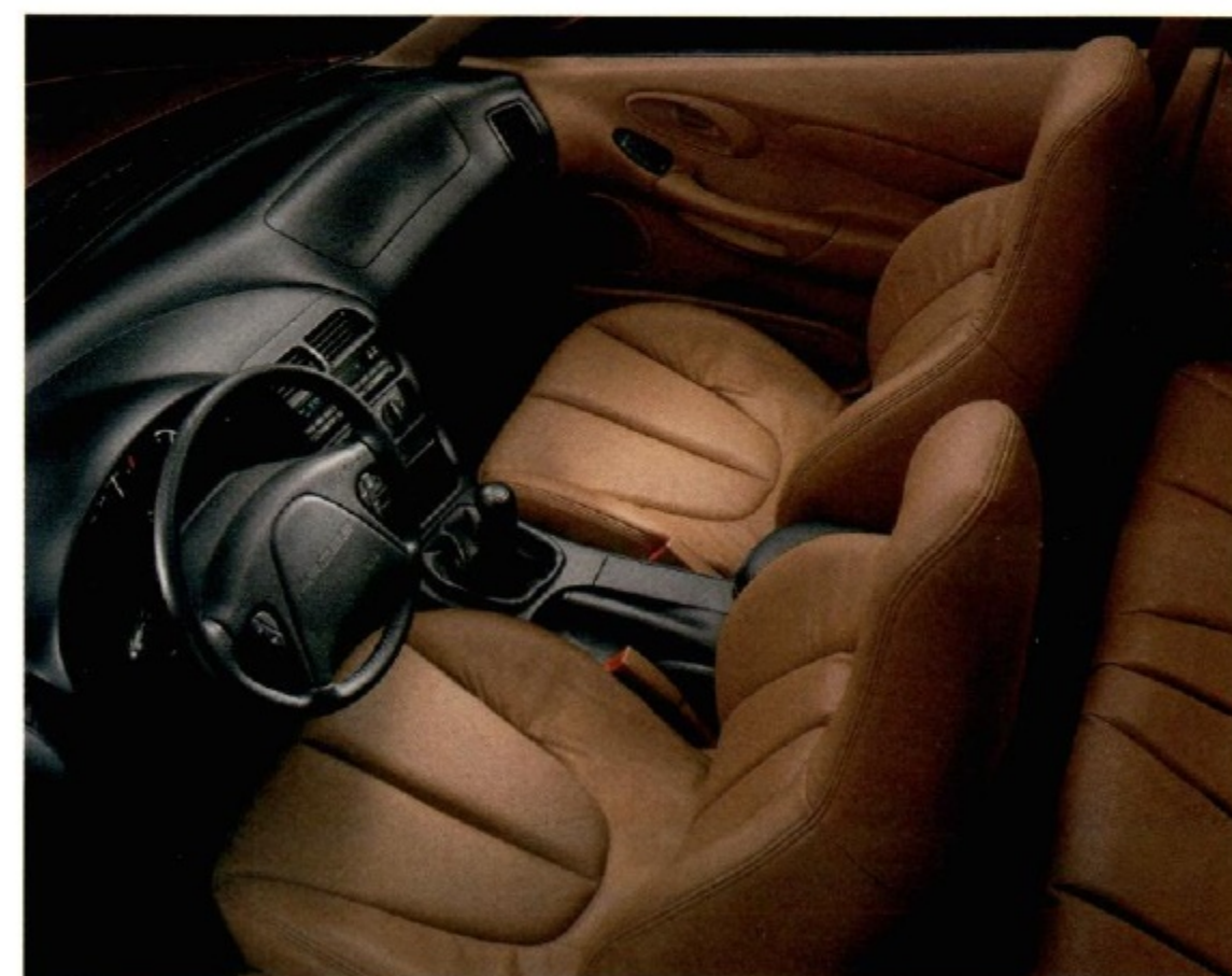
Above and right: Probe GT instrumentation and interior shown in Saddle with optional leather seating surfaces.

Some equipment shown on these pages may be optional.