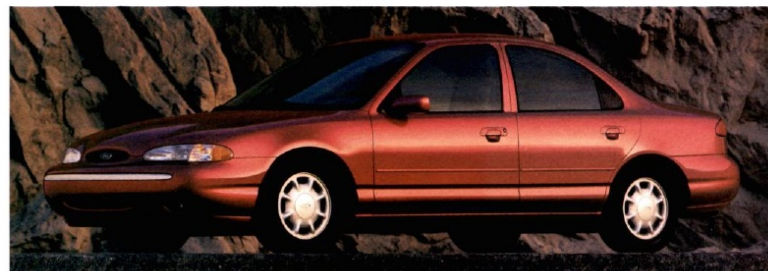
Major photo: Contour SE sport sedan in Champagne Clearcoat Metallic.

Ford Contour is a World Car for the 21st Century. But why wait? It's yours to enjoy today.