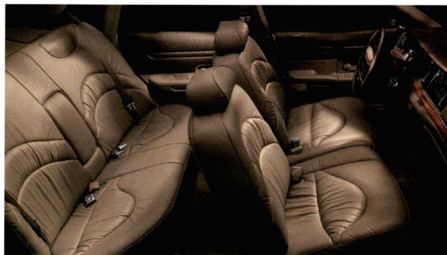
Right: The Crown Victoria LX interior with optional leather seating surfaces shown in Saddle.

Some equipment shown on these pages may be optional.