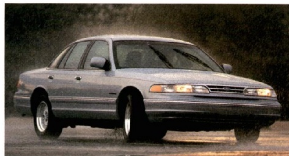
Above: Crown Victoria LX in Silver Frost Clearcoat Metallic.

Some equipment shown on these pages may be optional.