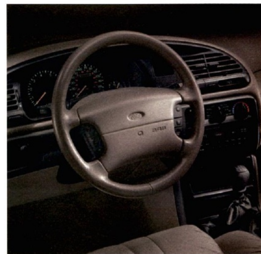
Right: Contour SE instrument panel shown in Pumice.

Some equipment shown on these pages may be optional.