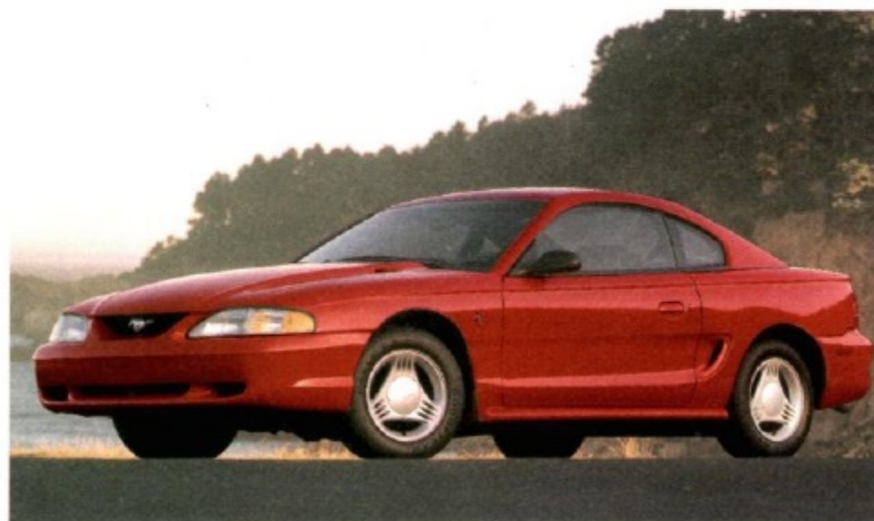
Above: Mustang coupe in Rio Red Tinted Clearcoat.

The MACH 460 puts out 230 watts RMS (460 watts peak power), has a 60-watt parametrically equalized amplifier for precise fine-tuning (there's individual equalization in coupe and convertible), two 85-watt subwoofer amplifiers, four subwoofer speakers, plus four 2 1/2" midrange/tweeters.