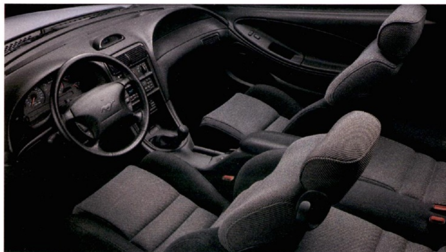
Right: The Mustang GT interior in Black.

Some equipment shown on these pages may be optional.