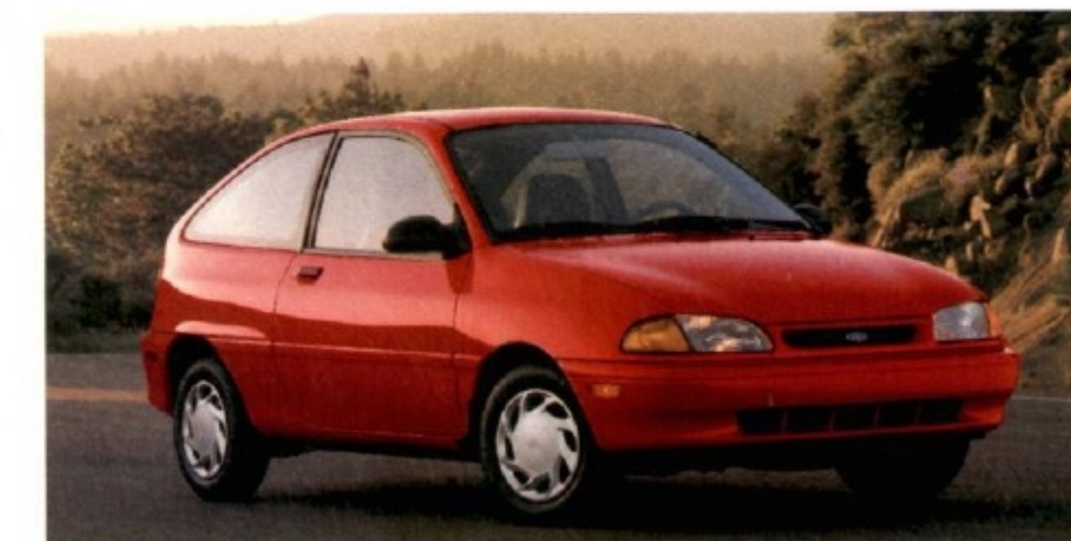
Above: Aspire 3-Door in Vibrant Red.