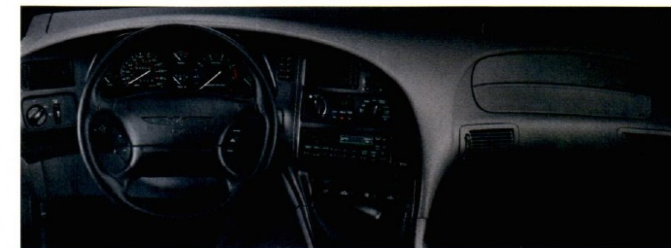
Left: The well-equipped and luxuriously trimmed Thunderbird LX interior in Opal Grey.