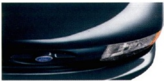
Deep Forest Green Clearcoat Metallic OG, M