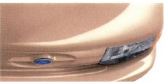
Tucson Bronze Clearcoat Metallic 2) M