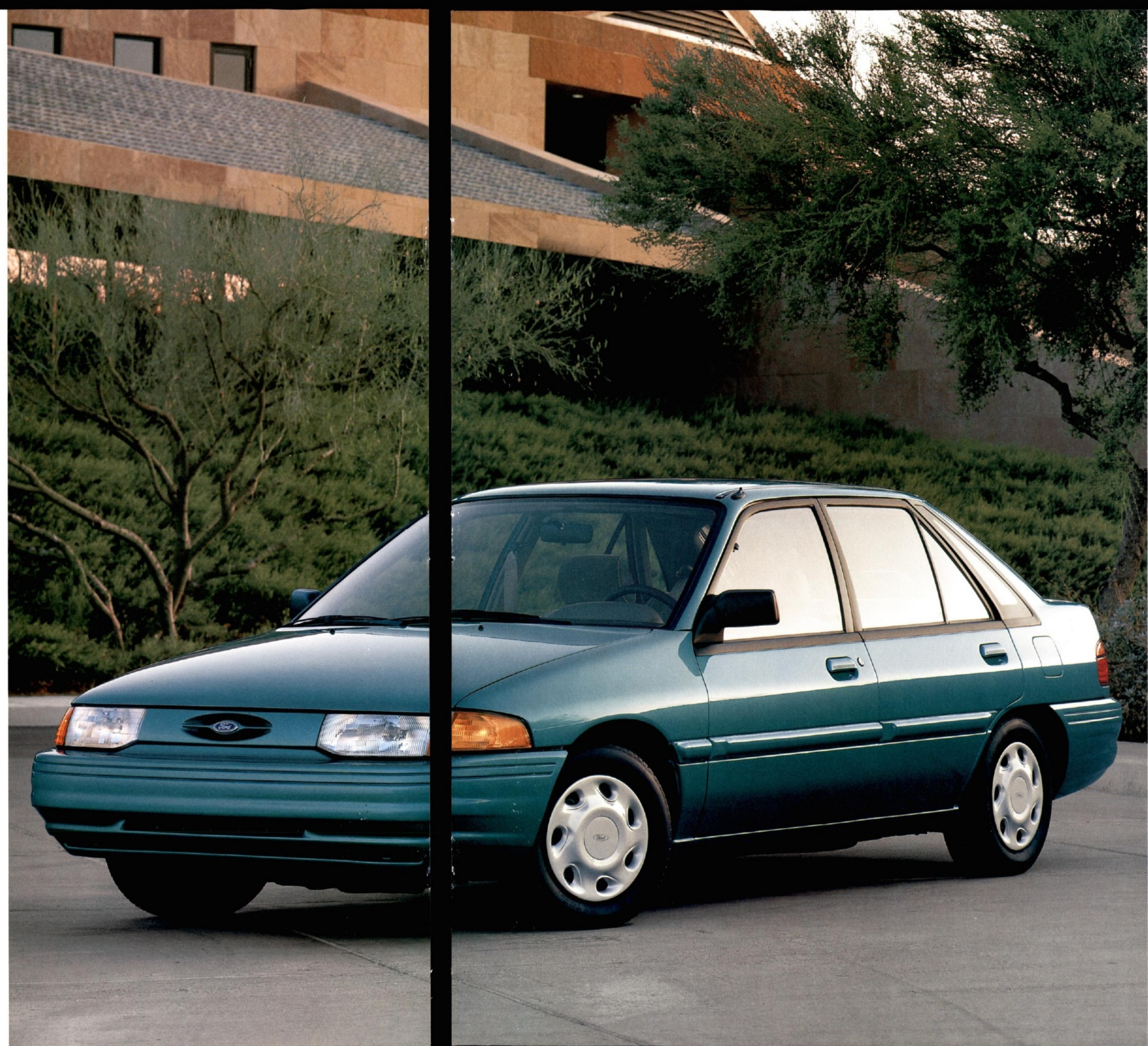
Escort LX 5-Door in Bright Calypso Green Clearcoat Metallic with the LX Preferred Equipment Package 322M.

Escort "One Price" LX models are a terrific value because they're equipped with features like air conditioning, power steering, AM/FM radio—great features that many buyers would order anyway—all in a convenient package.