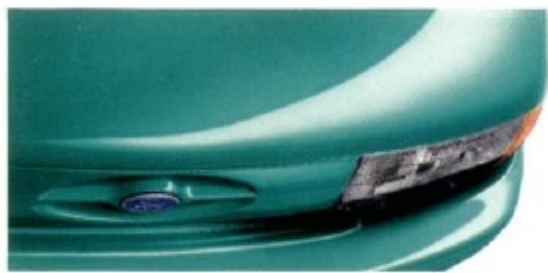
Bright Calypso Green Clearcoat Metallic OG, M