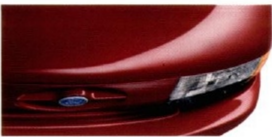
Electric Red Clearcoat Metallic 1) OG, M