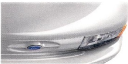
Silver Frost Clearcoat Metallic 2) OG, RB 1)