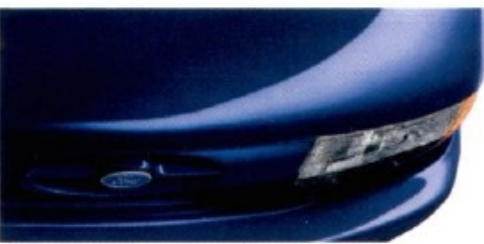
Royal Blue Clearcoat Metallic 2) OG, M, RB 1)