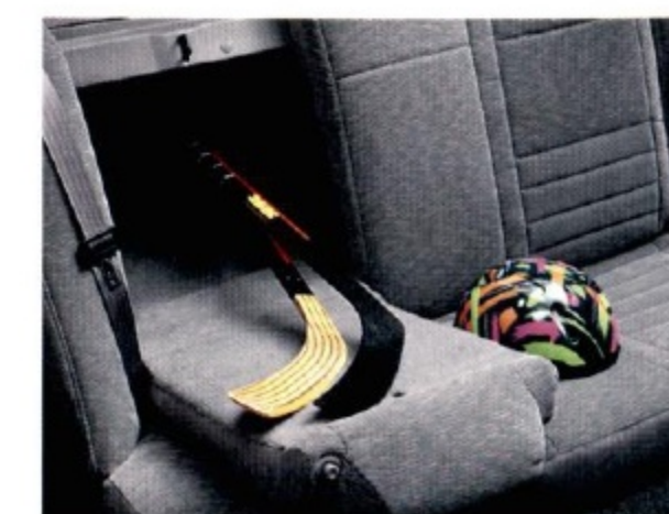
The LX split/fold rear seat provides versatility for managing people and cargo.