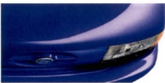
Ultra Violet Clearcoat Metallic 4) OG