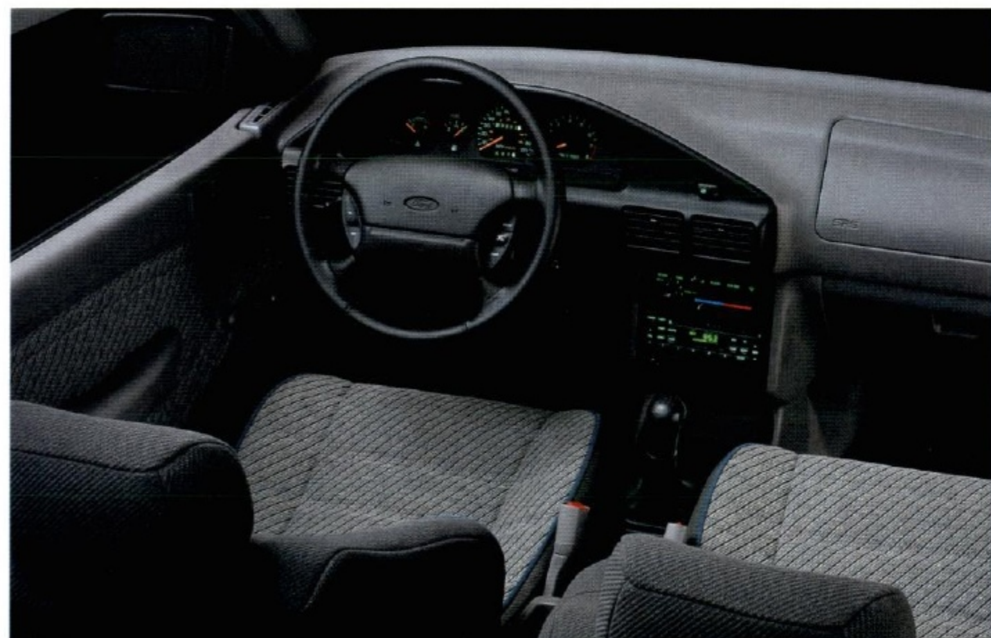
Escort GT's well-appointed interior features sport buckets and a restyled instrument panel with performance cluster. It's shown here with the GT Preferred Equipment Package and optional items.

The 1.8-liter engine's 16-valve configuration puts four at each cylinder (two for intake, two for exhaust) for higher power output.