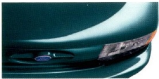
Cayman Green Clearcoat Metallic 3) OG, M