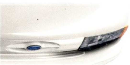
Oxford White OG, M, RB 1)