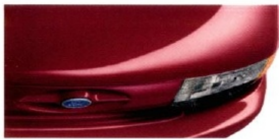
Sunrise Red Clearcoat Metallic OG, M

*With rear seat back(s) folded down. †With rear seat back(s) up.