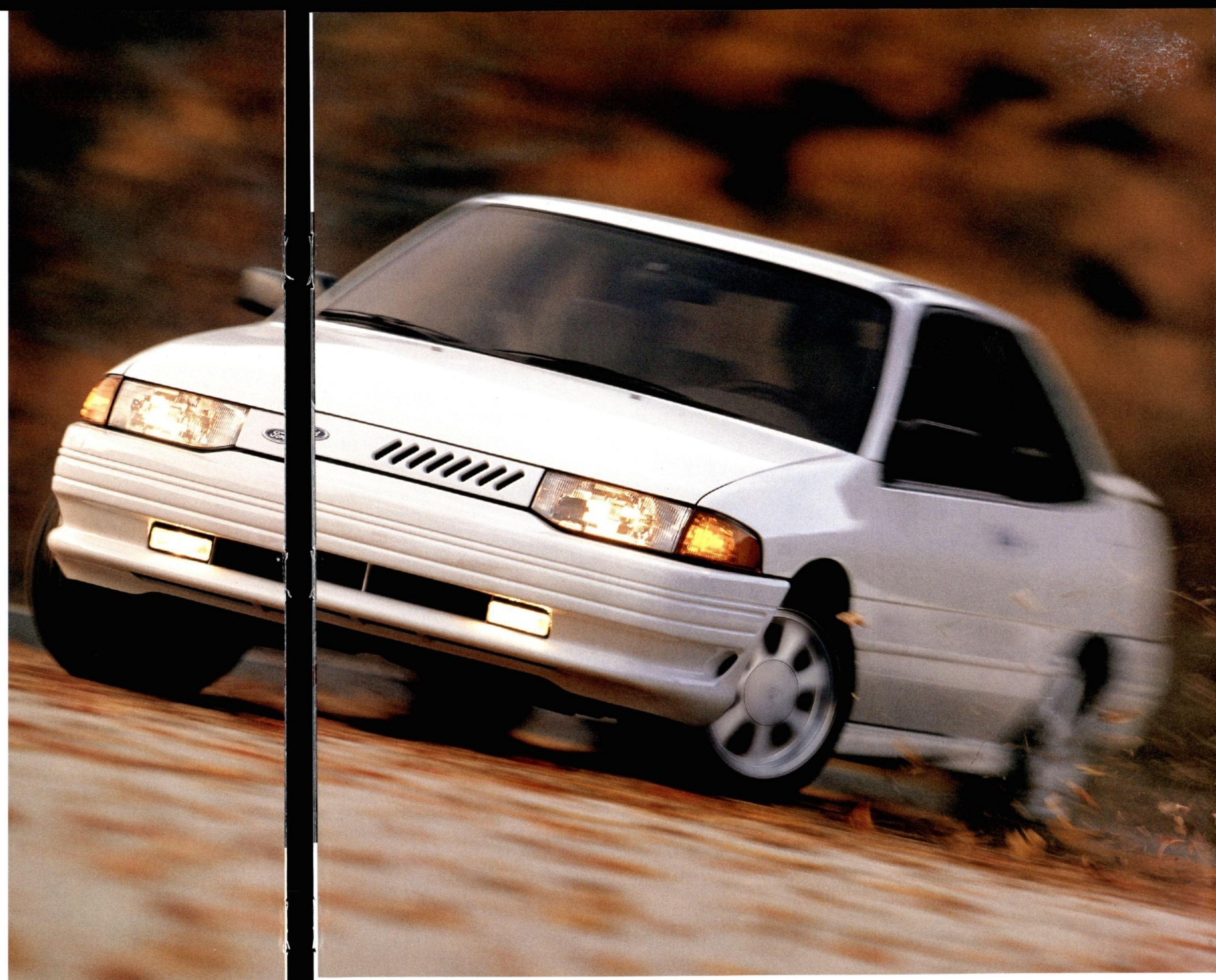
Escort GT in Oxford White shown with the GT Preferred Equipment Package.