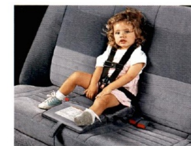
The new integrated child seat is optional with LX models and is available in Opal Grey or Mocha.