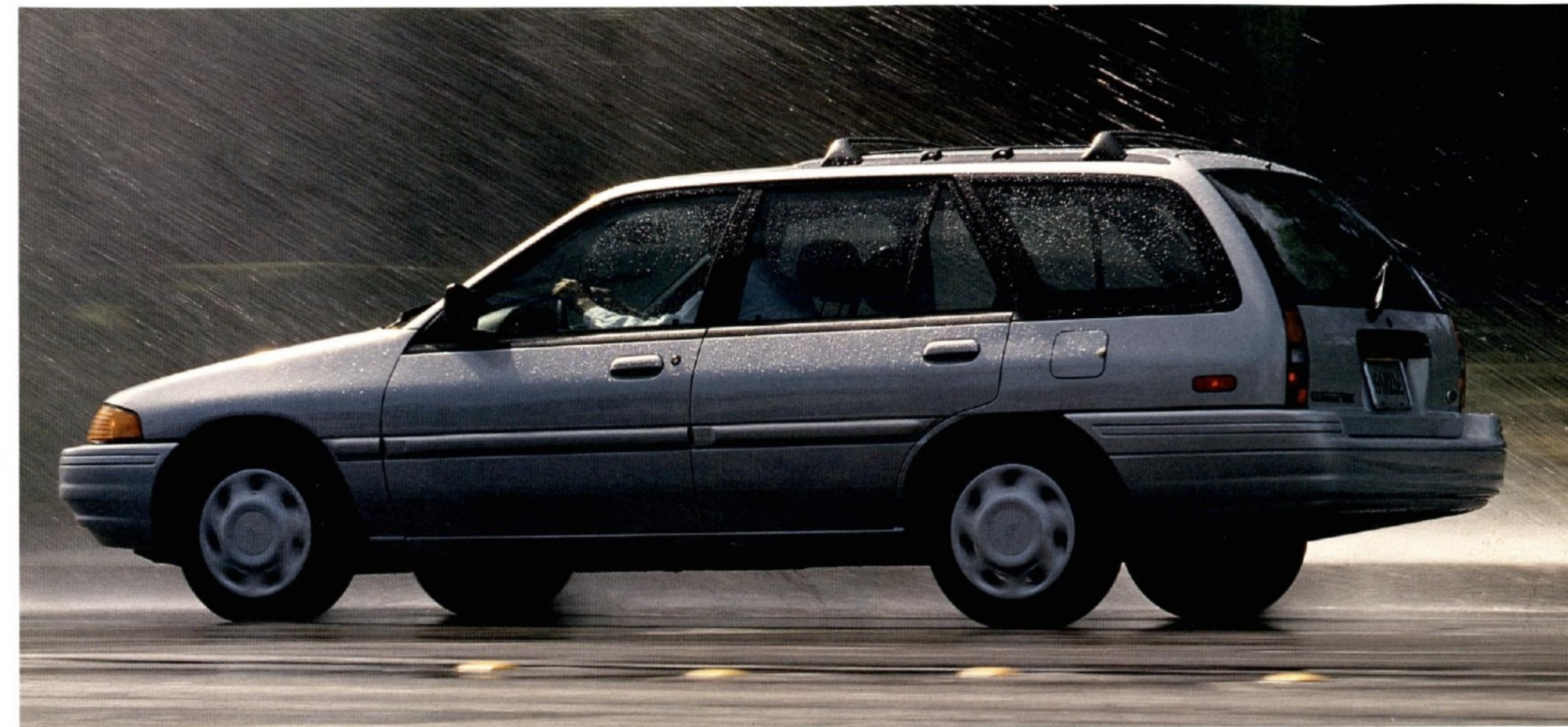
Above: Front-wheel drive puts engine weight over the driving wheels for better traction. Power front disc brakes and all-season tires are standard.

An example of under-the-skin vehicle integrity is finish quality. Escort benefits from improved metal finishing processes along with trained per-