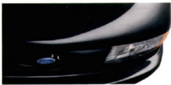
Black OG, M, RB 1)

OG = Opal Grey M = Mocha RB = Royal Blue