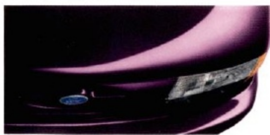
Deep Iris Clearcoat Metallic 3) OG, M