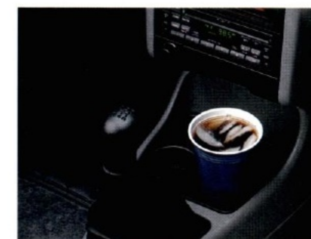
A handy center console with integral cup holders is standard equipment in all Escort models. Compact disc radio shown is optional.