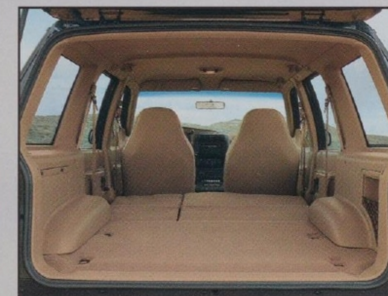
Explorer has more overall passenger and cargo space than any top-selling vehicle in its class: 42.6 cubic foot volume with the rear seat up, 81.6 cubic feet with the seat backs down.

The 1995 Explorer still has all of the things on the inside that has helped make it the compact sport utility leader.