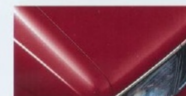
Electric Red Clearcoat Metallic