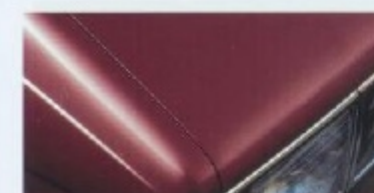
Iris Frost Clearcoat Metallic