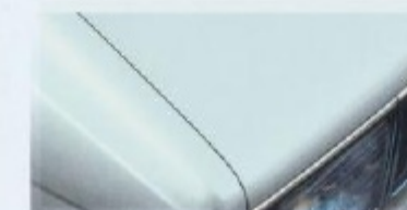
Oxford White Clearcoat