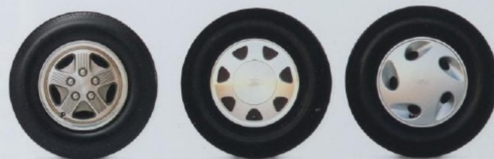
Left to right: styled wheel cover (part of exterior appearance group); optional forged aluminum wheel; standard full-face wheel cover.

Options shown or described are available at extra cost and may be offered only in combination with other options or subject to additional ordering requirements or limitations.