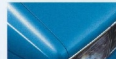
Brilliant Blue Clearcoat Metallic