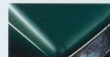
Deep Emerald Green Clearcoat Metallic