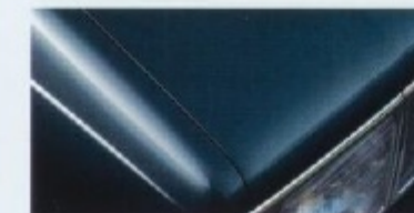
Dark Blue Clearcoat Metallic