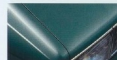
Medium Willow Green Clearcoat Metallic

Your Ford Dealer offers a variety of quality Ford-brand accessories that meet or exceed our strict specifications.