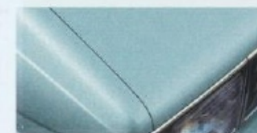
Light Willow Green Clearcoat Metallic