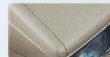
Mocha Frost Clearcoat Metallic