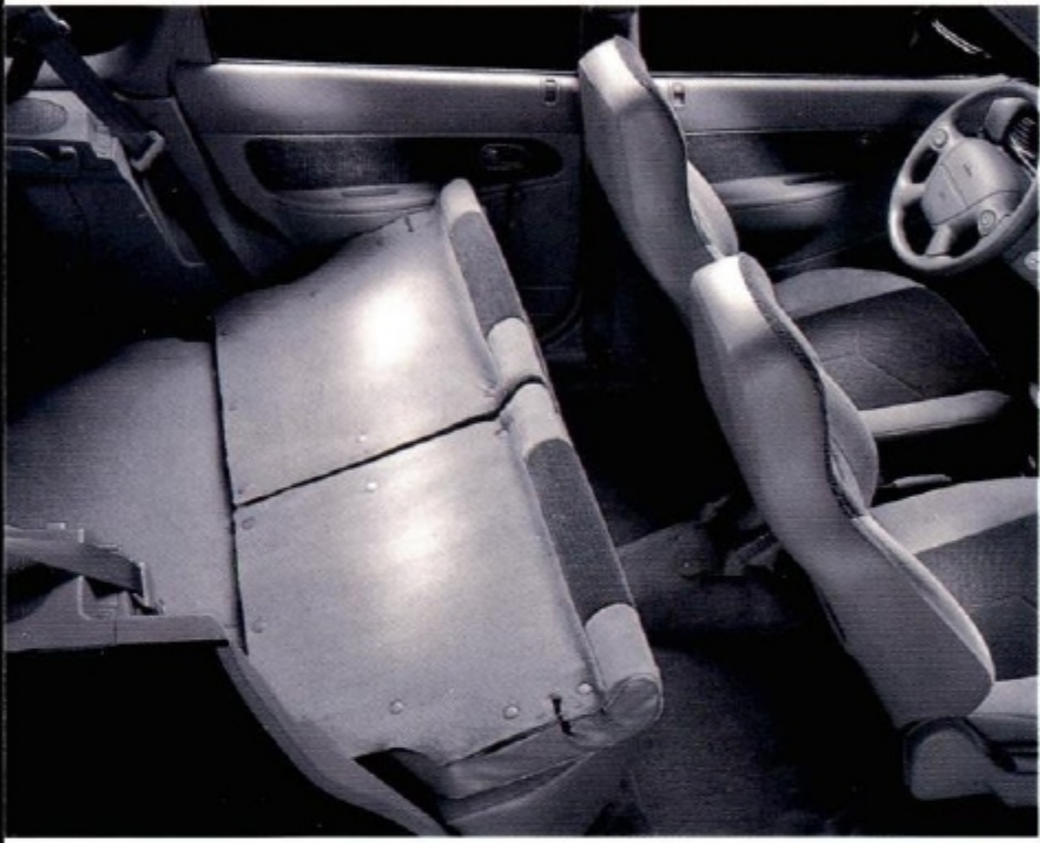
▲ ... or both can be folded down when cargo takes precedence. In the 3-door, the entire assembly can then be folded up against the front seat backs for increased cargo capability and a flat load floor (not shown).