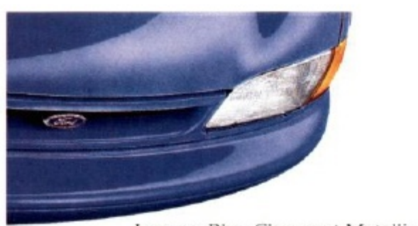
Laguna Blue Clearcoat Metallic