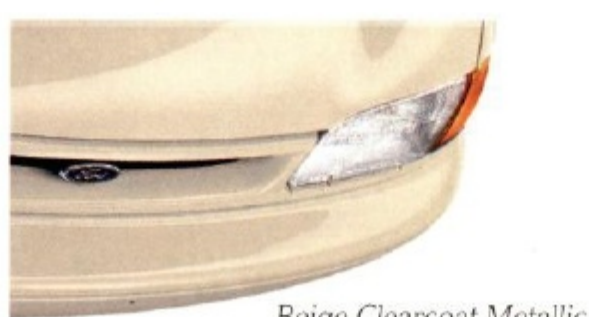
Beige Clearcoat Metallic