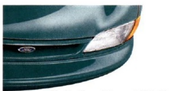
Pacific Green Clearcoat Metallic