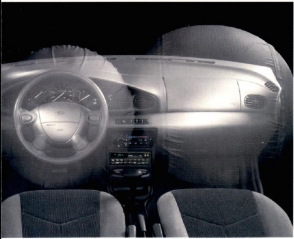
▲ Aspire was the first car in its class to provide standard driver and front passenger air bags to supplement the safety belts. It was also the first in its class to offer optional 4-wheel anti-lock brakes.