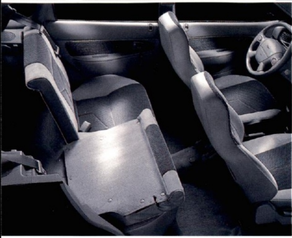
▲ Careful design has made Aspire ergonomically efficient. With the optional split seat backs, part of the Interior Decor and Convenience Group, one seat back can be folded forward to allow for oversized cargo and a passenger ...