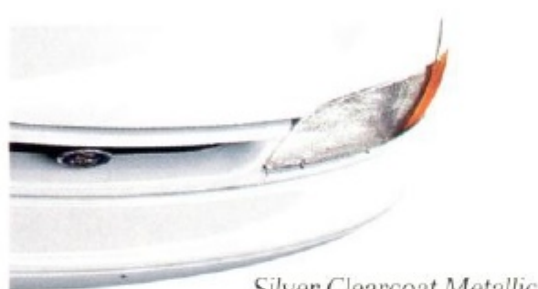
Silver Clearcoat Metallic