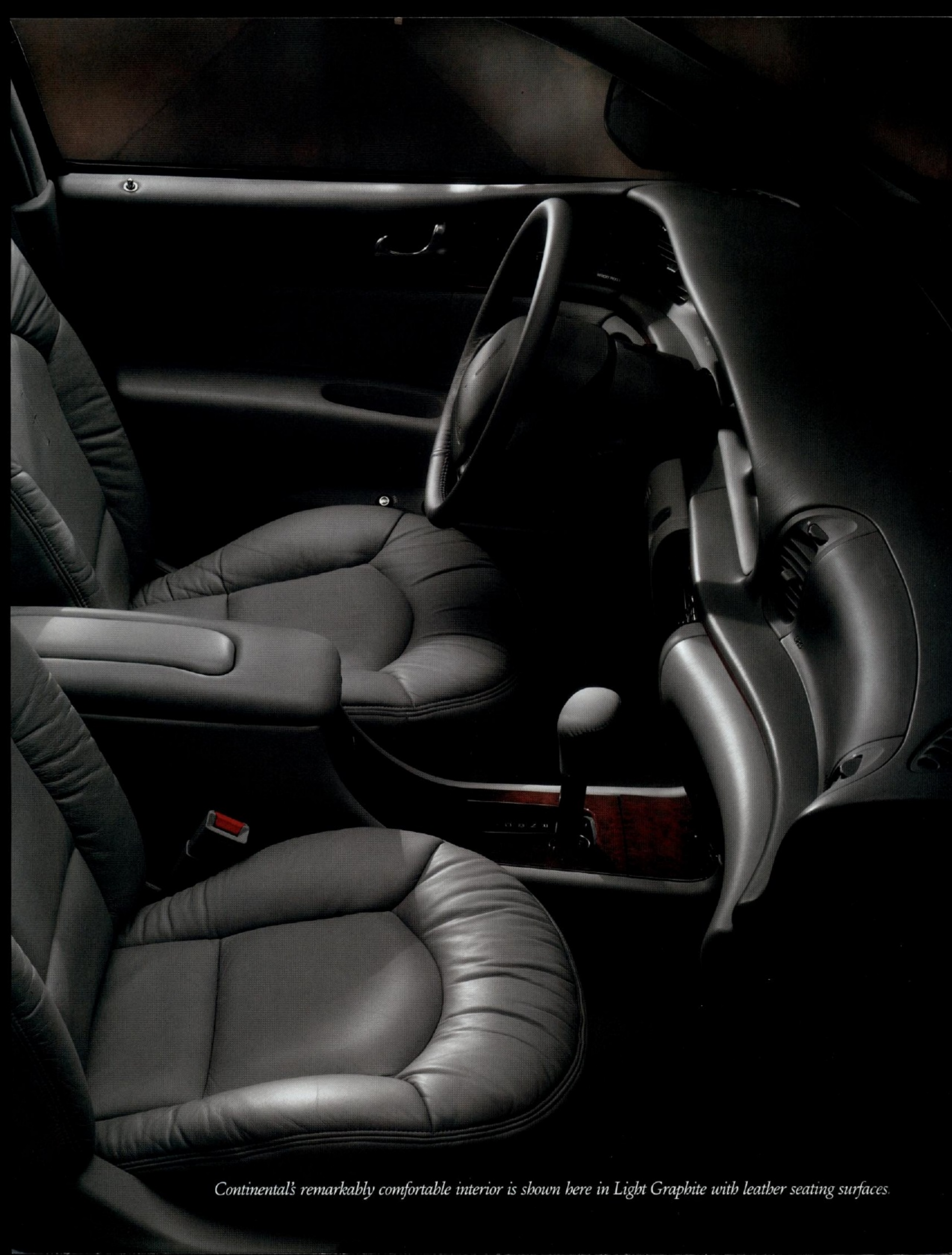
Continental's remarkably comfortable interior is shown here in Light Graphite with leather seating surfaces.