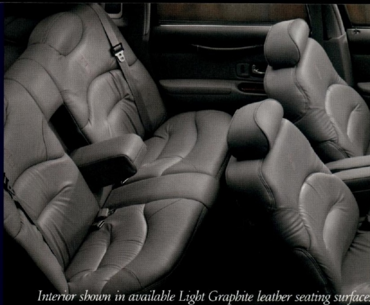
Interior shown in available Light Graphite leather seating surfaces