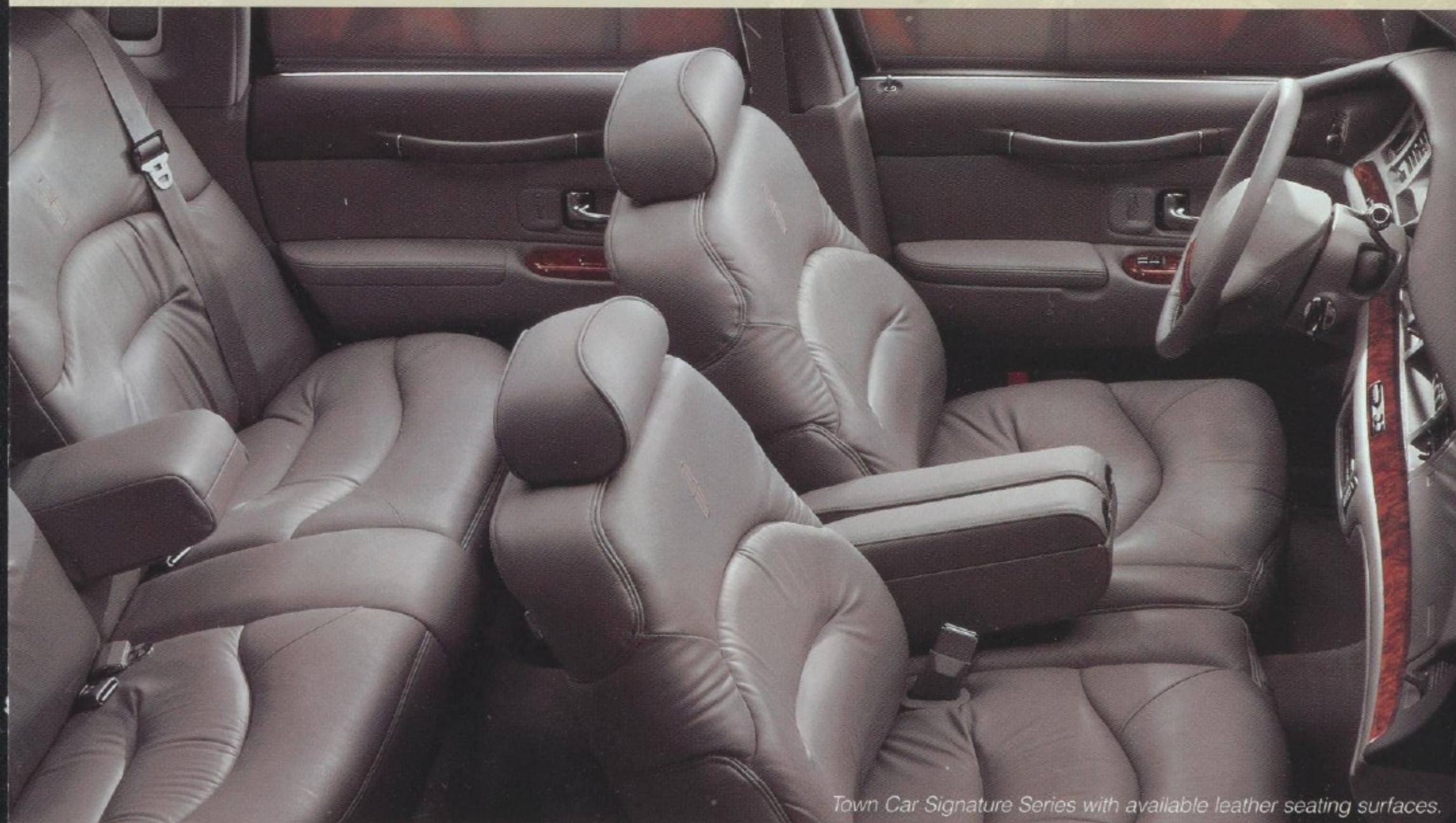
Town Car Signature Series with available leather seating surfaces.