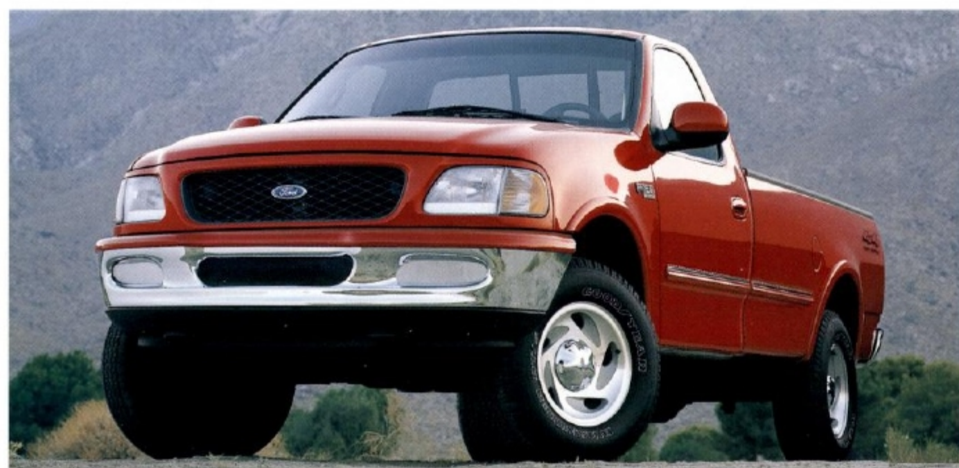
F-150 XLT Regular Cab 4x4 in Bright Red Clearcoat.