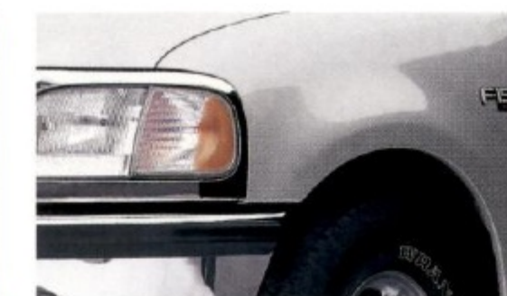
Silver Frost Clearcoat Metallic