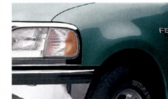
Pacific Green Clearcoat Metallic