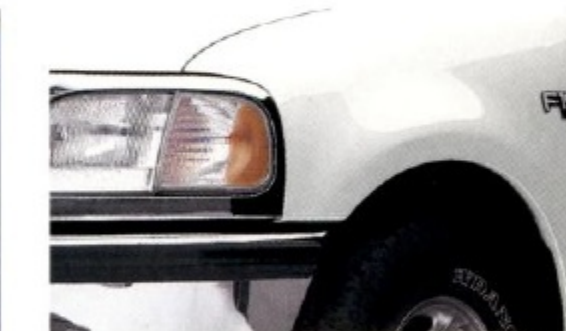
Oxford White Clearcoat