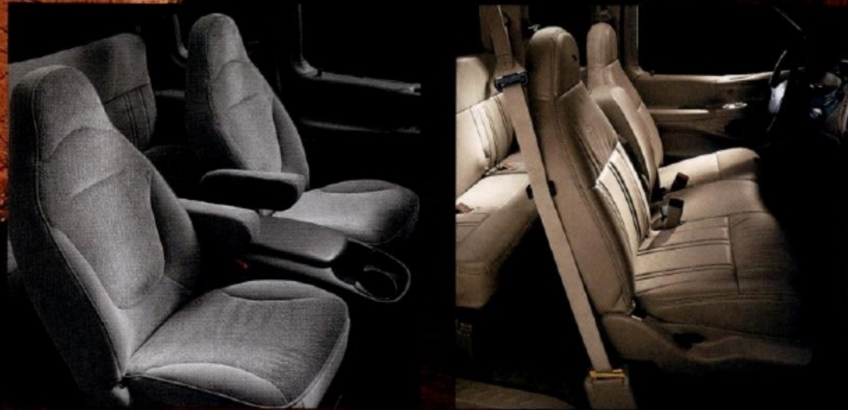
The F-150 XLT's optional captain's chairs/console.

Seats in the new Ford F-150 were carefully designed for firm and supportive comfort. The Standard and XL trim levels feature a 3-passenger split-back bench seat; the XLT and Lariat trim levels have a 40/60 split bench seat with individual recliners and a center fold-down armrest/storage bin. But the most notable feature of all is the new 3-passenger 40/60 rear split bench seat that you will find available only in an F-150 SuperCab. Flip the 40-section seat cushion forward and add more cargo space while seating two rear passengers. Or flip the 60-section cushion forward and get even more cargo space while still allowing room for a passenger. It's a versatile feature that no other extended-cab pickup can match.