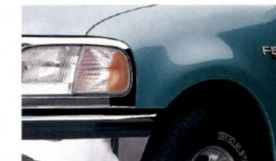
Teal Clearcoat Metallic