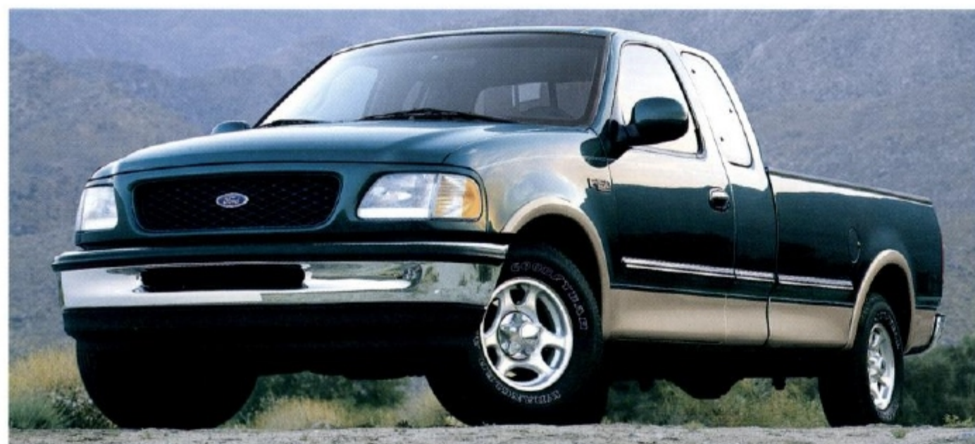
F-150 Lariat SuperCab 4x2 in two-tone Pacific Green Clearcoat Metallic over Light Saddle Clearcoat Metallic.