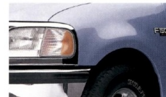
Portofino Blue Clearcoat Metallic