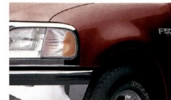
Dark Toreador Red Clearcoat Metallic