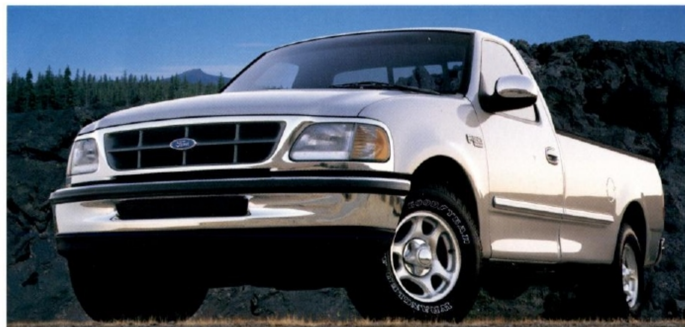
F-150 XLT Regular Cab 4x2 in Silver Clearcoat Metallic.

Ford Division reserves the right to change product specifications at any time without incurring obligations. Options shown or described are available at extra cost and may be offered only in combination with other options or subject to additional ordering requirements or limitations.