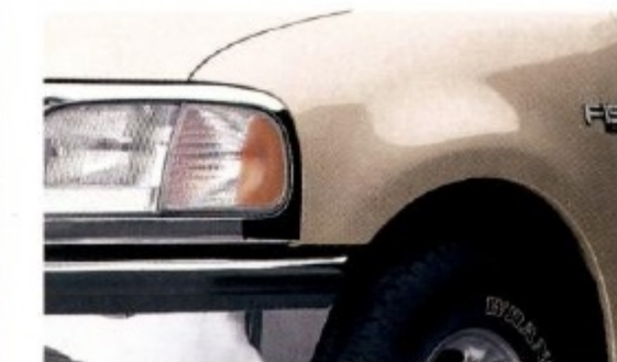
Light Saddle Clearcoat Metallic