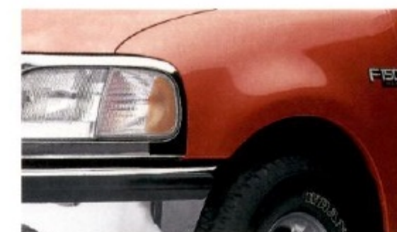
Bright Red Clearcoat