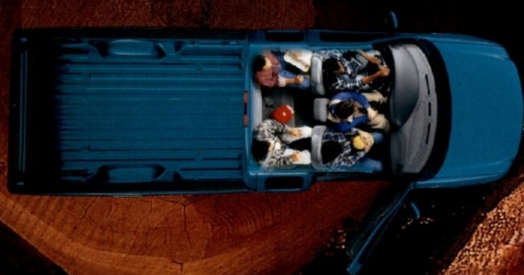
The Lariat's 40/60 split bench front seat has leather seating surfaces.

There's seating for three up front. And the 3-passenger 40/60 rear split bench seat provides extra cargo-carrying capability while allowing seating for two passengers (40-section cushion folded forward) or one (60-section cushion folded forward).