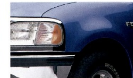
Moonlight Blue Clearcoat Metallic