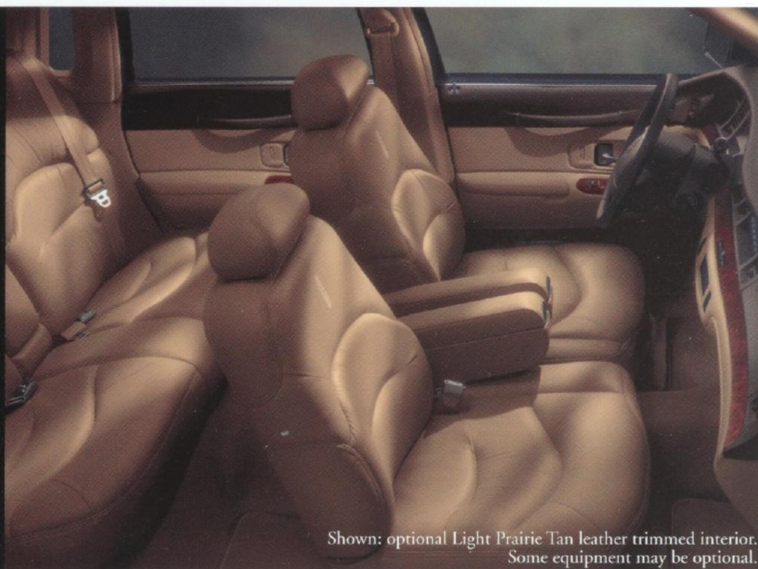
Shown: optional Light Prairie Tan leather trimmed interior. Some equipment may be optional.

Some luxury sedans can seat four occupants quite adequately. But at Lincoln, we believe you shouldn't have to place a limit on friendship or space. That's why you'll find Town Car accommodates six adults very comfortably, whether you're taking off for a long weekend or just a night out.