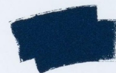
Deep Navy Clearcoat Metallic