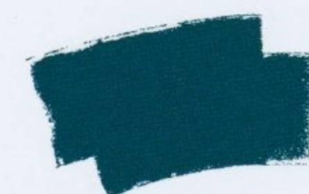
Pacific Green Clearcoat Metallic