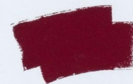
Cabernet Red Clearcoat Metallic