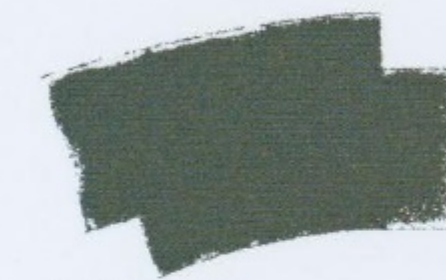
Spruce Green Clearcoat Metallic