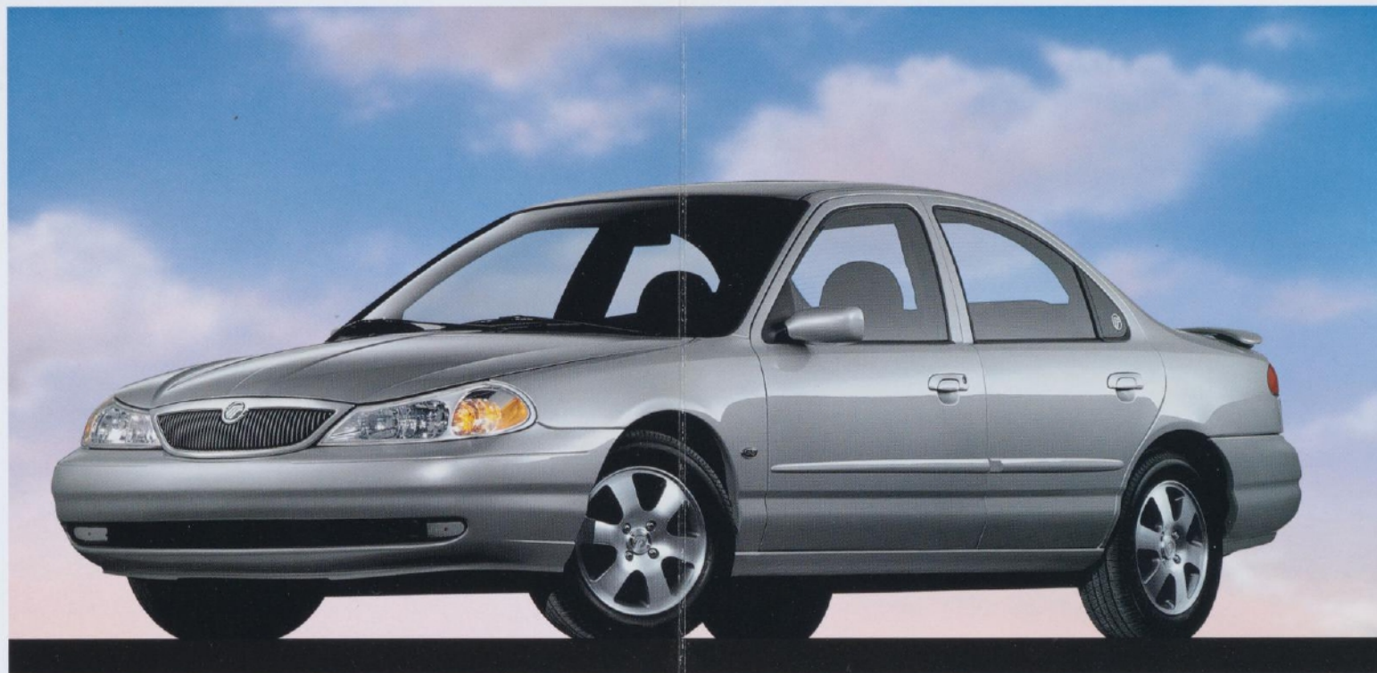
Shown with optional wheels

The Mystique Sport Edition comes with the kind of features you'll really enjoy. It includes a leather-wrapped steering wheel and shifter, fog lamps, special floor mats, Sport badging and a rear spoiler.