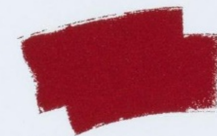
Toreador Red Clearcoat Metallic