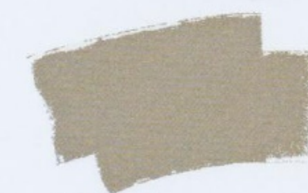
Light Prairie Tan Clearcoat Metallic