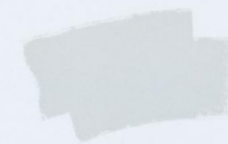
Vibrant White Clearcoat