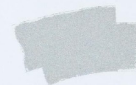
Silver Frost Clearcoat