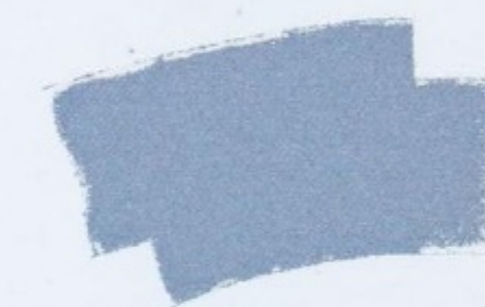
Light Denim Blue Clearcoat Metallic