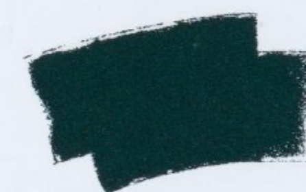
Dark Green Satin Clearcoat