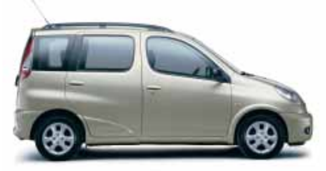
583 Champagne (m)