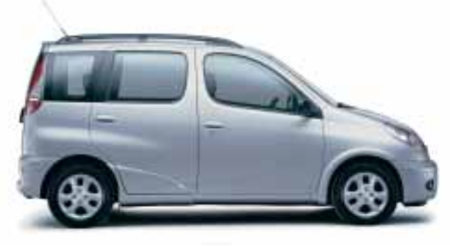
1E7 Crystal Silver (m)