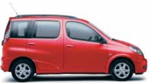
3P0 Chilli Red