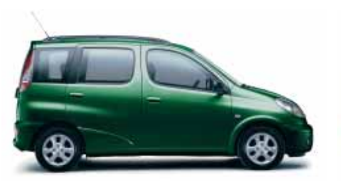
6R4 Island Green (m)