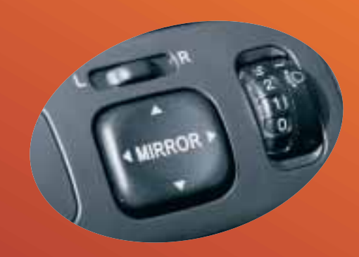
Electric door mirrors - one of the many standard features on the generously equipped Yaris Verso.

The flexible Yaris Verso can be tailored to fit around your lifestyle offering comfort and space for the whole family.