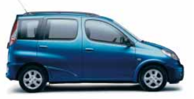
8M6 Lagoon Blue (m)