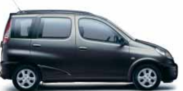
209 Eclipse Black (m)