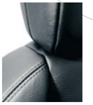
Astrakan Black leather