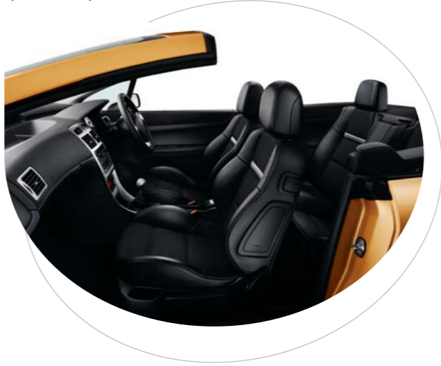
Speedline Grey/Black cloth/leather