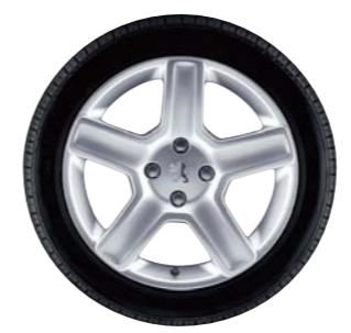
17" CHALLENGER (SE. An option on S 2.0. Not available on S 1.6)