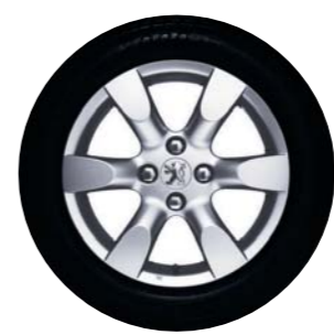
16" EQUINOX (S)