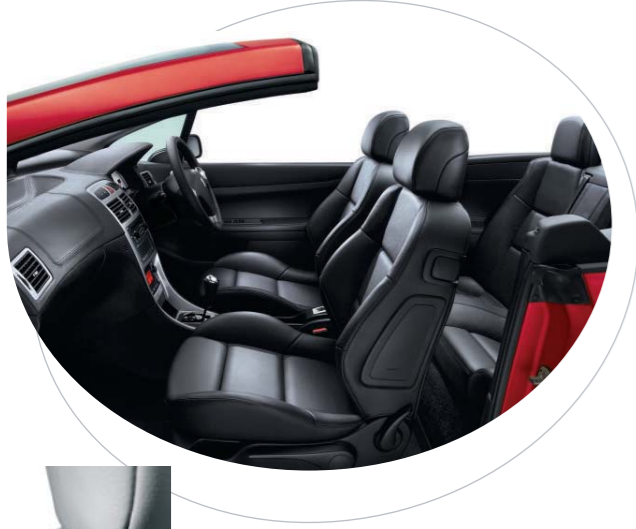
Astrakan Black leather