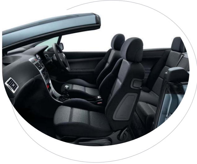
Andorra Black cloth