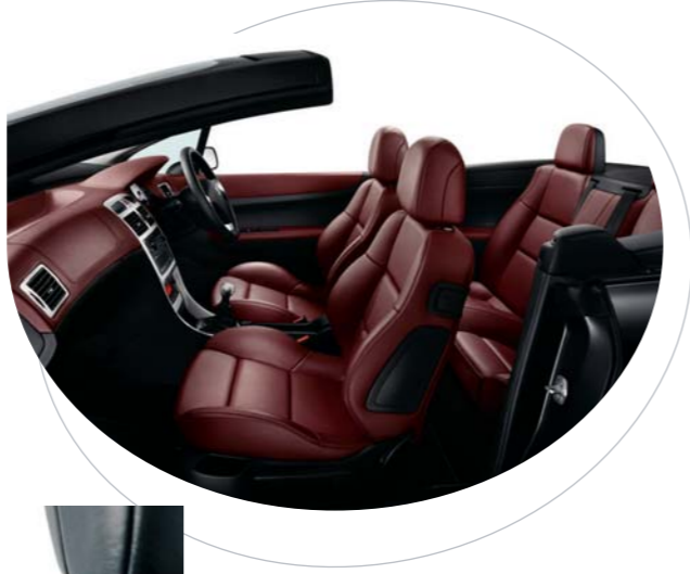
Cerbere Dark Red leather