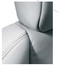
Lama Grey leather