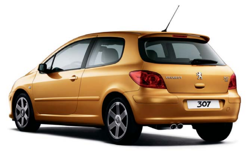
307 hatchback complete with rear spoiler, twin tailpipe exhaust, 17" Aidel alloy wheels and chromed door handles.